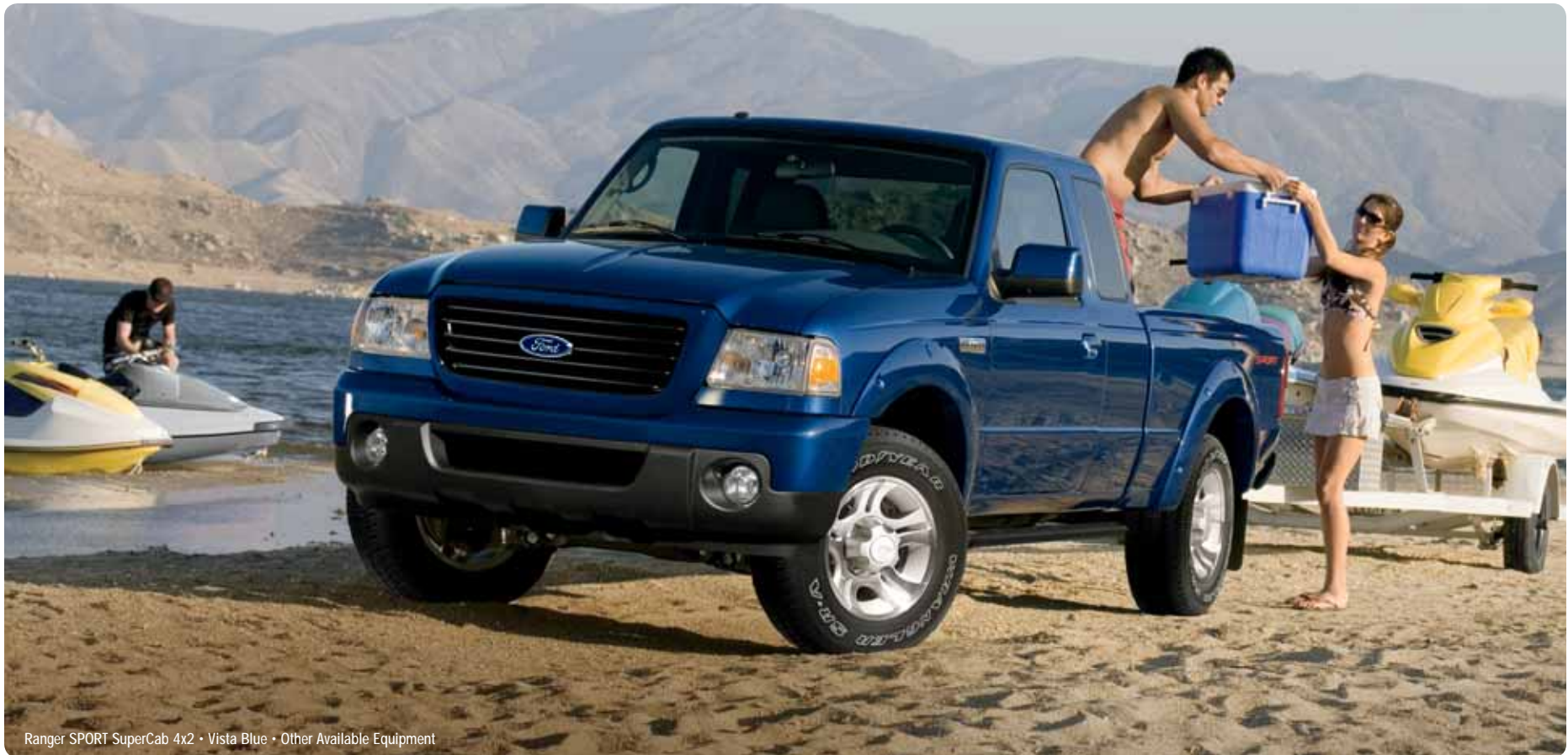
Ranger SPORT SuperCab 4x2 • Vista Blue • Other Available Equipment