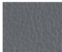
Medium Dark Flint Leather