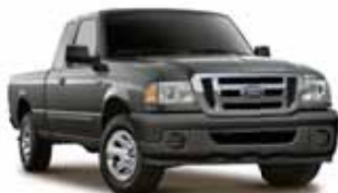
Dark Shadow Grey Metallic