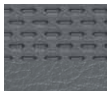
Medium Dark Flint Vinyl