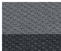
Medium Dark Flint Cloth

■ MEDIUM DARK FLINT ■ EBONY/RED ■ EBONY/BLUE ■ SOLID EBONY