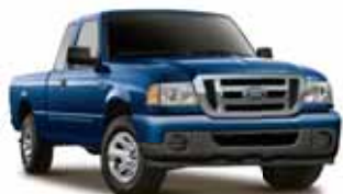
Vista Blue Metallic