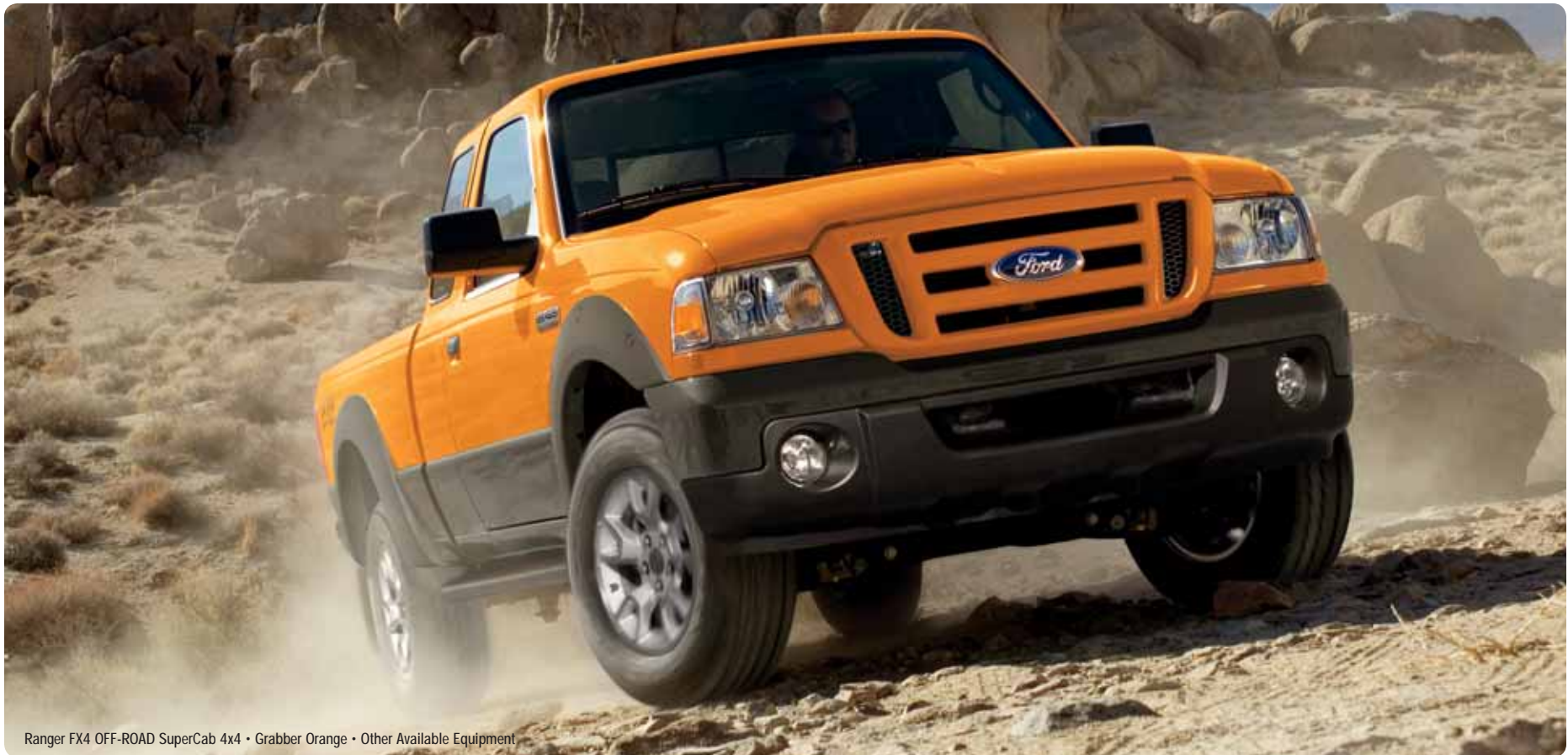
Ranger FX4 OFF-ROAD SuperCab 4x4 • Grabber Orange • Other Available Equipment