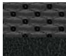
Solid Ebony Leather