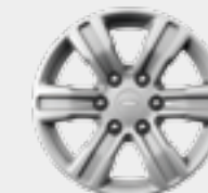
17" Silver-Painted Aluminum Standard

Trailer Tow Package (required for towing up to 7,500 lbs.): 4-pin/7-pin wiring harness and Class IV trailer hitch receiver