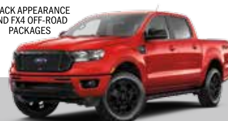
BLACK APPEARANCE AND FX4 OFF-ROAD PACKAGES