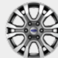
18" Machined Aluminum with Stealth Gray-Painted Pockets Standard

Trailer Tow Package (required for towing up to 7,500 lbs.): 4-pin/7-pin wiring harness, and Class IV trailer hitch receiver