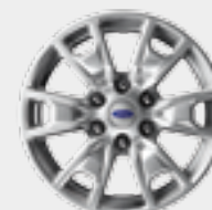
18" Chrome-Like PVD Included: Chrome Package 2