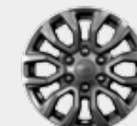
17" Magnetic-Painted Aluminum Included: Sport Package