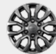
17" Magnetic-Painted Aluminum Included: Sport Package