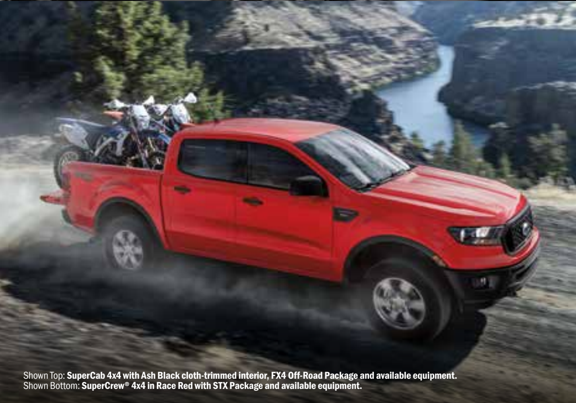
Shown Top: SuperCab 4x4 with Ash Black cloth-trimmed interior, FX4 Off-Road Package and available equipment. Shown Bottom: SuperCrew® 4x4 in Race Red with STX Package and available equipment.

EQUIPMENT GROUP 100A INCLUDES STANDARD FEATURES, PLUS: