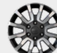
18" Machined Aluminum with Magnetic-Painted Pockets Optional: Sport Package²