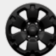
18" Black-Painted Aluminum with Black Center Caps Included: Black Appearance Package