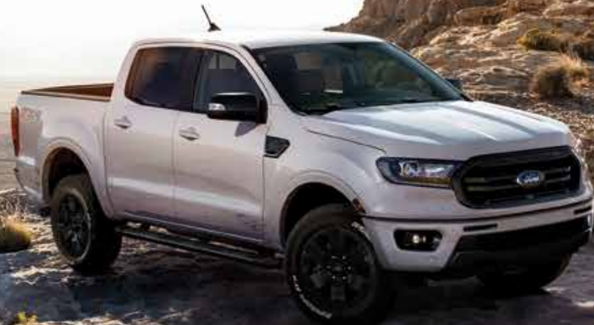
LARIAT SuperCrew® 4x4 in White Platinum with FX4 Off-Road and Black Appearance Packages, and available equipment.

Personal Safety System™ for driver and front passenger includes dual-stage front airbags, 3 safety belt pretensioners, safety belt energy-management retractors, safety belt usage sensors, driver's seat position sensor, crash severity sensor, restraint control module and Front-Passenger Sensing System Front-seat side airbags 3 Safety Canopy® System with side-curtain airbags 3 and rollover sensor 3-point safety belts for all seating positions AdvanceTrac® with RSC® (Roll Stability Control™) Individual Tire Pressure Monitoring System (excludes spare) SecuriLock® Passive Anti-Theft System