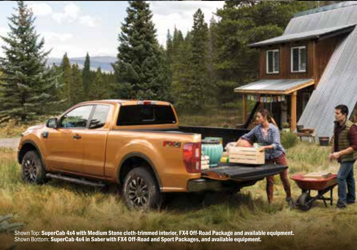
Shown Top: SuperCab 4x4 with Medium Stone cloth-trimmed interior, FX4 Off-Road Package and available equipment. Shown Bottom: SuperCab 4x4 in Saber with FX4 Off-Road and Sport Packages, and available equipment.

EQUIPMENT GROUP 300A INCLUDES SELECT XL FEATURES, PLUS: