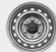
16" Silver Steel Standard

Chrome Package: ¹ chrome bumpers, halogen fog lamps, black front tow hooks, and body-color wheel-lip moldings STX Package: ¹ 17" Silver-painted aluminum wheels, halogen fog lamps, black front tow hooks, STX pickup box decals, and Ebony premium cloth-trimmed seats FX2 Package (4x2; requires STX Package): ¹ off-road tuned suspension, electronic-locking rear differential, off-road OWL tires, FX2 box decals, and off-road display in instrument cluster productivity screen FX4 Off-Road Package (4x4; requires STX Package): ¹ off-road tuned suspension, electronic-locking rear differential, off-road OWL tires, exposed steel bash plate, skid plates for fuel tank, transfer case and steering gear, FX4 Off-Road box decals, Terrain Management System,™ Trail Control,™ and off-road display in instrument cluster productivity screen Bed Utility Package: ¹ plastic drop-in bedliner and 12V in-bed powerpoint Trailer Tow Package (required for towing up to 7,500 lbs.): 4-pin/7-pin wiring harness and Class IV trailer hitch receiver