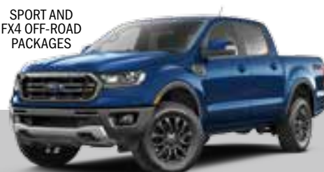
SPORT AND FX4 OFF-ROAD PACKAGES