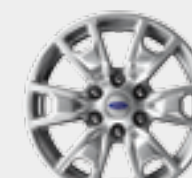
18" Chrome-Like PVD Optional: Chrome Package²