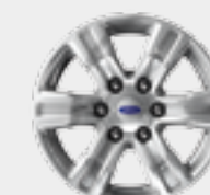
17" Chrome-Like PVD Included: Chrome Package