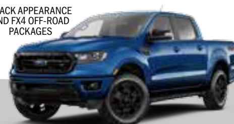
BLACK APPEARANCE AND FX4 OFF-ROAD PACKAGES