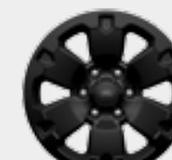
18" Black-Painted Aluminum with Black Center Caps Included: Black Appearance Package