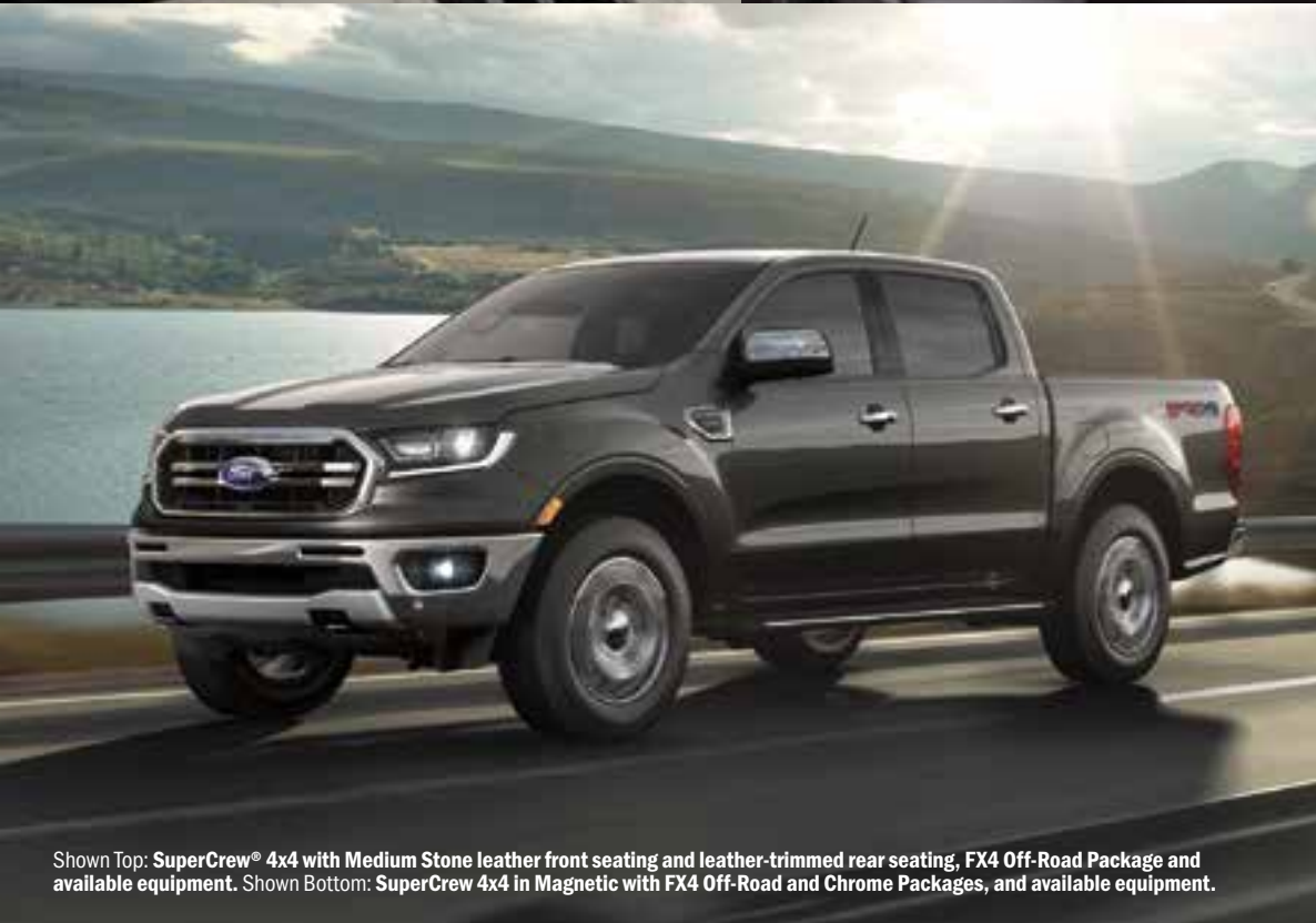
Shown Top: SuperCrew® 4x4 with Medium Stone leather front seating and leather-trimmed rear seating, FX4 Off-Road Package and available equipment. Shown Bottom: SuperCrew 4x4 in Magnetic with FX4 Off-Road and Chrome Packages, and available equipment.

EQUIPMENT GROUP 500A INCLUDES SELECT XLT FEATURES, PLUS: