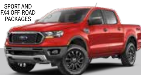
SPORT AND FX4 OFF-ROAD PACKAGES