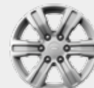
17" Silver-Painted Aluminum Included: STX Package