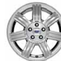
18" 7-Spoke Chrome-Clad Aluminum Optional on SEL, Eddie Bauer and Limited