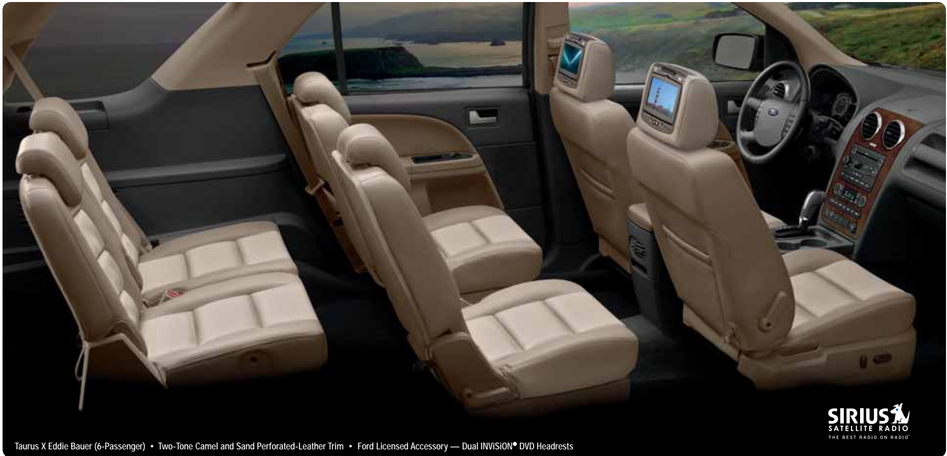
Taurus X Eddie Bauer (6-Passenger) • Two-Tone Camel and Sand Perforated-Leather Trim • Ford Licensed Accessory — Dual INVISION® DVD Headrests