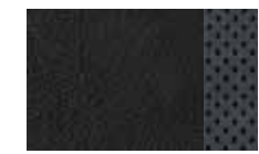
Charcoal Black Leather Standard on Limited