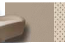
Camel Leather with Sand Leather Inserts Standard on Eddie Bauer