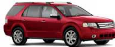
Sangria Red Metallic