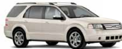
White Sand Tri-Coat Metallic