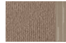
Camel Cloth Standard on SEL