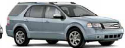
Light Ice Blue Metallic