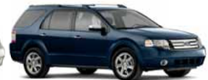
Dark Ink Blue Metallic

Ford uses clearcoat paint for beauty and protection. Colors shown are representative only. Not all colors are available on all models. See your dealer for actual paint/trim options. Vehicles shown may contain optional equipment.