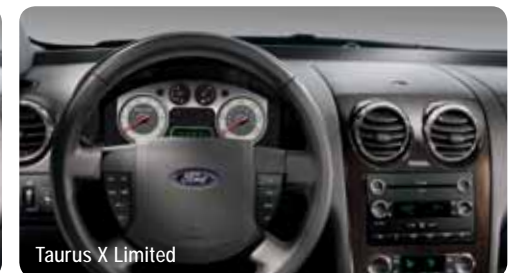
Taurus X Limited