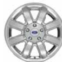
17" 8-Spoke Bright-Finish Aluminum Standard on SEL