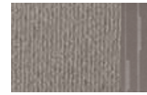
Medium Light Stone Cloth Standard on SEL