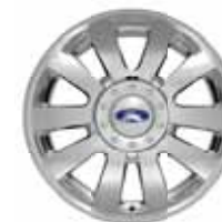
18" 5-Spoke Bright-Finish Aluminum Standard on Eddie Bauer and Limited