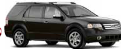
Tuxedo Black Metallic