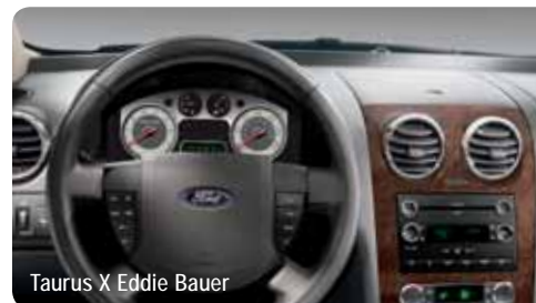
Taurus X Eddie Bauer