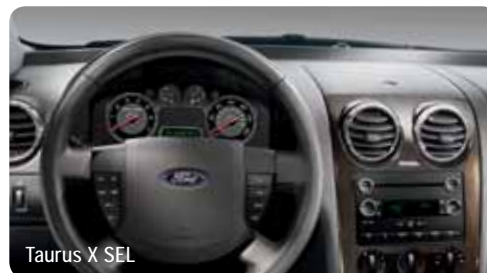
Taurus X SEL