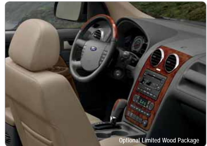
Optional Limited Wood Package

Includes genuine wood insert on steering wheel and woodgrain appearance on shift knob; plus woodgrain appliqué on center stack for Charcoal Black interior (Available on Limited)