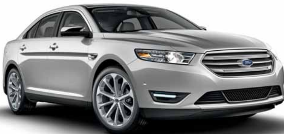
Ingot Silver Metallic. Available equipment.

Visit accessories.ford.com to shop the complete collection