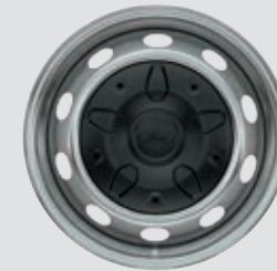
16" Silver Steel with Black Hubcap Standard: XL Passenger Wagon, SRW Van, and Cutaway & Chassis Cab