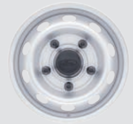
16" White Steel with Mini-Cap and Lug Nut Covers Optional: All SRW (Fleet only)