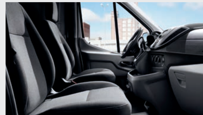
Cloth-trimmed 2 interior in Pewter with user-defined upfitter switches 2 and available equipment.