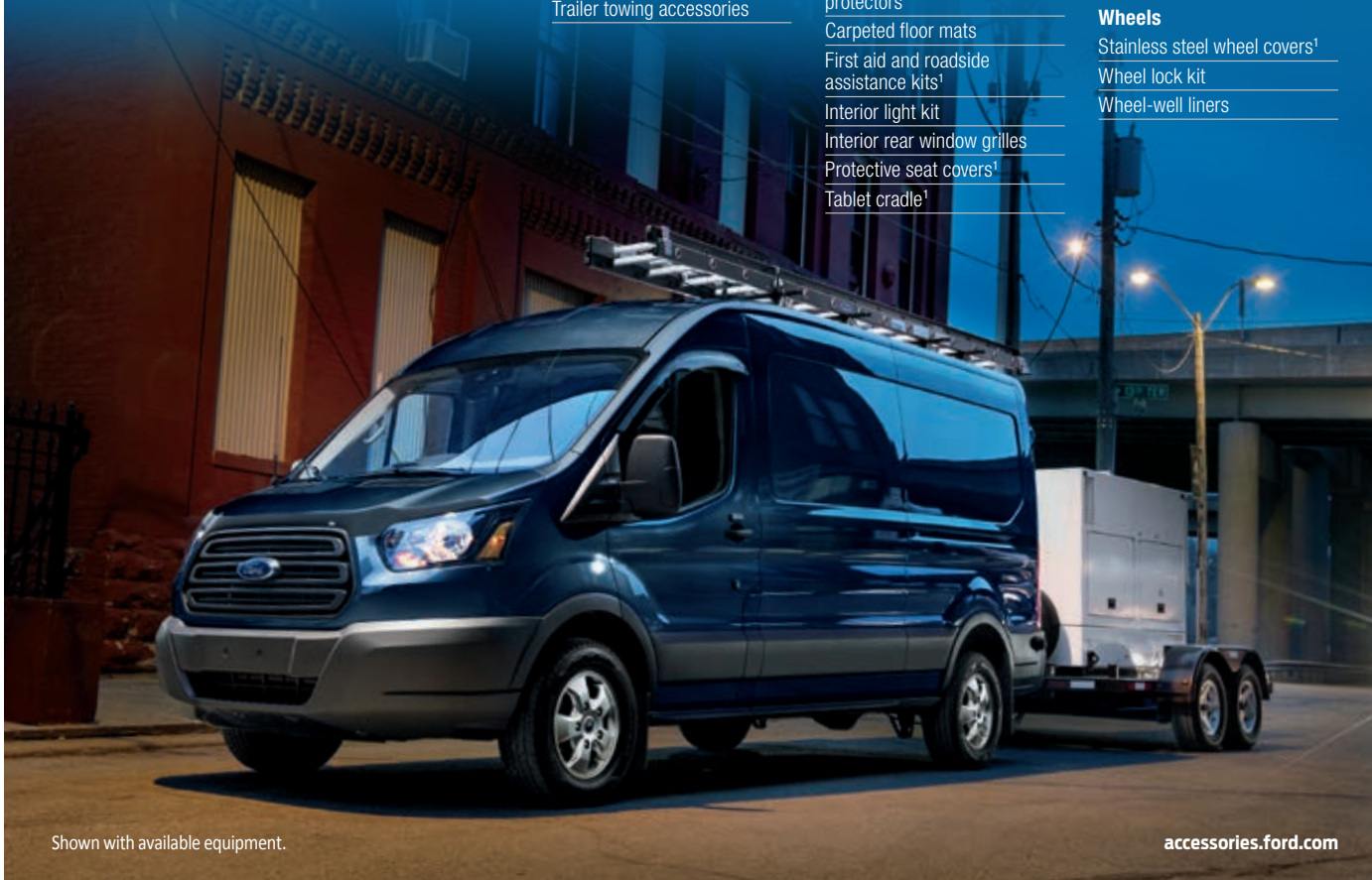
Shown with available equipment.