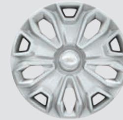
16" Black Steel with Silver-Styled Cover Standard: SRW XLT Passenger Wagon Optional: XL Passenger Wagon, SRW Van, and Cutaway & Chassis Cab