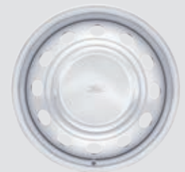
16" White Steel with White Front Hubcap (front wheel shown) Standard: DRW Cutaway & Chassis Cab Optional: DRW Passenger Wagon & Van (Fleet only)