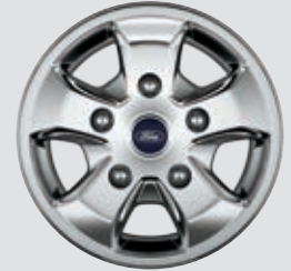
16" Easy-To-Clean Aluminum with Locking Lug Nuts Optional: All SRW (n/a with 9,500 lbs. GVWR or greater)