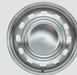
16" Silver Steel with Silver Front Hubcap (front wheel shown) Standard: DRW Passenger Wagon & Van