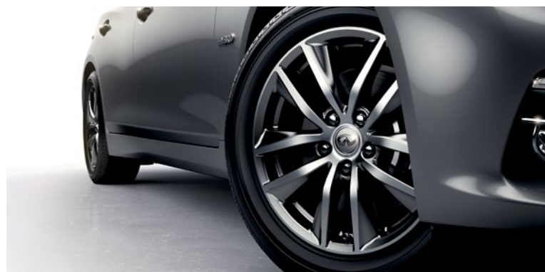
17 X 7.5-INCH, SPLIT 5-SPOKE ALUMINUM-ALLOY WHEELS WITH ALL-SEASON RUN-FLAT PERFORMANCE TIRES