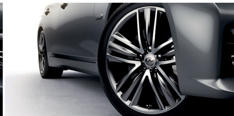
19 X 8.5-INCH, TRIPLE 5-SPOKE ALUMINUM-ALLOY WHEELS WITH ALL-SEASON OR SUMMER, RUN-FLAT PERFORMANCE TIRES

Infiniti has taken care to ensure that the color swatches presented here are the closest possible representations of actual vehicle colors. Swatches may vary slightly due to the printing process and whether viewed in daylight, fluorescent or incandescent light. Please see the actual colors at your local Infiniti retailer.