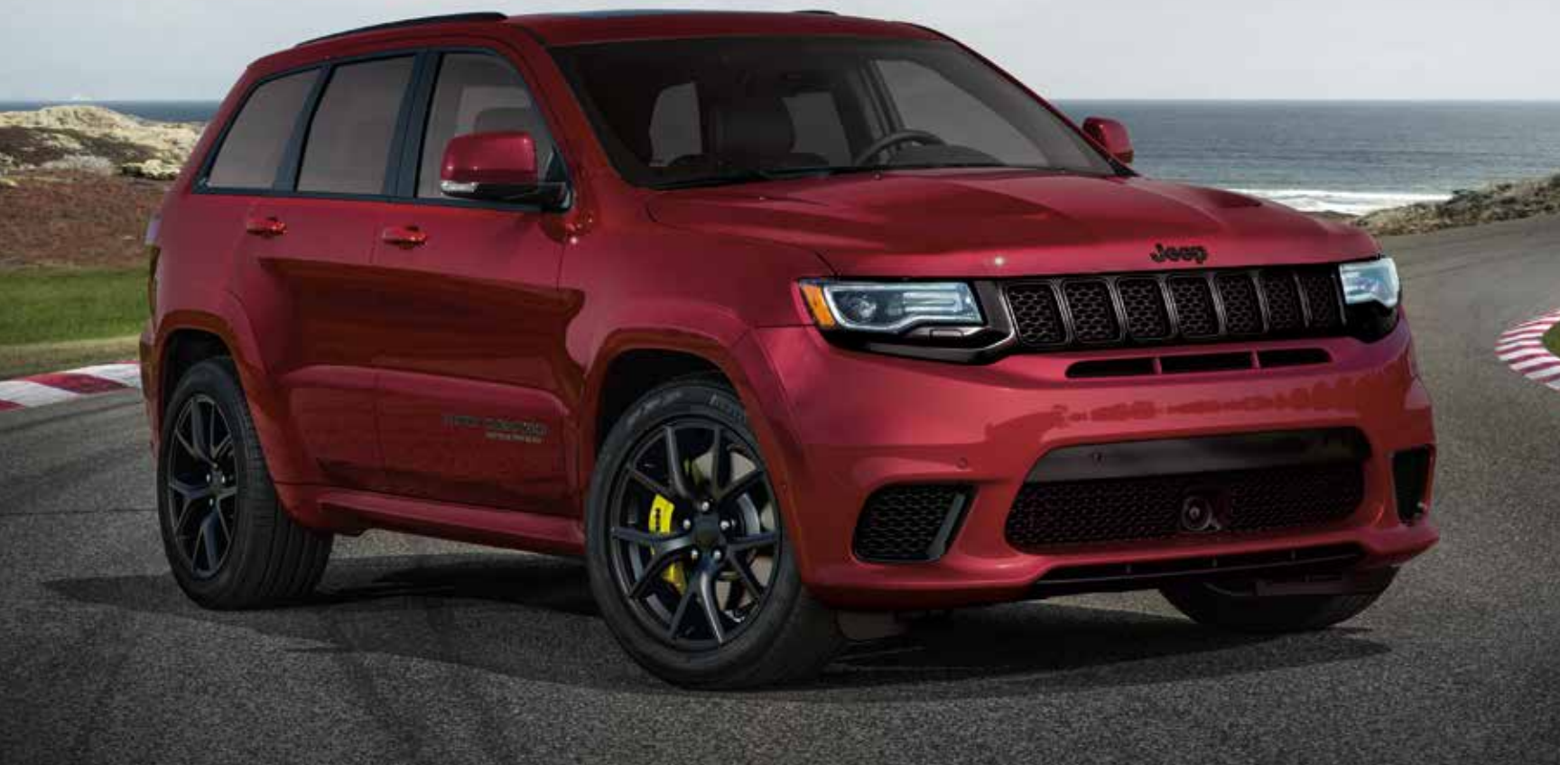
Trackhawk in Velvet Red Pearl

HARMAN KARDON ® PREMIUM SOUND SYSTEM Tuned to impress with precise speaker positioning throughout the cabin. Because everyone driving for speed needs to hear their 0 - 60 mph anthem played loud and proud, as intended by the artist. Available.