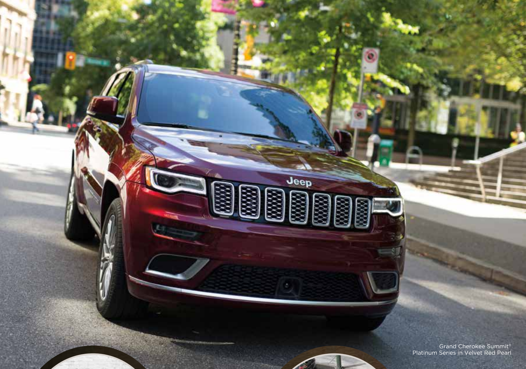
Grand Cherokee Summit ® Platinum Series in Velvet Red Pearl

3 ] PARKVIEW ® REAR BACK-UP CAMERA 7 WITH TRAILER VIEW Back out safely with grace. This system helps bring previously hidden rear objects to your attention, either on-screen or with an audible warning, in good time to react. You can also keep an eye on anything in tow while in motion. Standard.