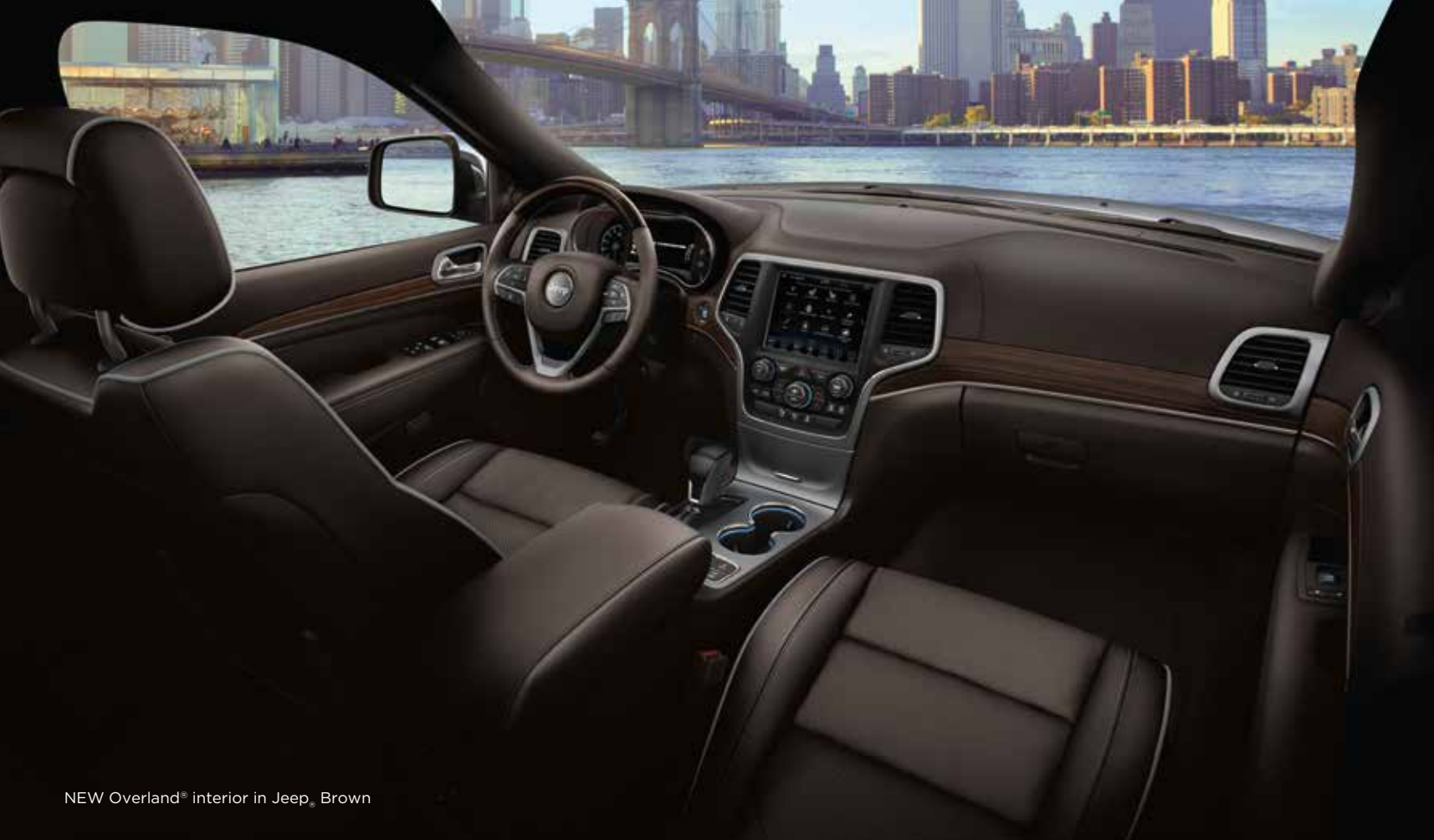
NEW Overland® interior in Jeep® Brown