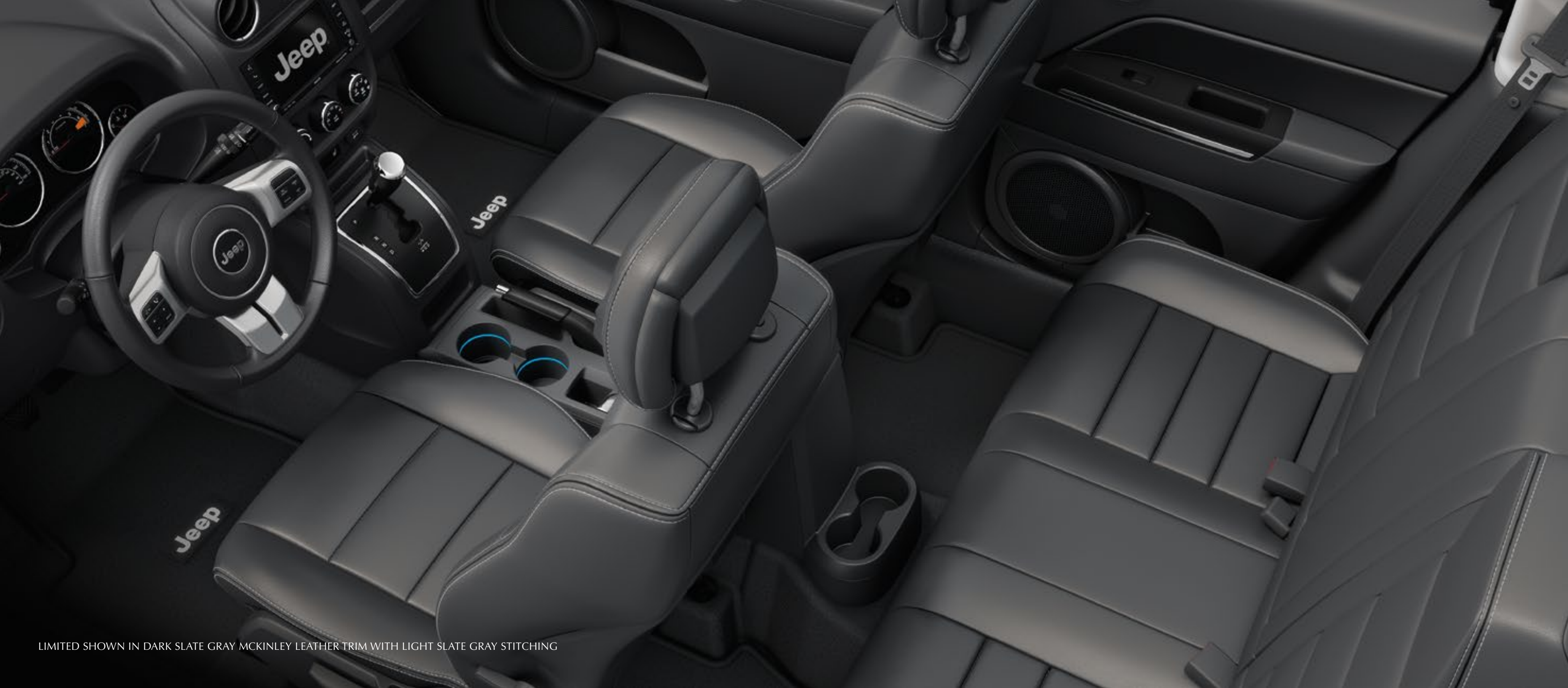
LIMITED SHOWN IN DARK SLATE GRAY MCKINLEY LEATHER TRIM WITH LIGHT SLATE GRAY STITCHING