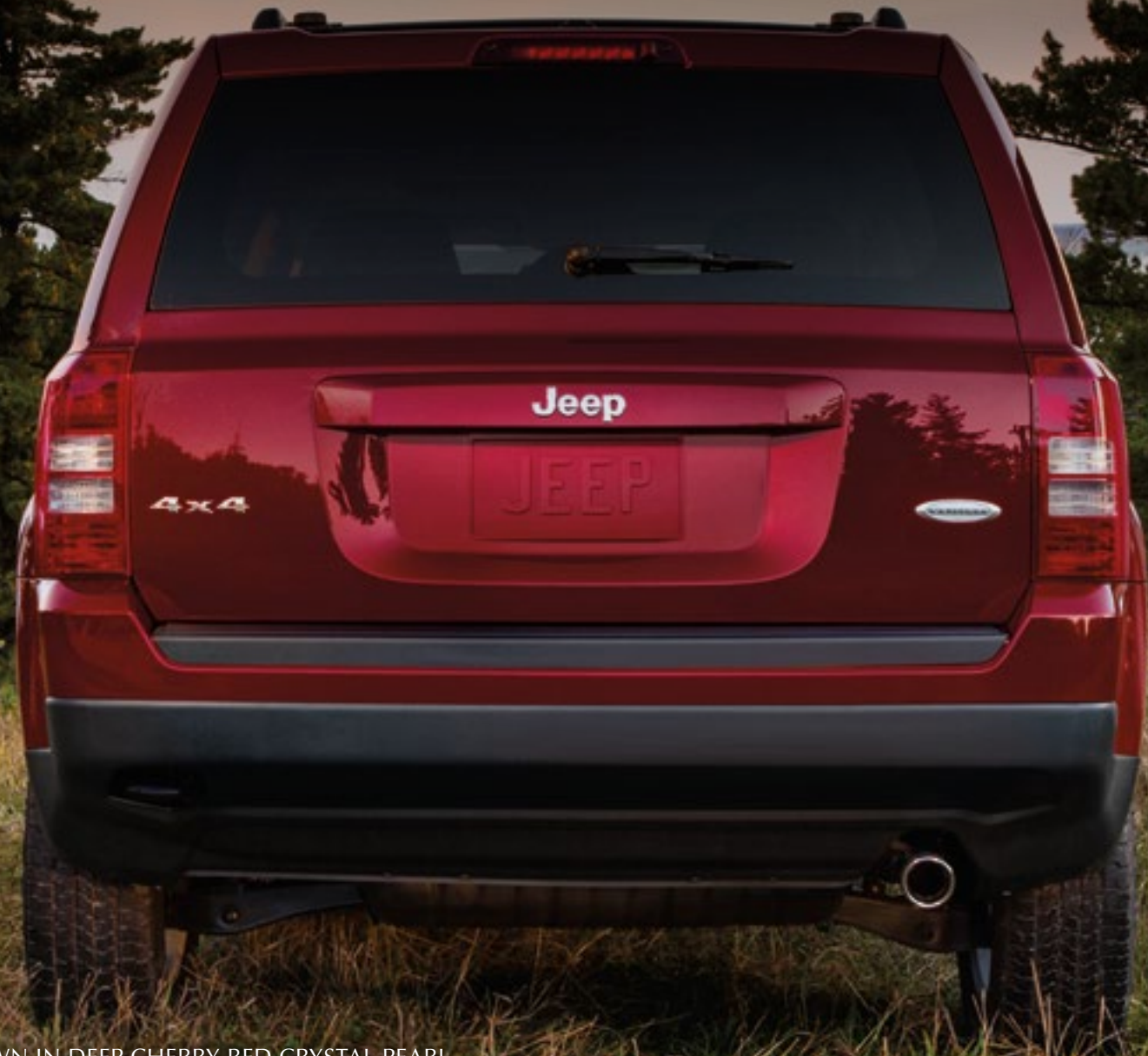
LATITUDE SHOWN IN DEEP CHERRY RED CRYSTAL PEARL

PATRIOT'S DEEP DESIGN ROOTS ARE EQUALLY INSPIRED BY BOTH NATURE'S FINE, SMALL DETAILS AND BY THE BOLD, EXPANSIVE FORMATIONS THAT CREATE THE TOPOGRAPHY. FROM THE INTRICACIES OF THE SMALLEST PLANTS TO THE COMPLEXITIES OF EFFICIENT ECOSYSTEMS, PATRIOT LENDS AN EAR TO HEAR WHAT THE EARTH IS SAYING. THIS MAY BE ONE REASON PATRIOT FEELS SO AT HOME CLIMBING MOUNTAINS, ROAMING FORESTS, AND WADING THROUGH STREAMS.