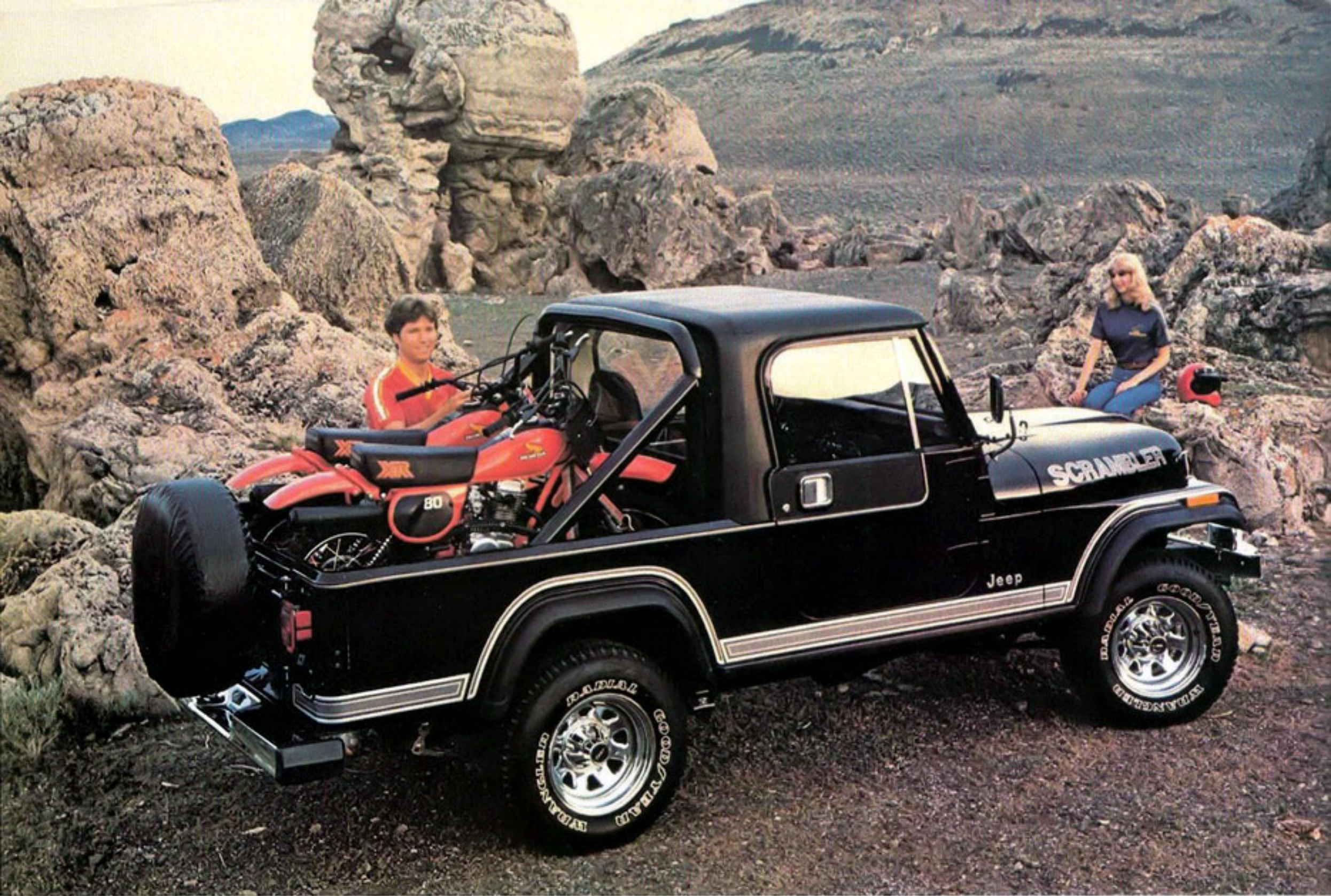
Scrambler SL Sport (above)