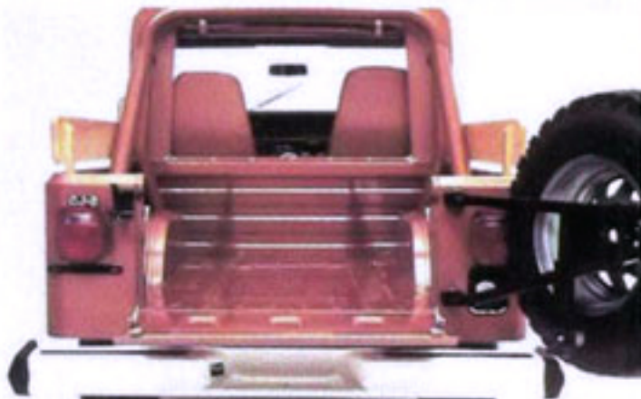
Rear Swing Away Spare Tire