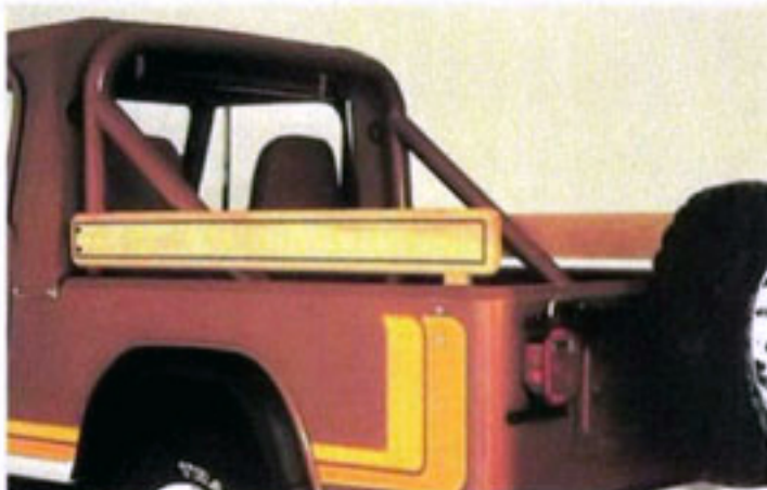
Wood Side Rails