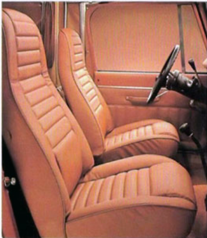
SR Sport Highback Bucket Interior