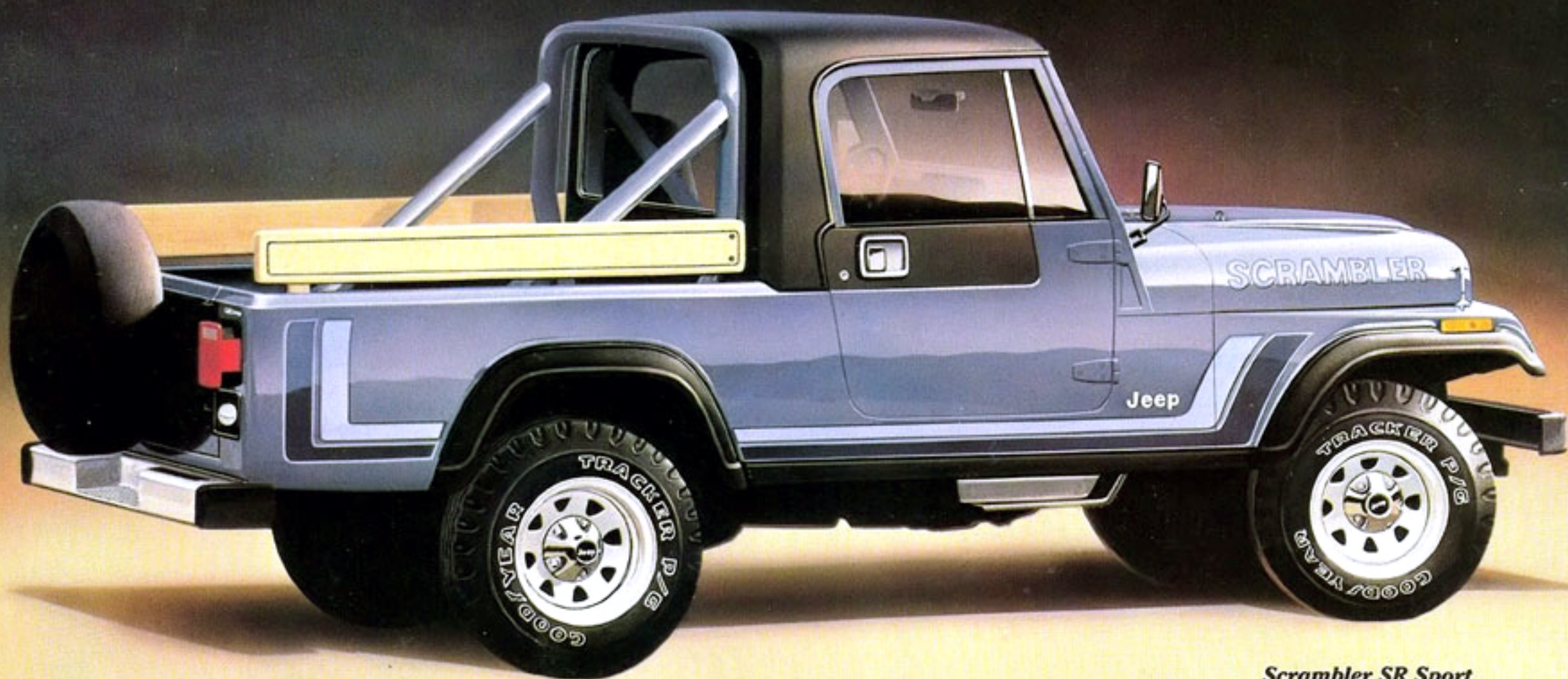
Scrambler SR Sport