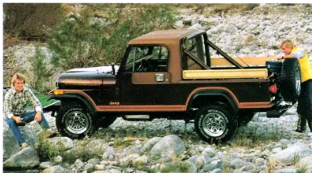
Scrambler SL Sport