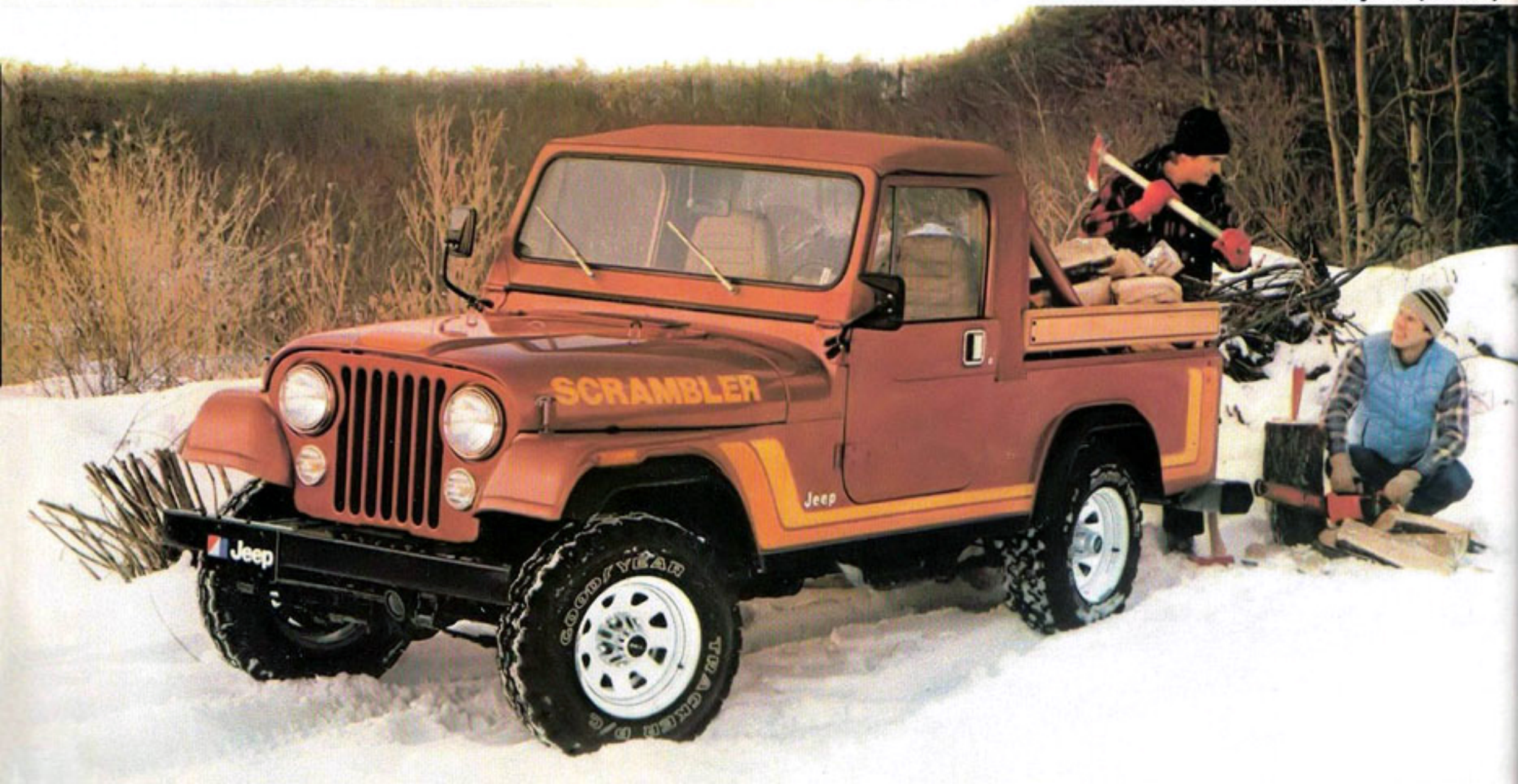
Scrambler SR Sport (below)