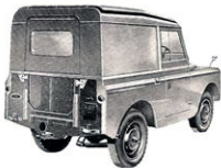
Regular hard-top (optional extra).