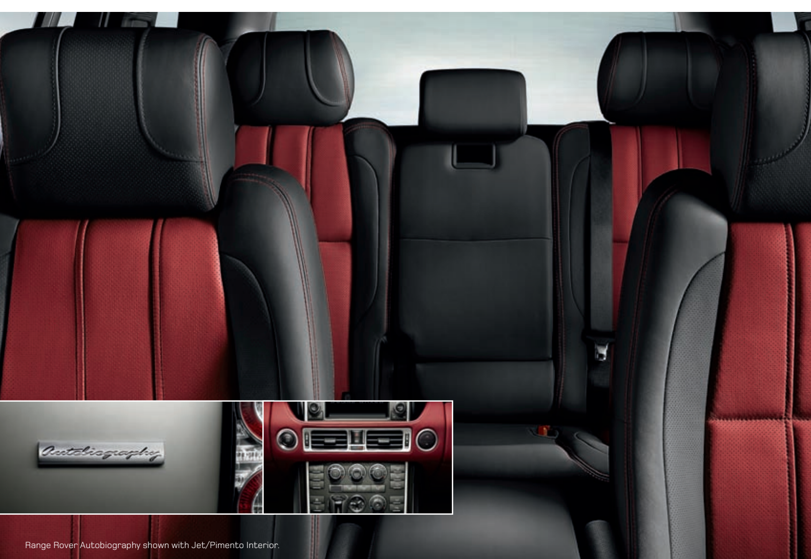
Range Rover Autobiography shown with Jet/Pimento Interior.