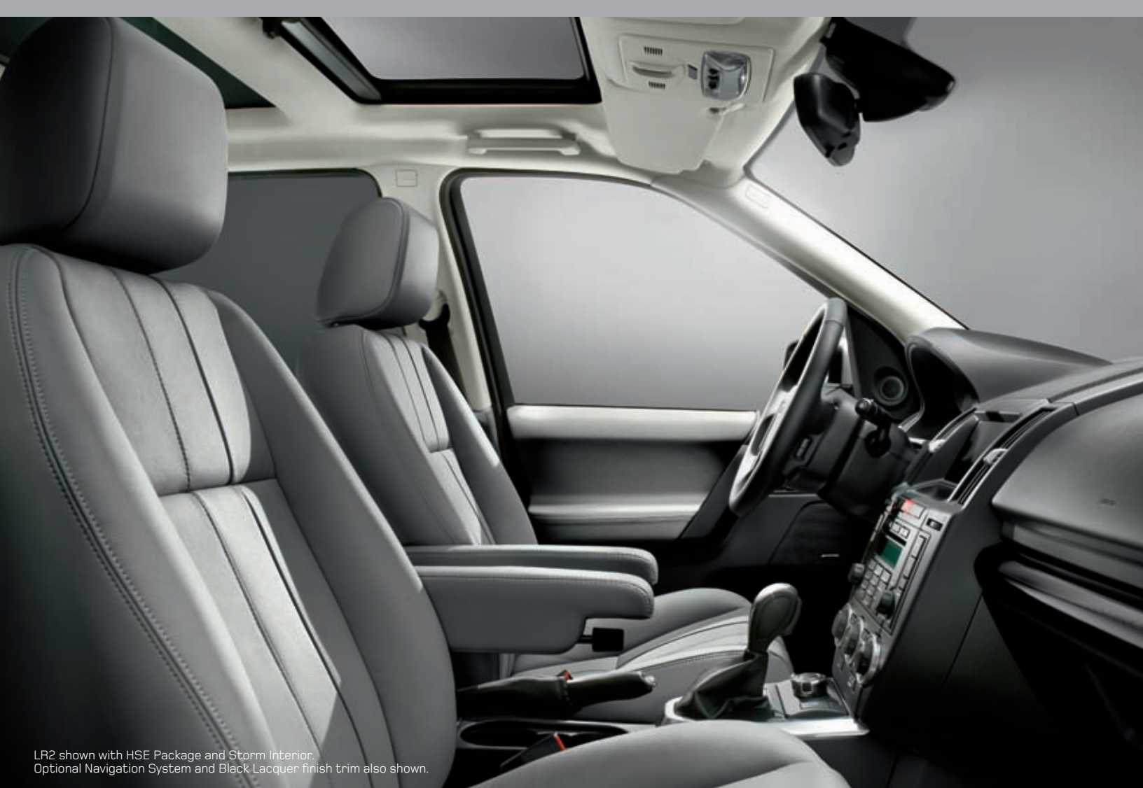
LR2 shown with HSE Package and Storm Interior. Optional Navigation System and Black Lacquer finish trim also shown.