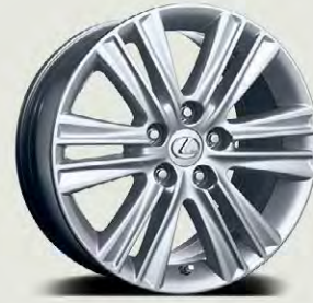
17-in split-six-spoke alloy wheels 10 STANDARD ES