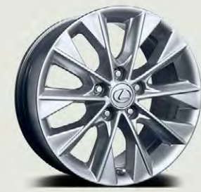
17-in split-five-spoke alloy wheels 10 STANDARD ESh