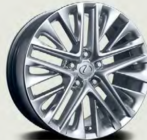
18-in split-10-spoke alloy wheels 12 with High Gloss finish OPTIONAL ES