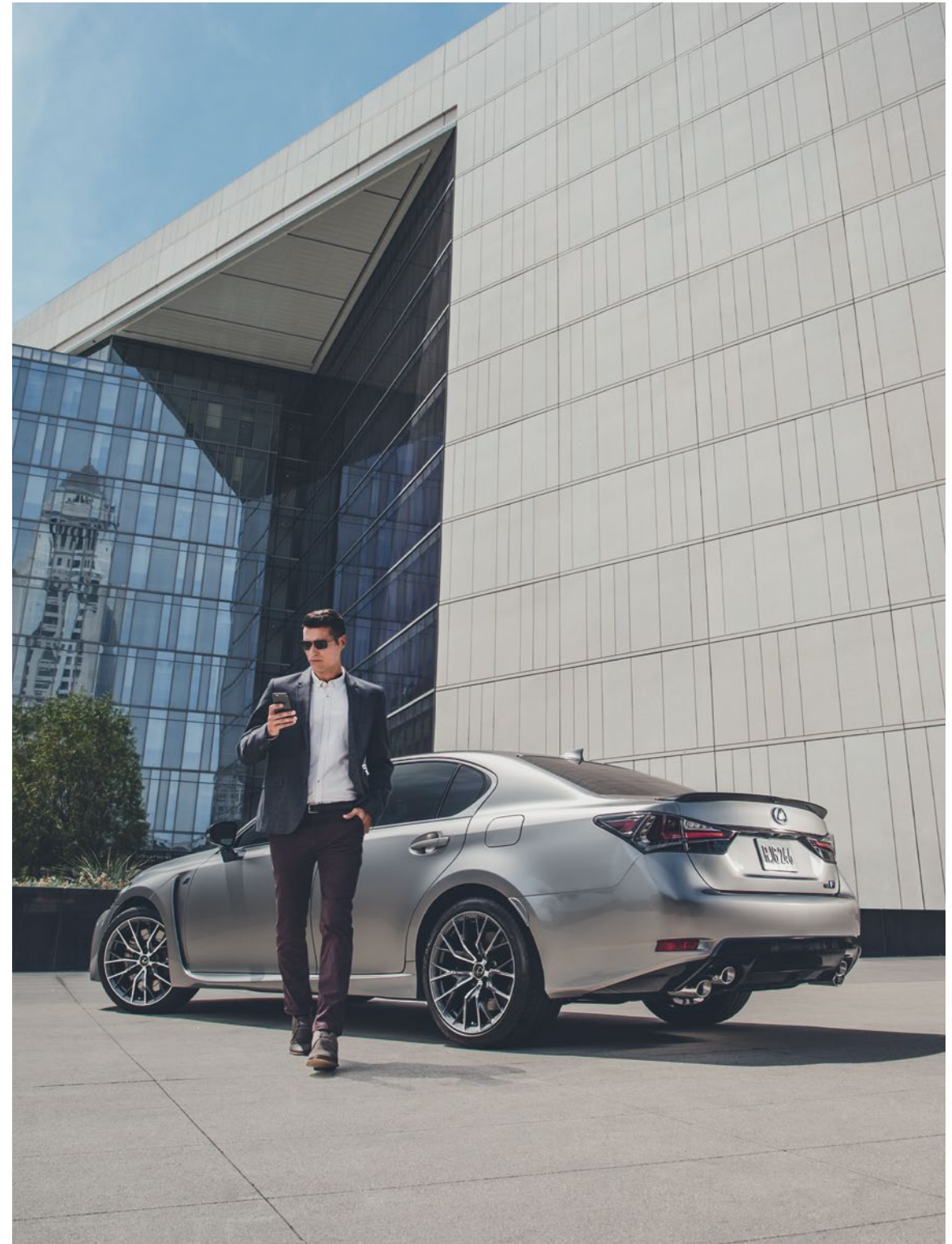
GSF shown in Atomic Silver // Options shown