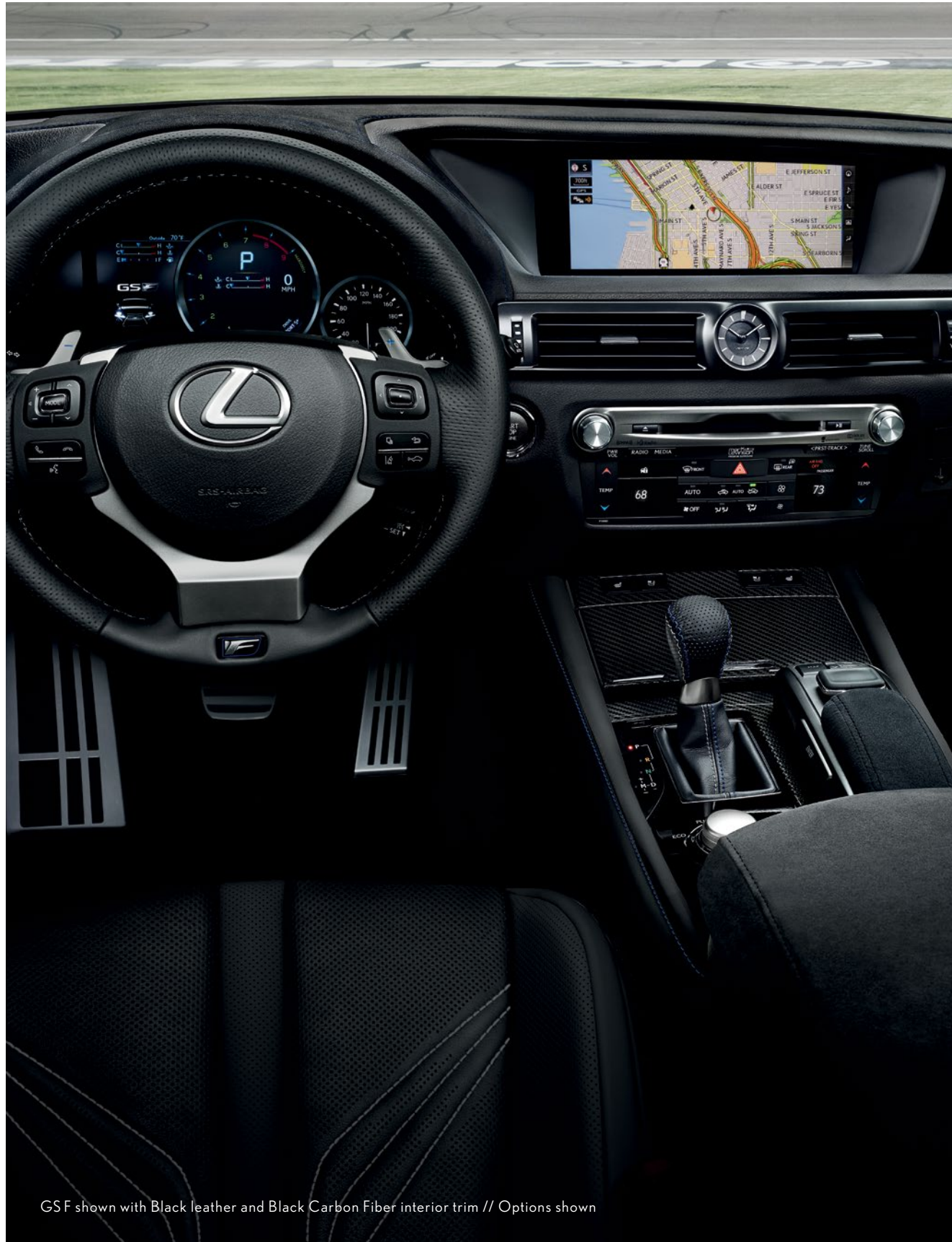
GS-F shown with Black leather and Black Carbon Fiber interior trim // Options shown