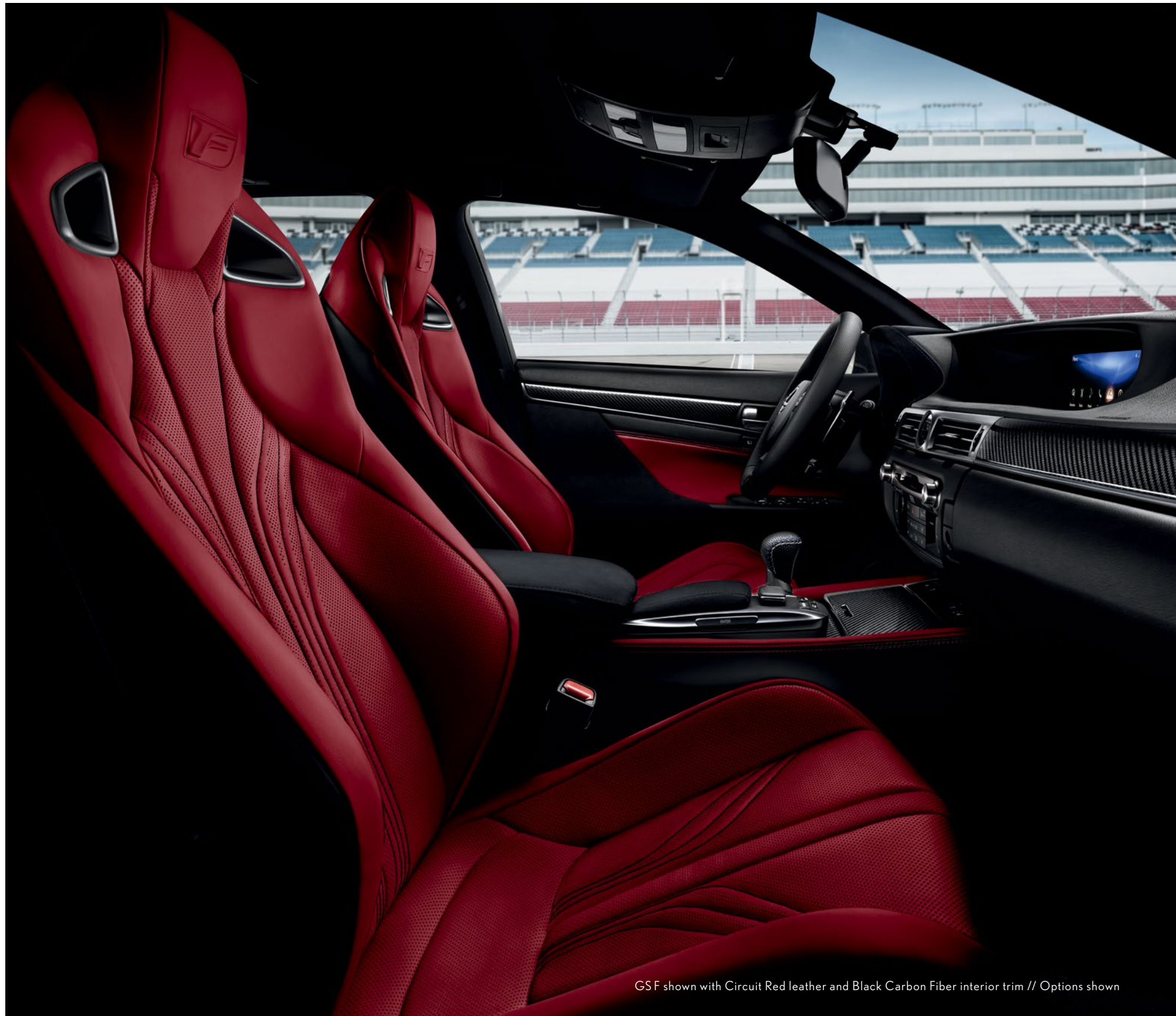
GS F shown with Circuit Red leather and Black Carbon Fiber interior trim // Options shown