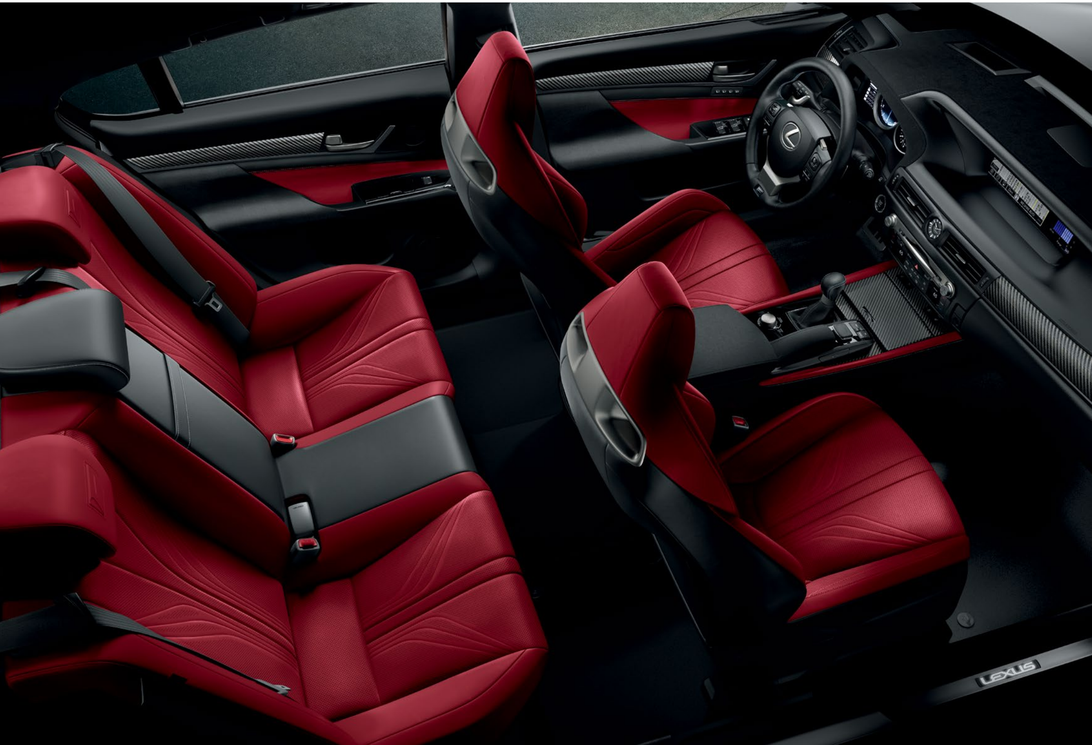
GSF shown with Circuit Red leather and Black Carbon Fiber interior trim // Options shown