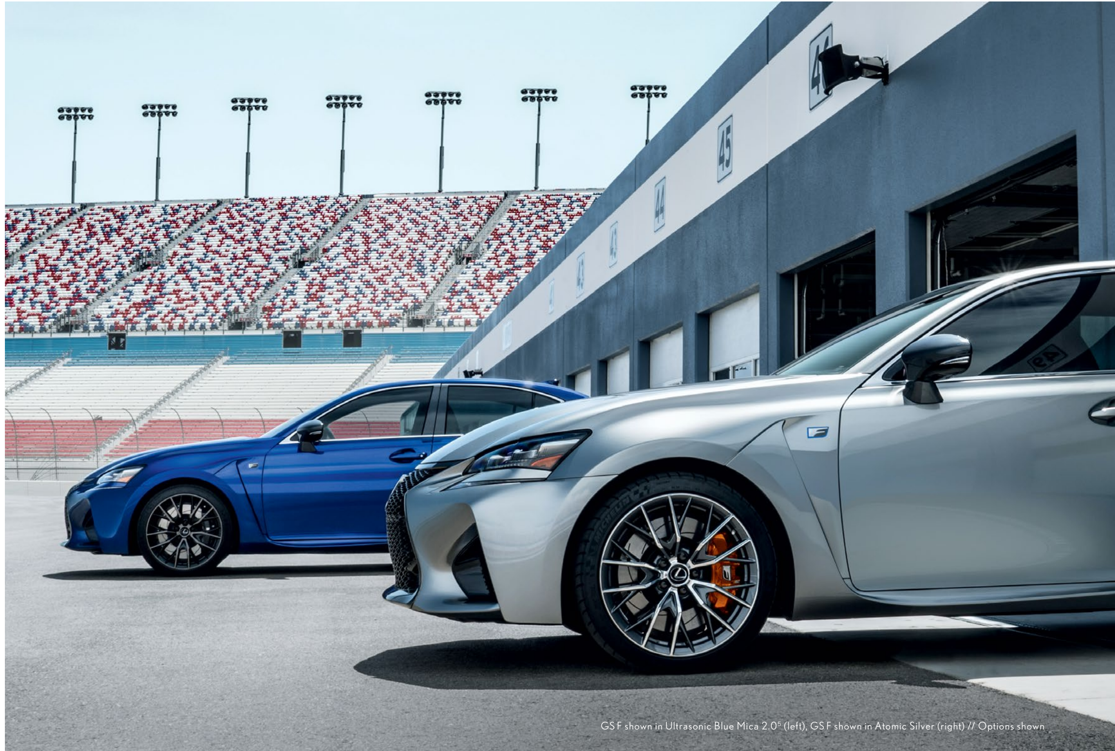
GS-F shown in Ultrasonic Blue Mica 2.0 ® (left), GS-F shown in Atomic Silver (right) // Options shown

Hand-polished split-10-spoke forged alloy wheels 4 by BBS AVAILABLE