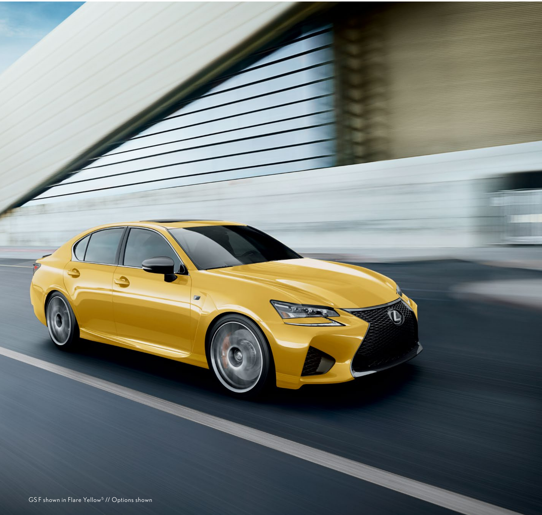
GSF shown in Flare Yellow 5 // Options shown