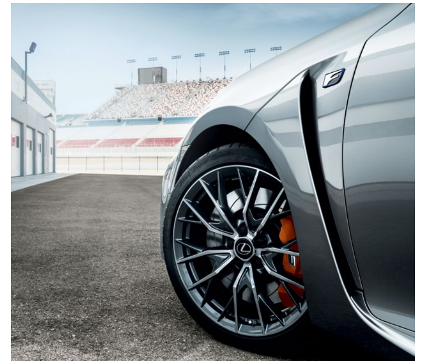
GS-F shown in Ultrasonic Blue Mica 2.0 5 // Options shown

The GS-F wasn't just built, but honed. Then honed again. Earning its F badge through exhaustive testing, tuning and engineering on iconic tracks like Fuji Speedway. Infused with knowledge gained from the RC FGT3 6 racing program and equipped with exclusive performance features, the GS-F is the most powerful sedan Lexus has ever made.