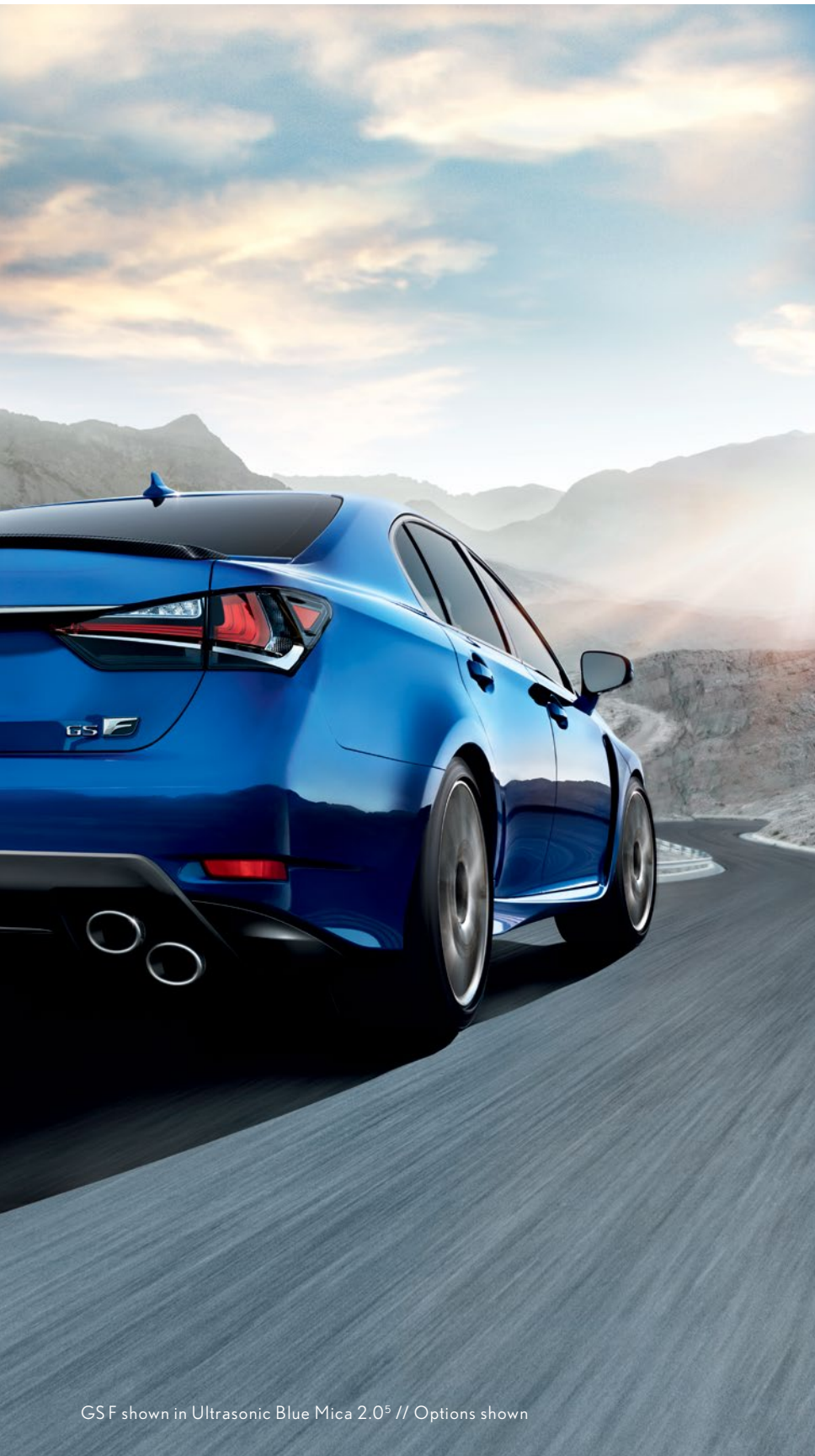
GS F shown in Ultrasonic Blue Mica 2.0 5 // Options shown