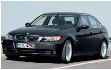
2006 BMW 330i/325i