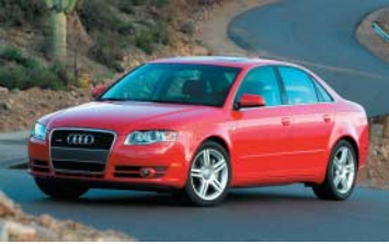
2005 Audi A4 3.2/2.0 T