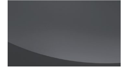
NEBULA GRAY PEARL