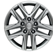
20-in split-five-spoke alloy wheels 34 STANDARD