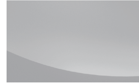
SILVER LINING METALLIC