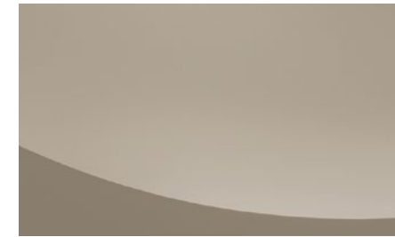
SATIN CASHMERE METALLIC