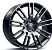
FSPORT 19-in split-nine-spoke alloy wheels 3,11 Available Winter 2014