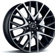
19-in split-10-spoke alloy wheels 3 RC FSPORT