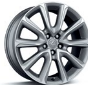
19-in split-five-spoke alloy wheels 3 Available