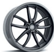
FSPORT 19-in forged alloy wheels 3,11 Available