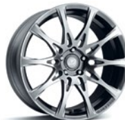
FSPORT 19-in full-face forged alloy wheels 3,11 Available AWD only