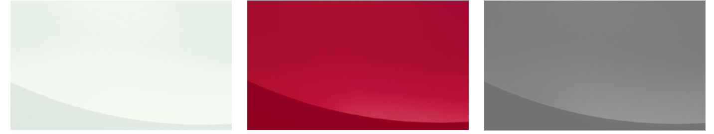
STARFIRE PEARL INFRARED† ATOMIC SILVER