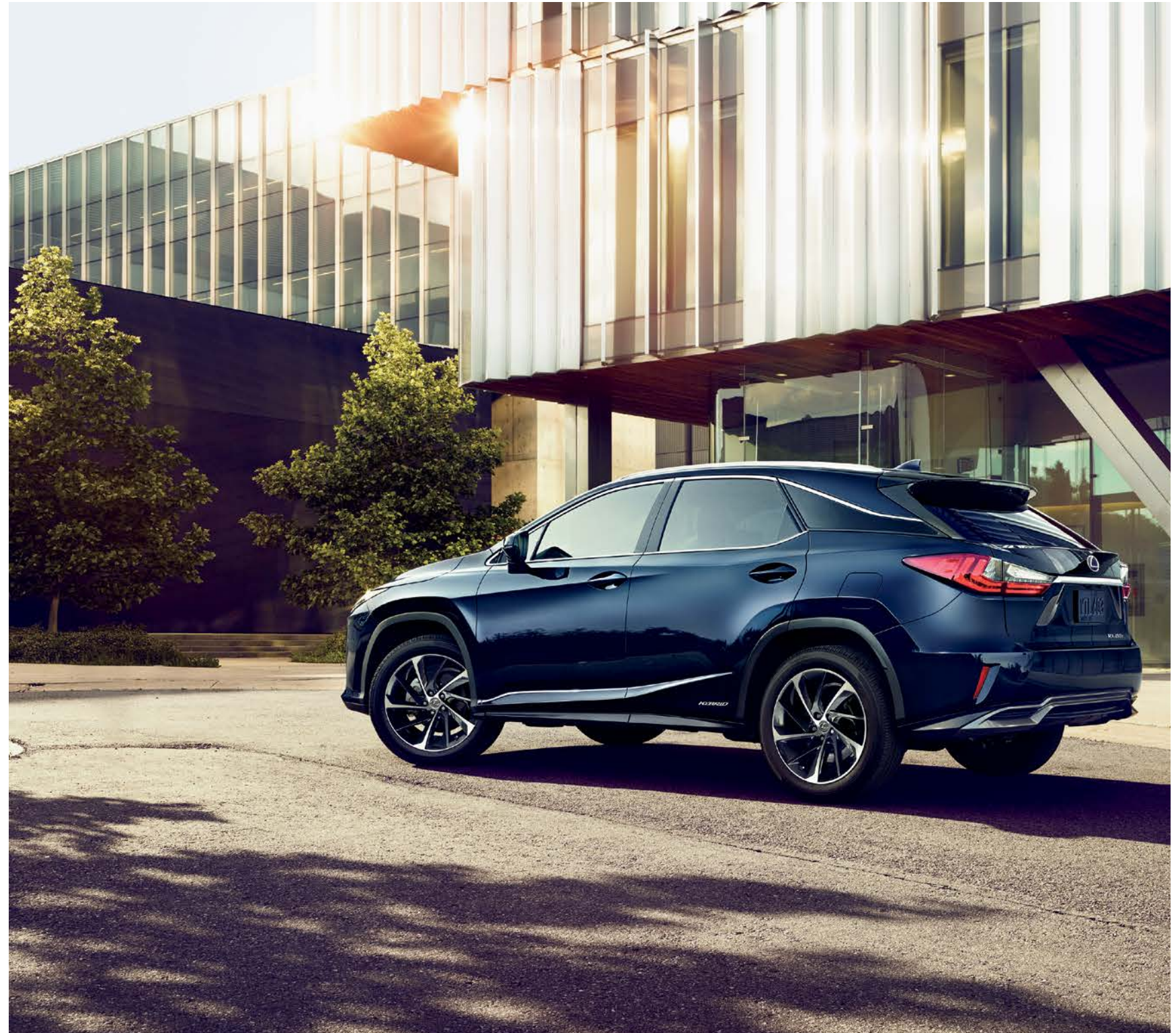
RXh shown in Nightfall Mica // Options shown

Split-five-spoke alloy wheels 3 with Superchrome and machined finish and interchangeable colored inserts STANDARD LUXURY PACKAGE