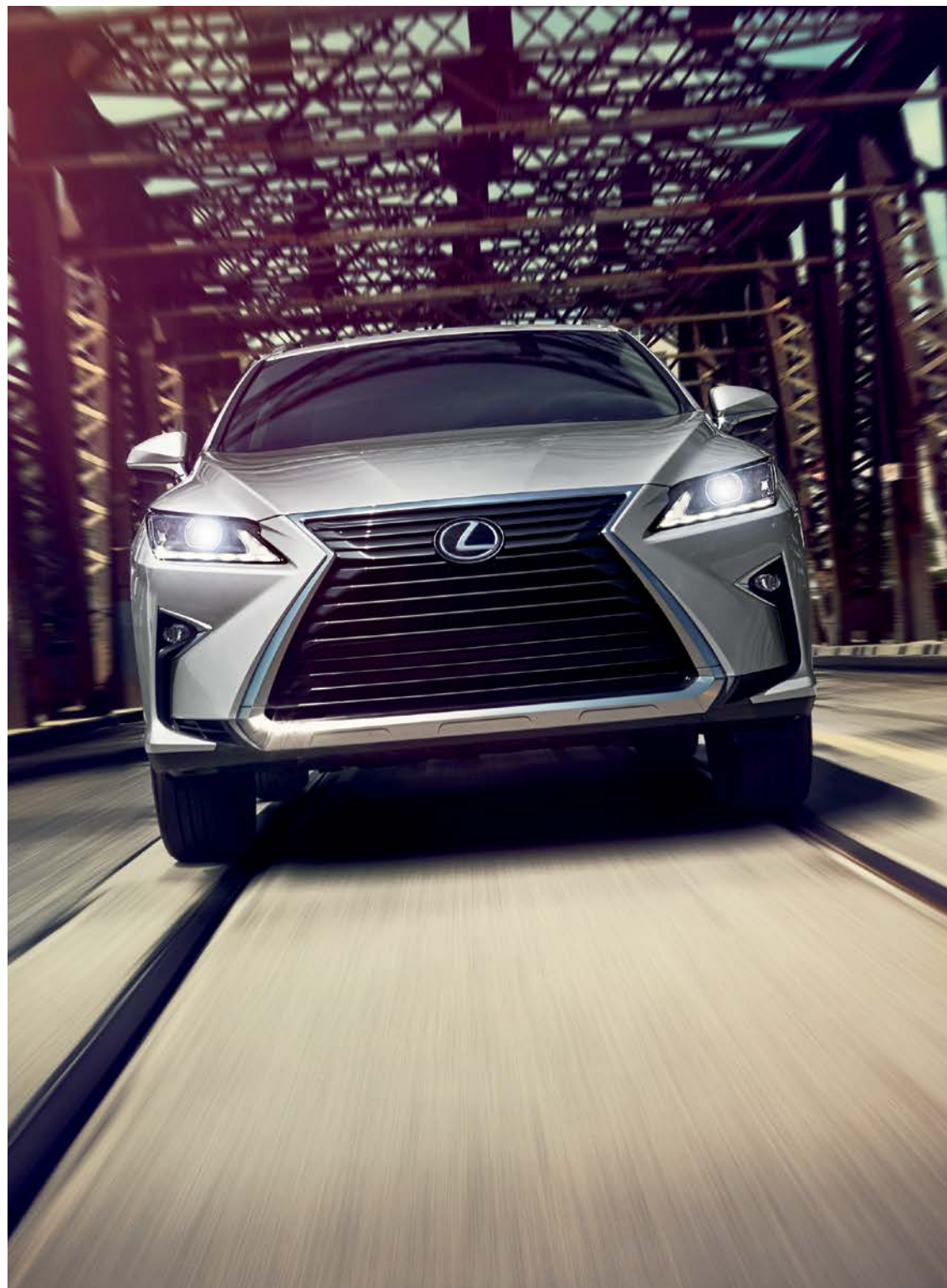
RX shown in Silver Lining Metallic // Options shown