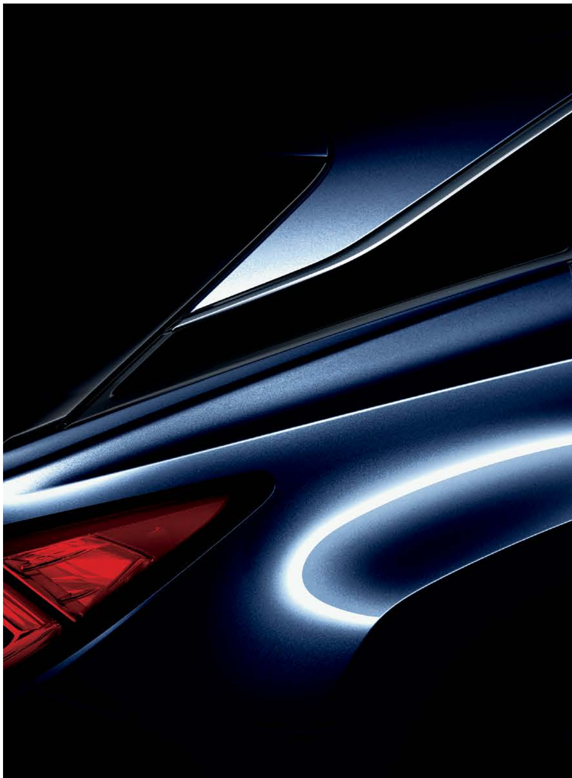
RX shown in Nightfall Mica