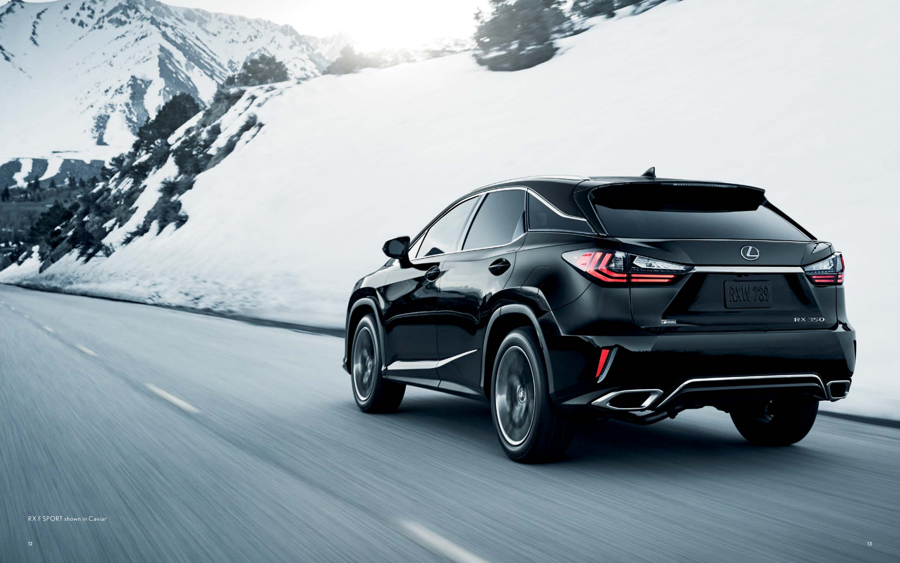
RX F SPORT shown in Caviar