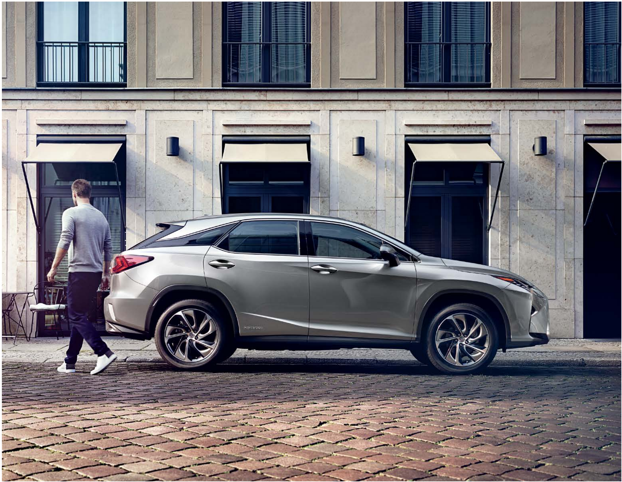
RXh shown in Atomic Silver // Options shown