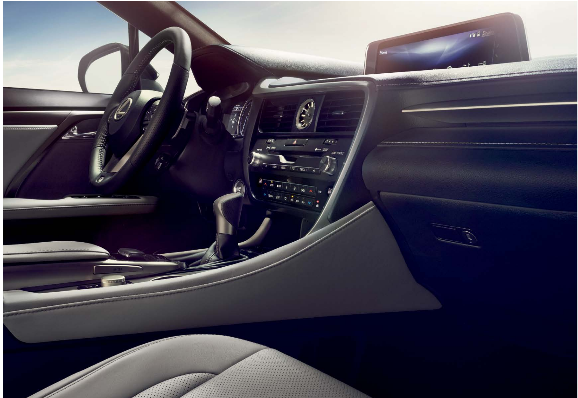
RX FSPORT shown with Stratus Gray leather and Scored Aluminum interior trim // Options shown

Customize the climate around you. Individual settings allow the driver and front passenger to adjust their preferred temperatures. Plus, the RX 350L and RX 450hL feature dedicated climate control for passengers in the third row. To help ensure the cabin stays fresh, an available smog-sensing climate-control system automatically switches into recirculation mode if it senses high levels of pollutants outside.