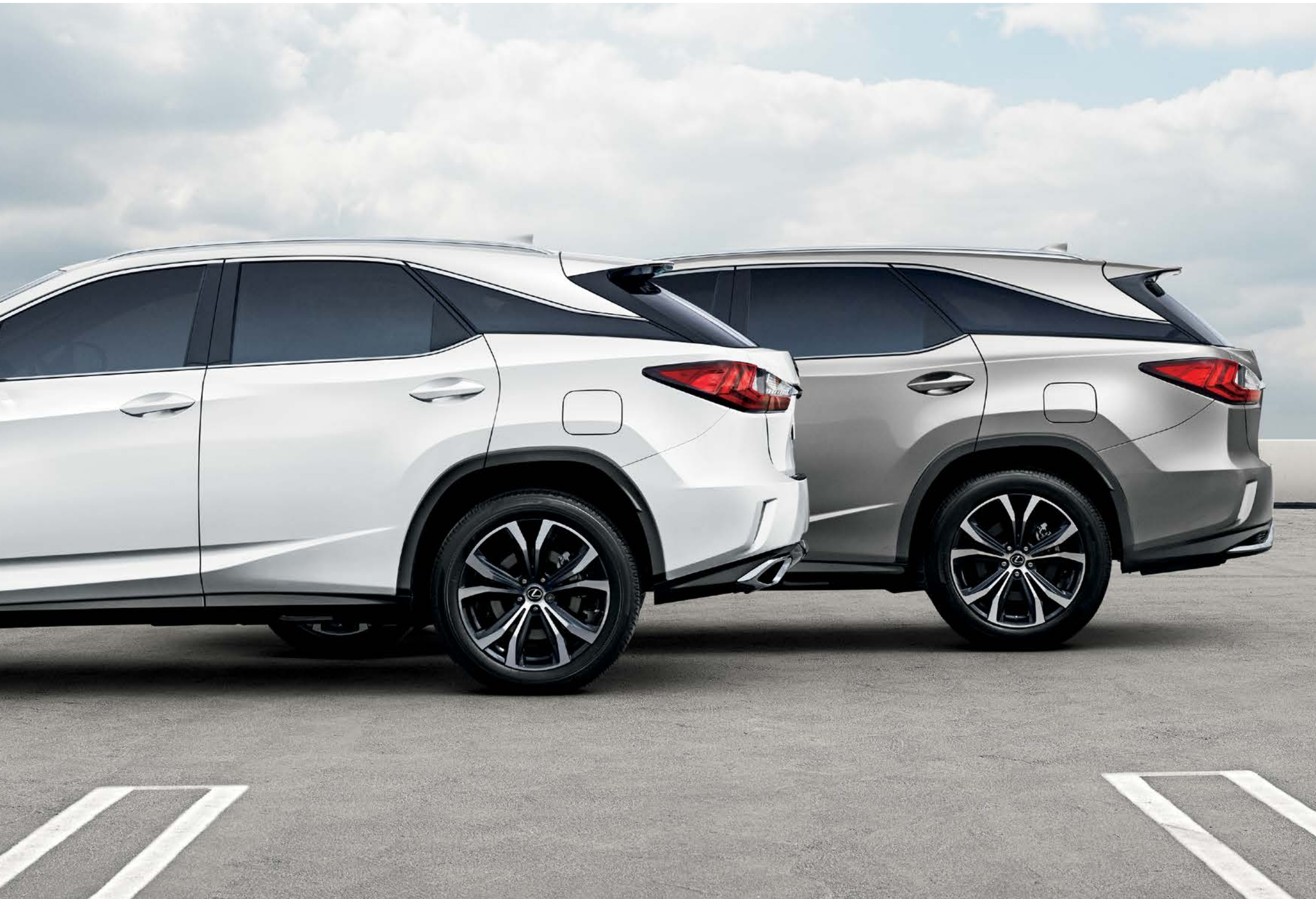
RX shown in Eminent White Pearl (left), RXL shown in Atomic Silver (right) // Options shown