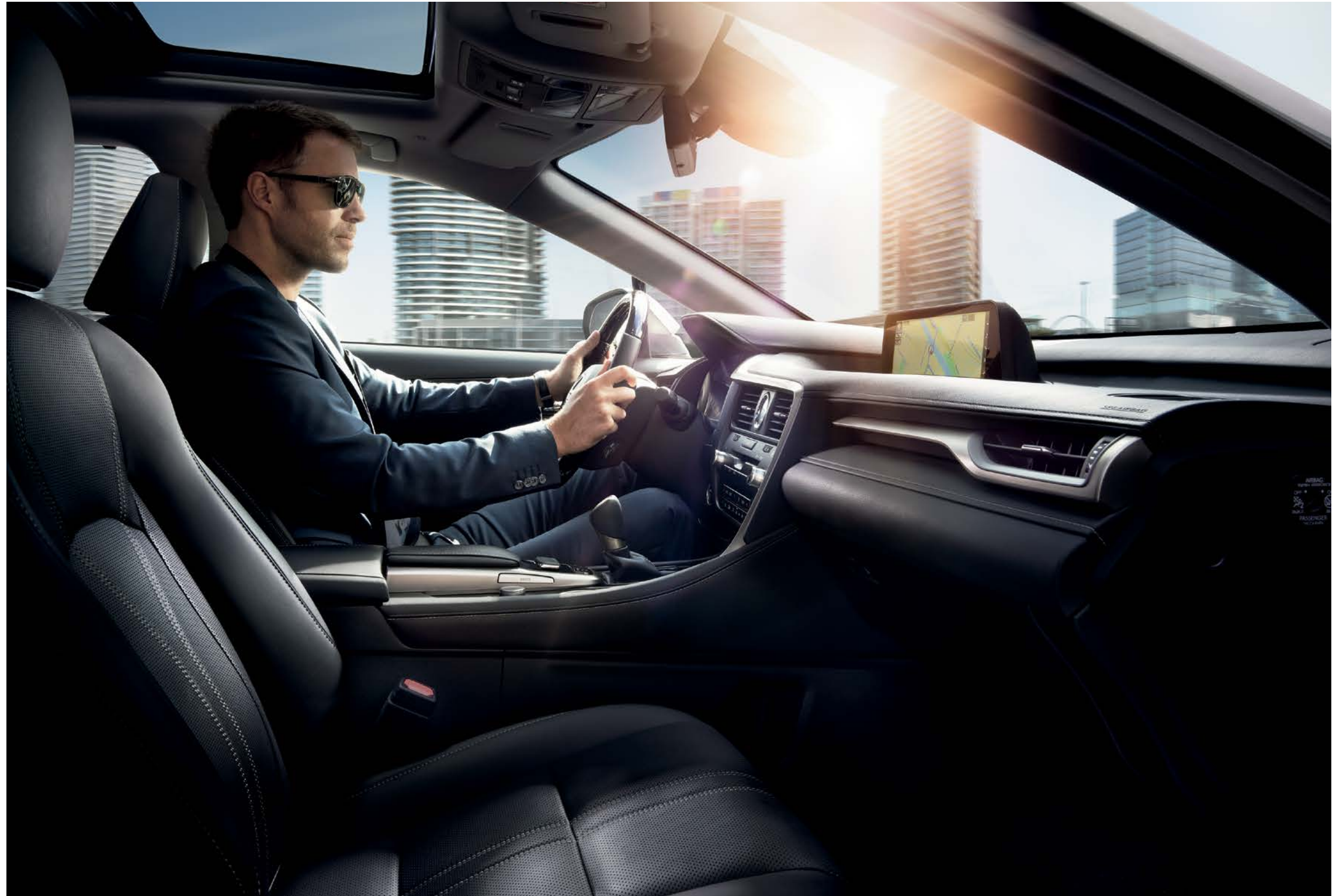
RX shown with Black leather and Gray Sapele wood with Aluminum interior trim // Options shown