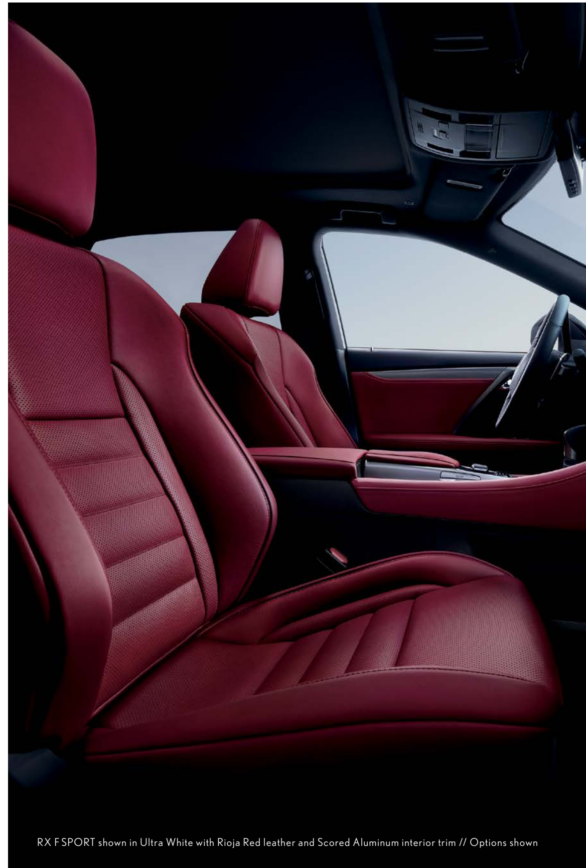
RX F SPORT shown in Ultra White with Rioja Red leather and Scored Aluminum interior trim // Options shown