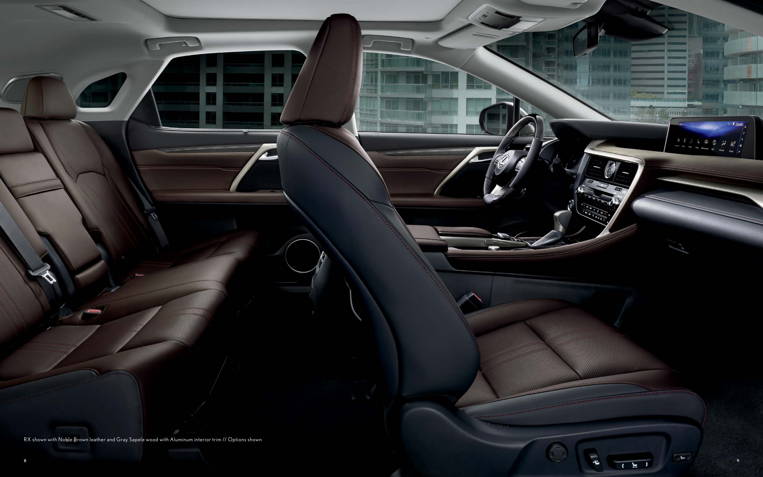
RX shown with Noble Brown leather and Gray Sapele wood with Aluminum interior trim // Options shown