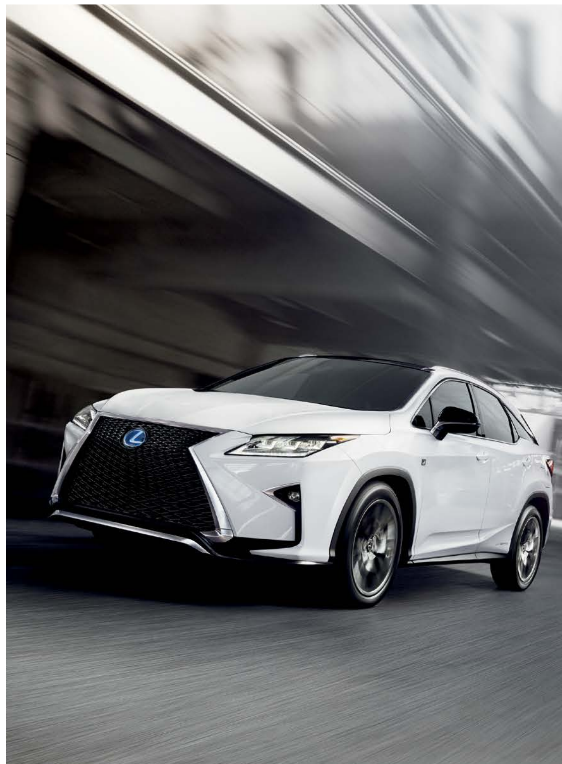
RXh F SPORT shown in Ultra White // Options shown