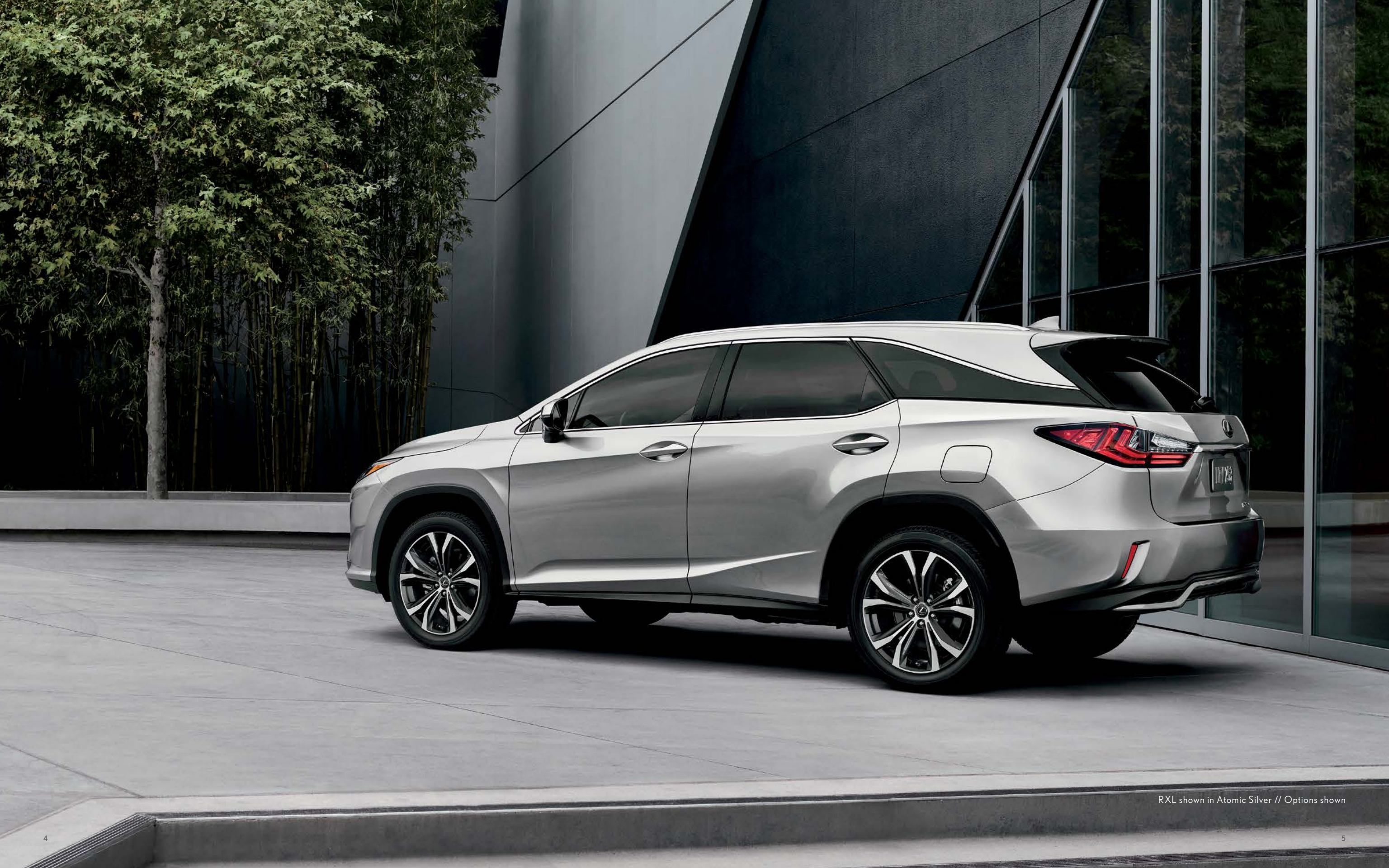
RXL shown in Atomic Silver // Options shown