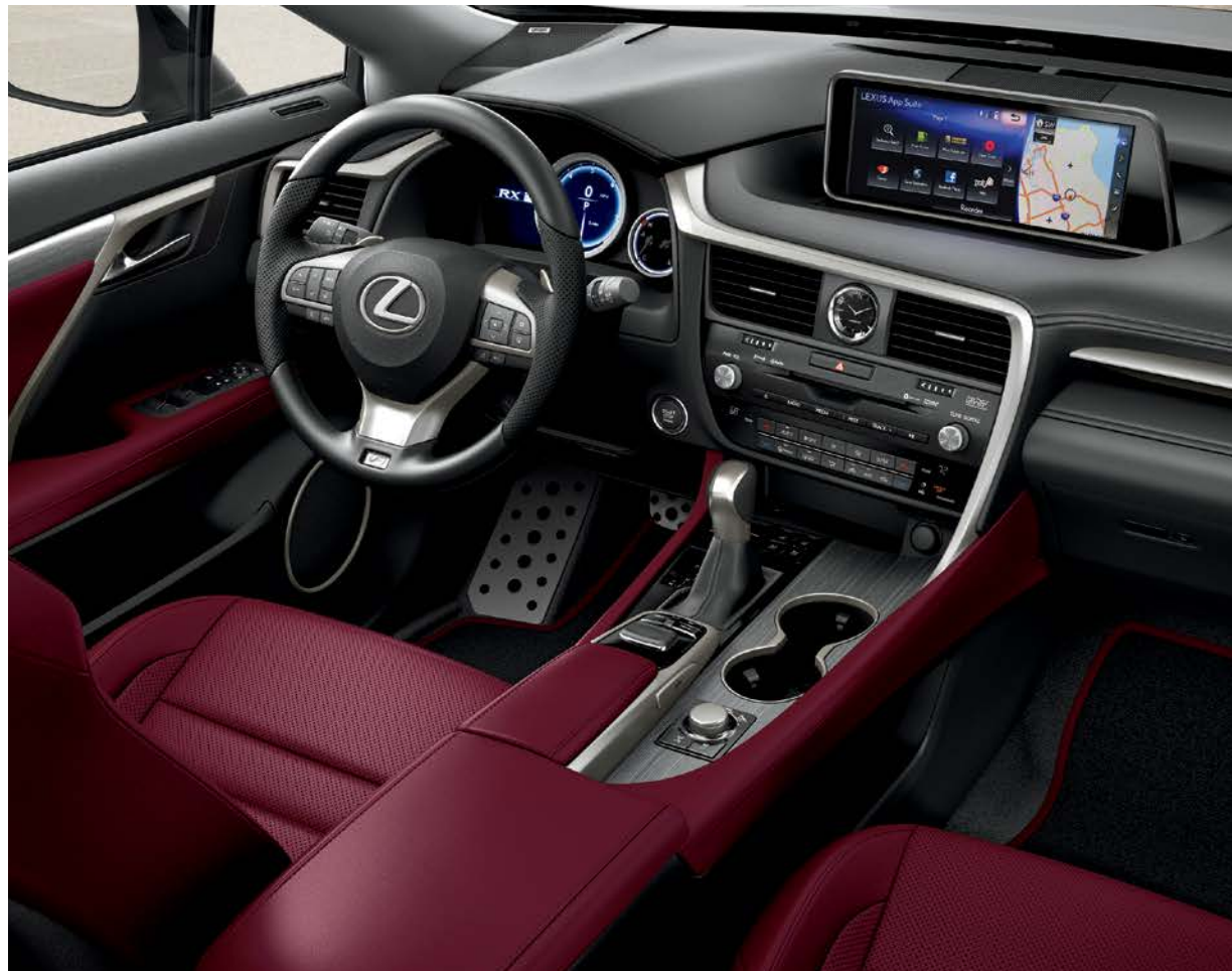
RX F SPORT shown with Rioja Red leather and Scored Aluminum interior trim // Options shown

The bold F SPORT perspective is obvious throughout the driver-centric interior. In addition to exclusive race-inspired instrumentation and bold aluminum accents, you'll find performance upgrades, including bolstered sport seats, a black headliner, a perforated leather-trimmed sport steering wheel and shift knob, plus aluminum pedals and more.