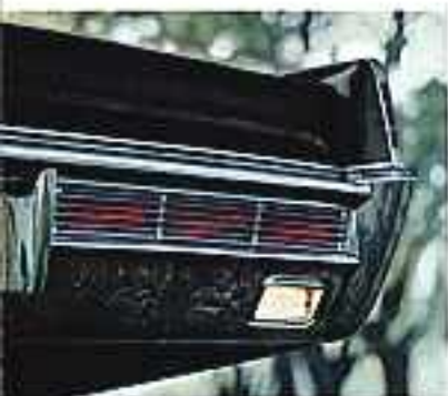
All rear lights are redesigned this year for even greater visibility. The red lens mounted in the rear bumper sweeps to a full width of almost two feet.