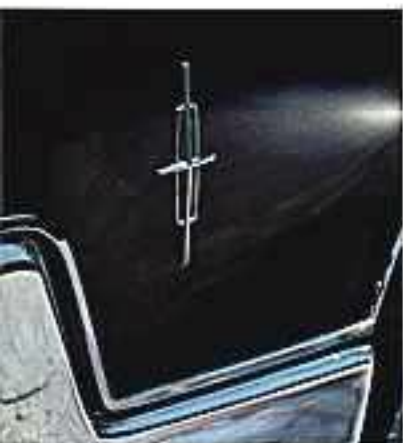
Sleek lines of the front fenders carry the Continental emblem.