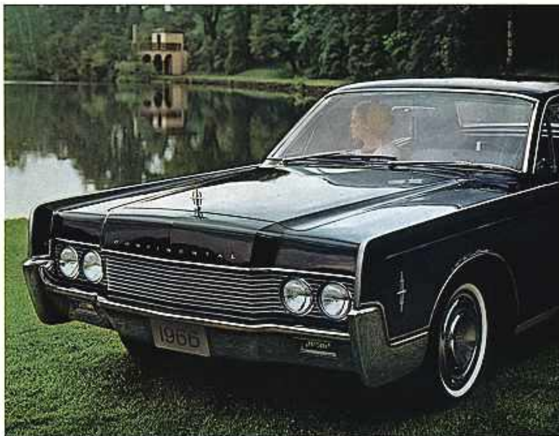
This new front-end design gives a bold forward thrust to the look of the 1966 Lincoln Continental. Integral elements of this look are the new hood styling and the new horizontal bar grille. Note, too, the new parking and turn signal lights mounted in the bumper.