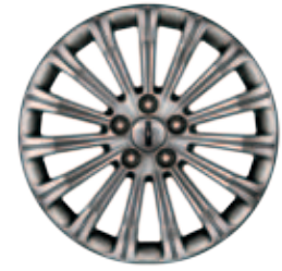
18" Premium Painted Aluminum Standard

Voice-activated Navigation System with SD card for map and POI storage; integrated SiriusXM Traffic and Travel Link with 6-month trial subscription (includes THX II Certified Audio System and HD Radio Technology) 9