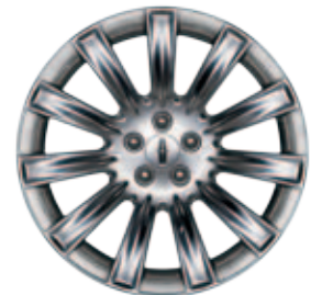
20" Polished Aluminum Available; Included with Limited Edition Package