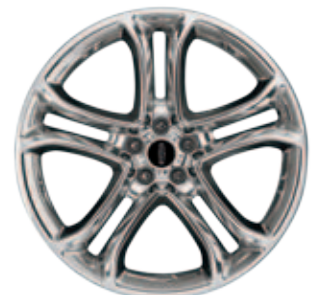
22" Polished Aluminum Available