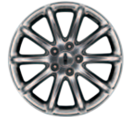
18" Polished Aluminum Included with Premium Package