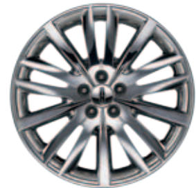
20" Chrome-Clad Aluminum Available