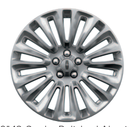
19" 18-Spoke Polished Aluminum Optional on Select or Reserve