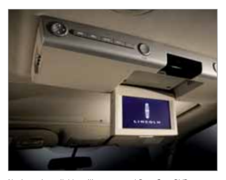
Navigator's available ceiling-mounted Rear-Seat DVD Entertainment System makes long trips seem much shorter for those in the 2nd and 3rd rows.