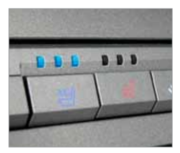
Standard heated and cooled front seats have three levels of warming or cooling power.