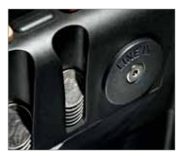
A standard audio input jack allows plug-andplay capability with your digital media player.

*Service not available in Alaska or Hawaii. ©2007 SIRIUS Satellite Radio Inc. "SIRIUS," the SIRIUS dog logo and "The Best Radio on Radio" are registered trademarks of SIRIUS Satellite Radio Inc. THX and the THX logo are trademarks of THX Ltd., which may be registered in some jurisdictions. All rights reserved.