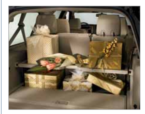
A Cargo Management System on Navigator L features a panel divider that lets you create shelf-like storage or two distinct storage areas

*Always wear your safety belt and secure children in the rear seat. **Excludes steel spare.