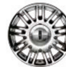
17" 18-Spoke Chromed-Aluminum Optional on Signature Limited and Signature L, standard with the Continental Edition Package