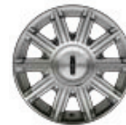
17" 10-Spoke Machined-Aluminum Standard on Signature and Signature L