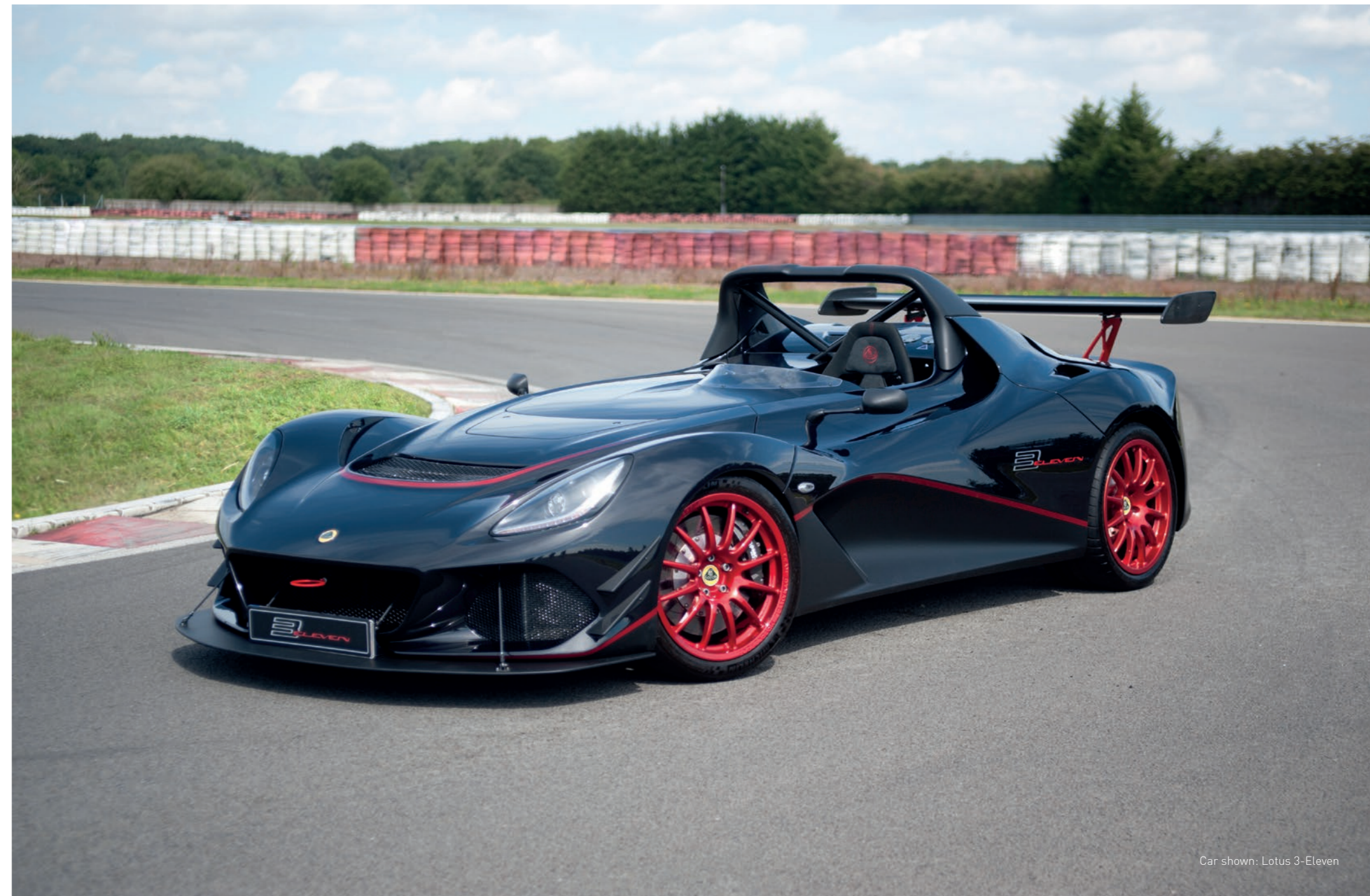
Car shown: Lotus 3-Eleven