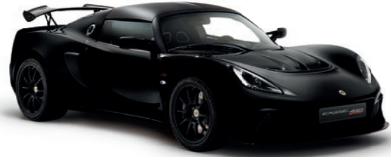
METALLIC BLACK C186