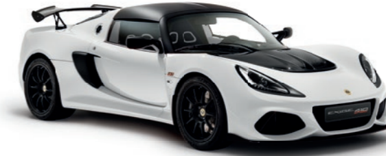
METALLIC WHITE C201