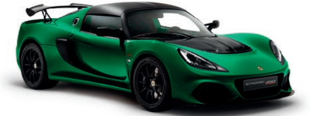
RACING GREEN C203