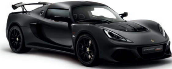
METALLIC DARK GREY C213

Images are for comparison use only, please speak to your local dealer for physical print samples.