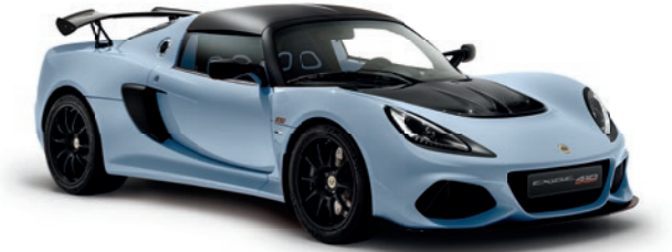
METALLIC LIGHT BLUE C208