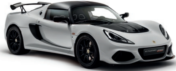
METALLIC SILVER C190