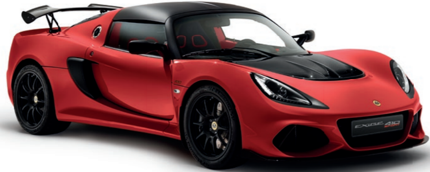
SOLID RED C183