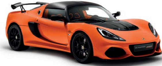
ELISE ORANGE C200