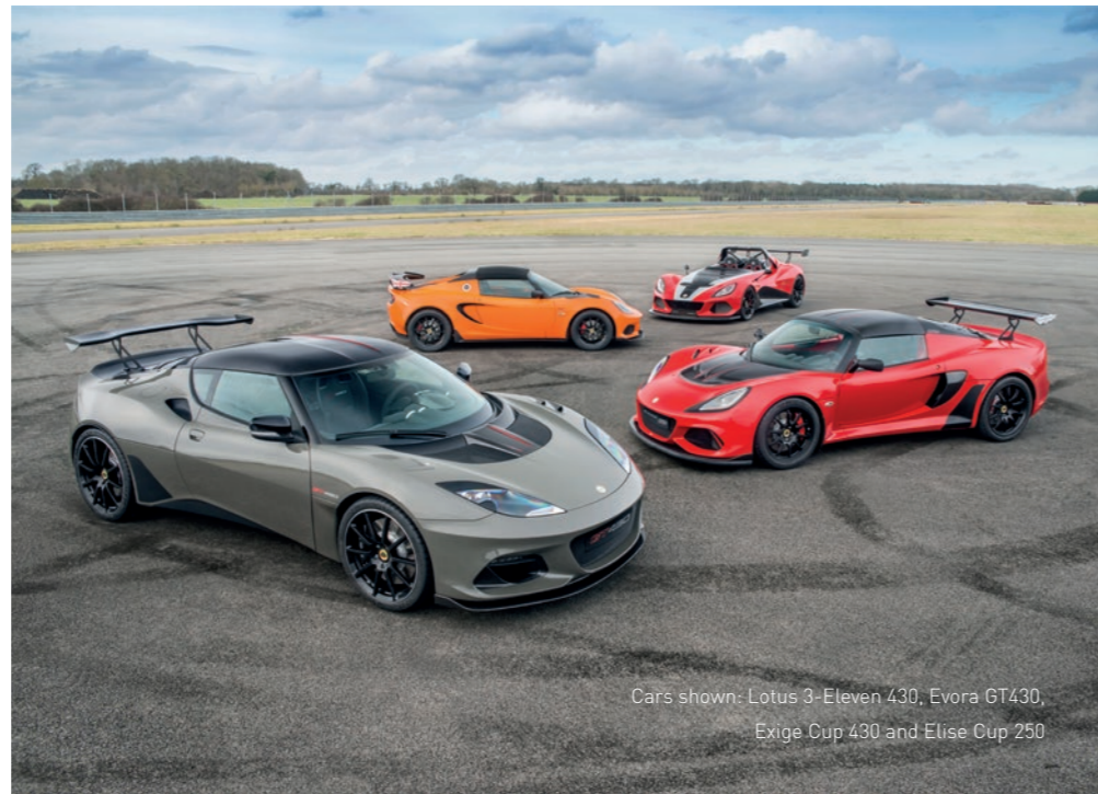
Cars shown: Lotus 3-Eleven 430, Evora GT430, Exige Cup 430 and Elise Cup 250

Today, the Lotus Lightweight Laboratory maintains Colin Chapman's legacy and ensures that his ethos is applied to every new model. After a complete strip down, every component is assessed and optimized through redesign, change of material, change of supplier or integration. If one part can be made to do the job of several, this is where it happens. Improvement is continuous. The quest to add lightness never ends. The result is the fastest, most exciting, most capable range of road cars Lotus has ever built.