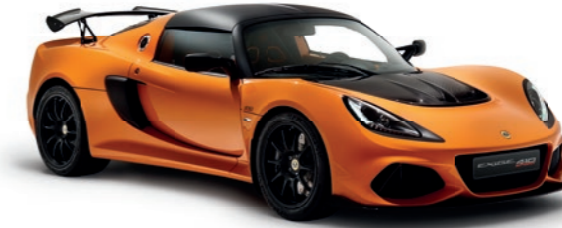
METALLIC ORANGE C205