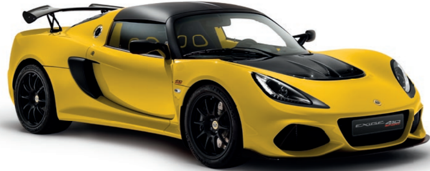
SOLID YELLOW C206