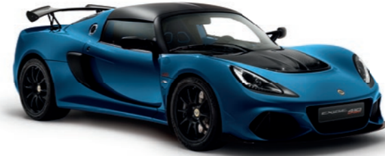
METALLIC BLUE C202