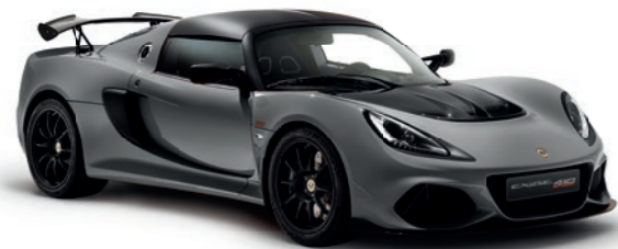
METALLIC GREY C185