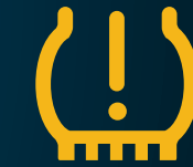
TIRE PRESSURE MONITORING SYSTEM

Six air bags* come standard on every Mazda5. Advanced dual front air bags utilize inflators with both crash-zone and driver's seat-position/passenger-weight sensors. Dual side-impact air bags and dual side-impact air curtains provide coverage for all three passenger rows.