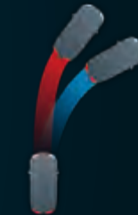
DYNAMIC STABILITY CONTROL