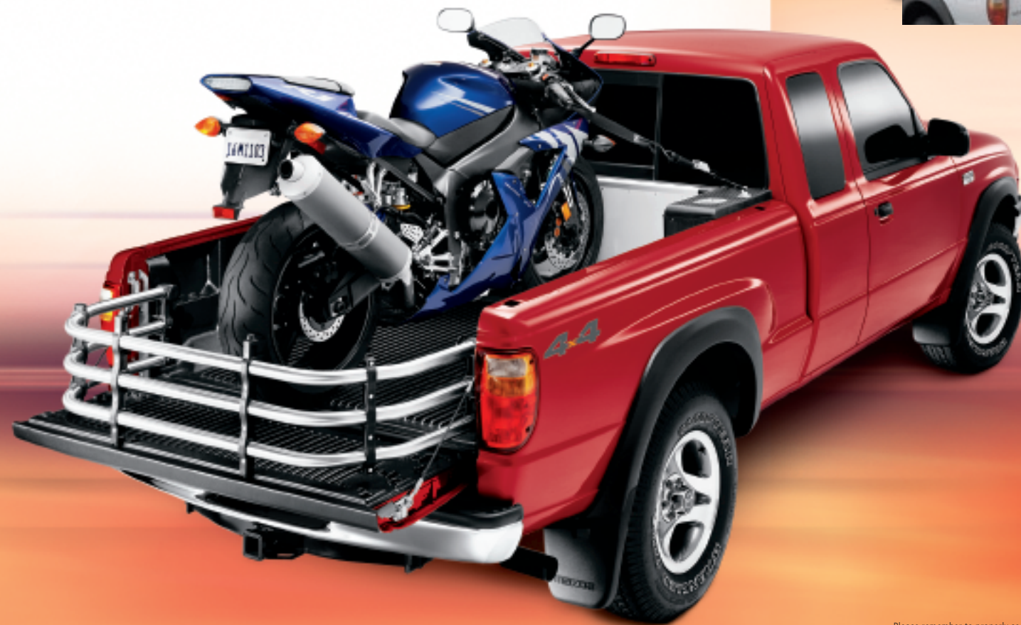
Please remember to properly secure all cargo.