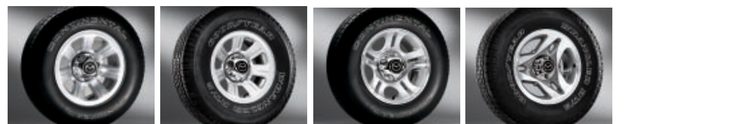
15-inch Styled Steel Base 4x2