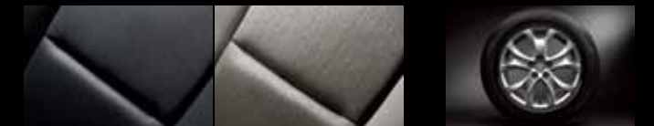
Black Cloth (Sport)