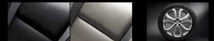
Black Leather (Touring and Grand Touring)