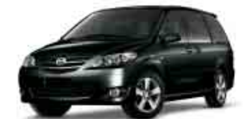
BLACK MICA • Mazda MPV LX • Mazda MPV ES