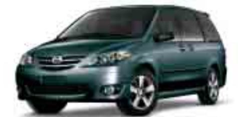
NORDIC GREEN MICA • Mazda MPV LX • Mazda MPV ES