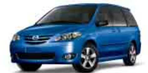
TSUNAMI BLUE MICA • Mazda MPV LX • Mazda MPV ES