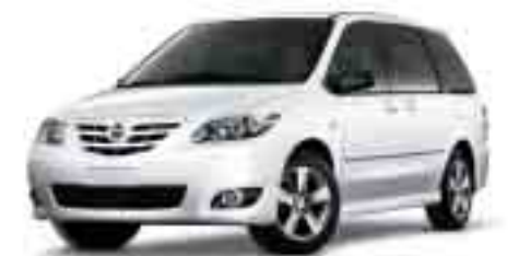
RALLY WHITE • Mazda MPV LX • Mazda MPV ES