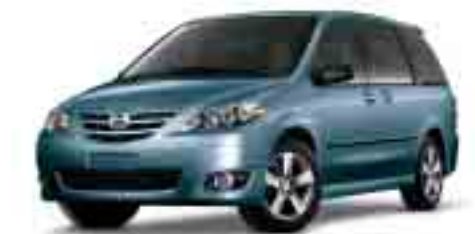
RAZOR BLUE METALLIC • Mazda MPV LX • Mazda MPV ES