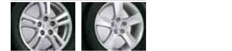
16-INCH ALLOY 17-INCH ALLOY