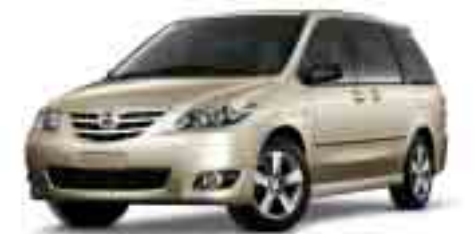
COSMIC SAND METALLIC • Mazda MPV LX • Mazda MPV ES