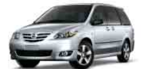
SUNLIGHT SILVER METALLIC • Mazda MPV LX • Mazda MPV ES