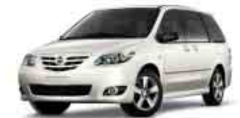
WHITewater PEARL (OPTIONAL) • Mazda MPV LX • Mazda MPV ES