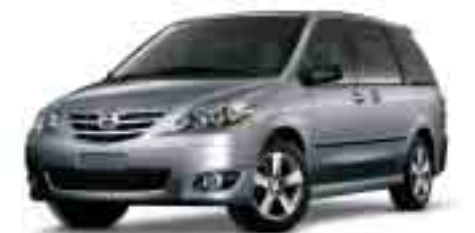
TITANIUM GRAY METALLIC • Mazda MPV LX • Mazda MPV ES