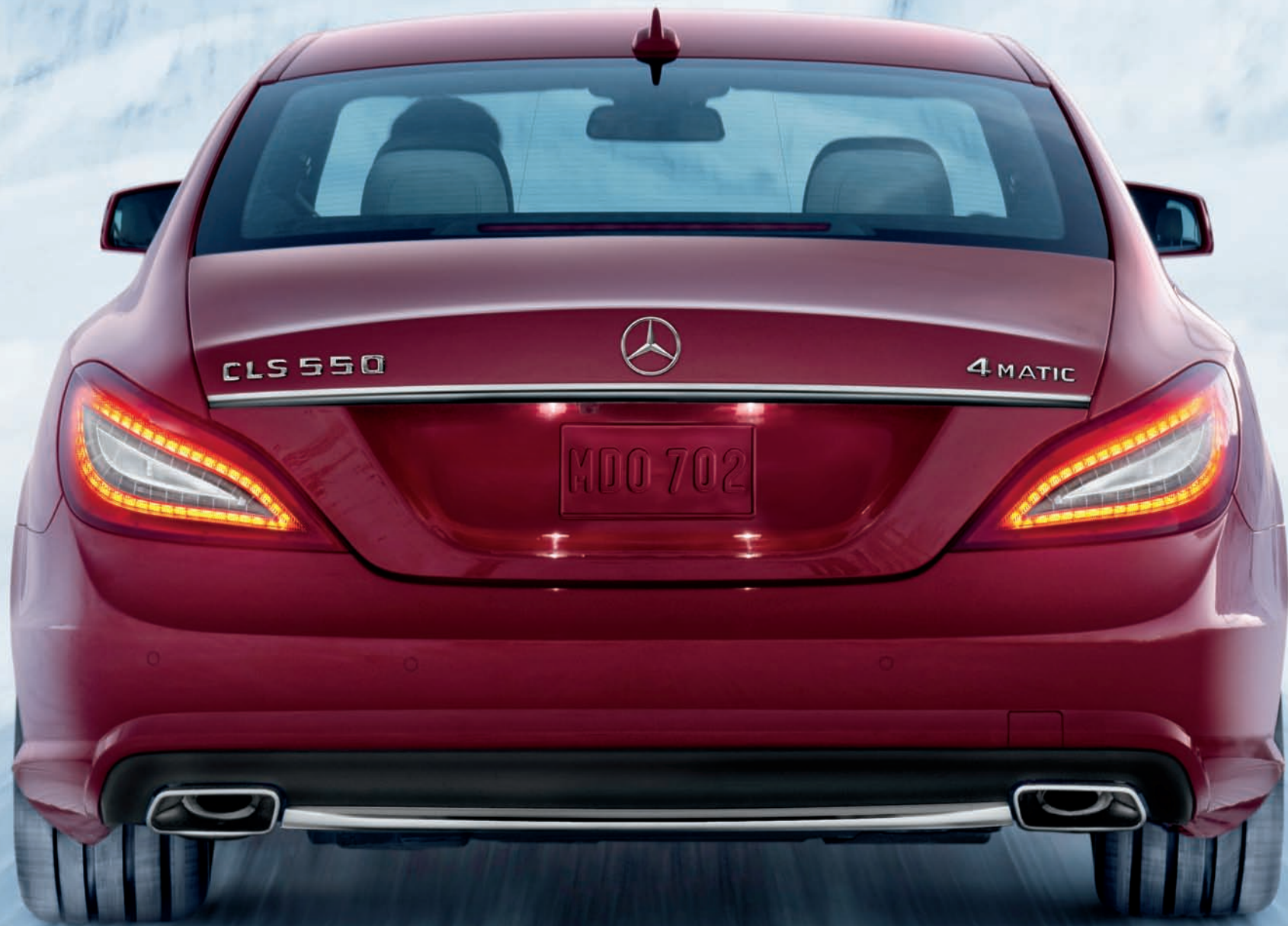
CLS 550 4MATIC shown with Storm Red metallic paint and optional Night View Assist PLUS, PARKTRONIC, and Driver Assistance and Premium 1 Packages. Please see endnotes at back of brochure.