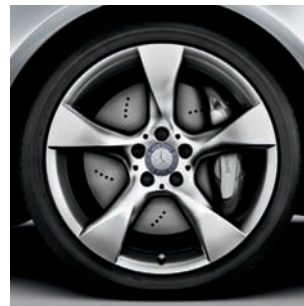
Optional 19" 5-spoke