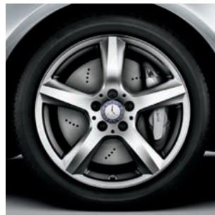
Standard 18" 5-spoke