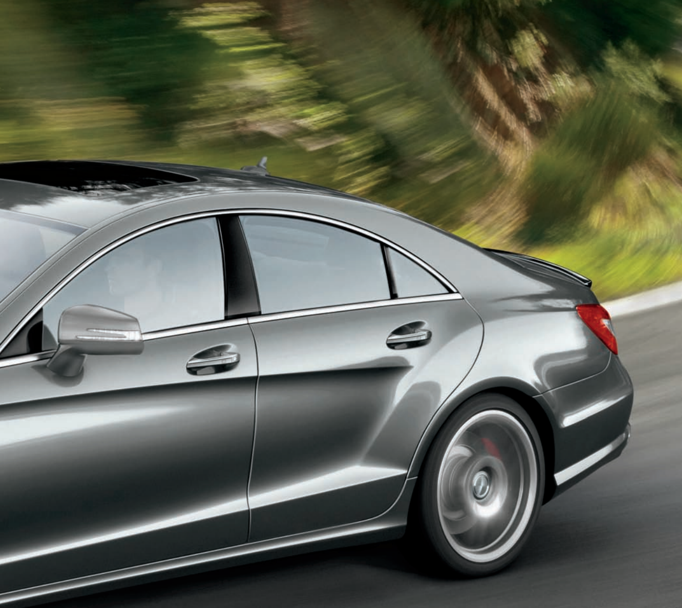
CLS 63 AMG shown with Palladium Silver metallic paint, and optional PARKTRONIC and AMG Performance, Driver Assistance and Premium 1 Packages. Please see endnotes at back of brochure.