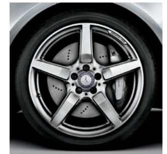
Optional 19" AMG 5-spoke (Wheel Package Plus One)

individually chosen. exquisitely crafted.