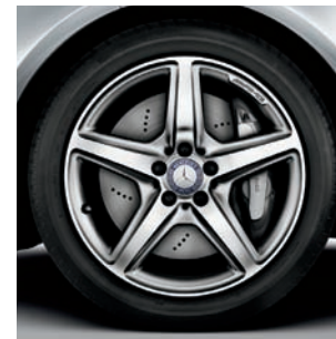
Optional 18" AMG 5-spoke (Wheel Package)