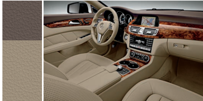
Almond/Mocha (requires Burl Walnut wood trim)