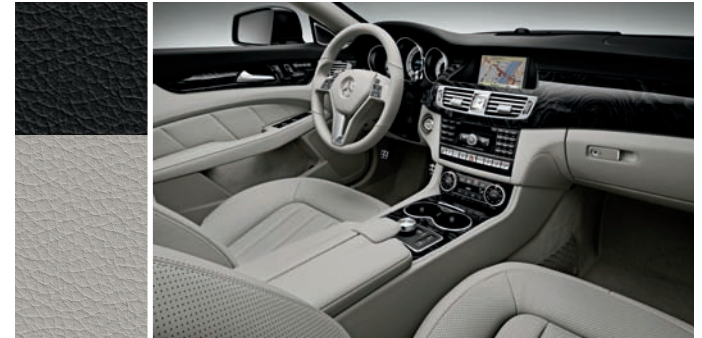
Ash/Black (requires Black Ash wood trim)