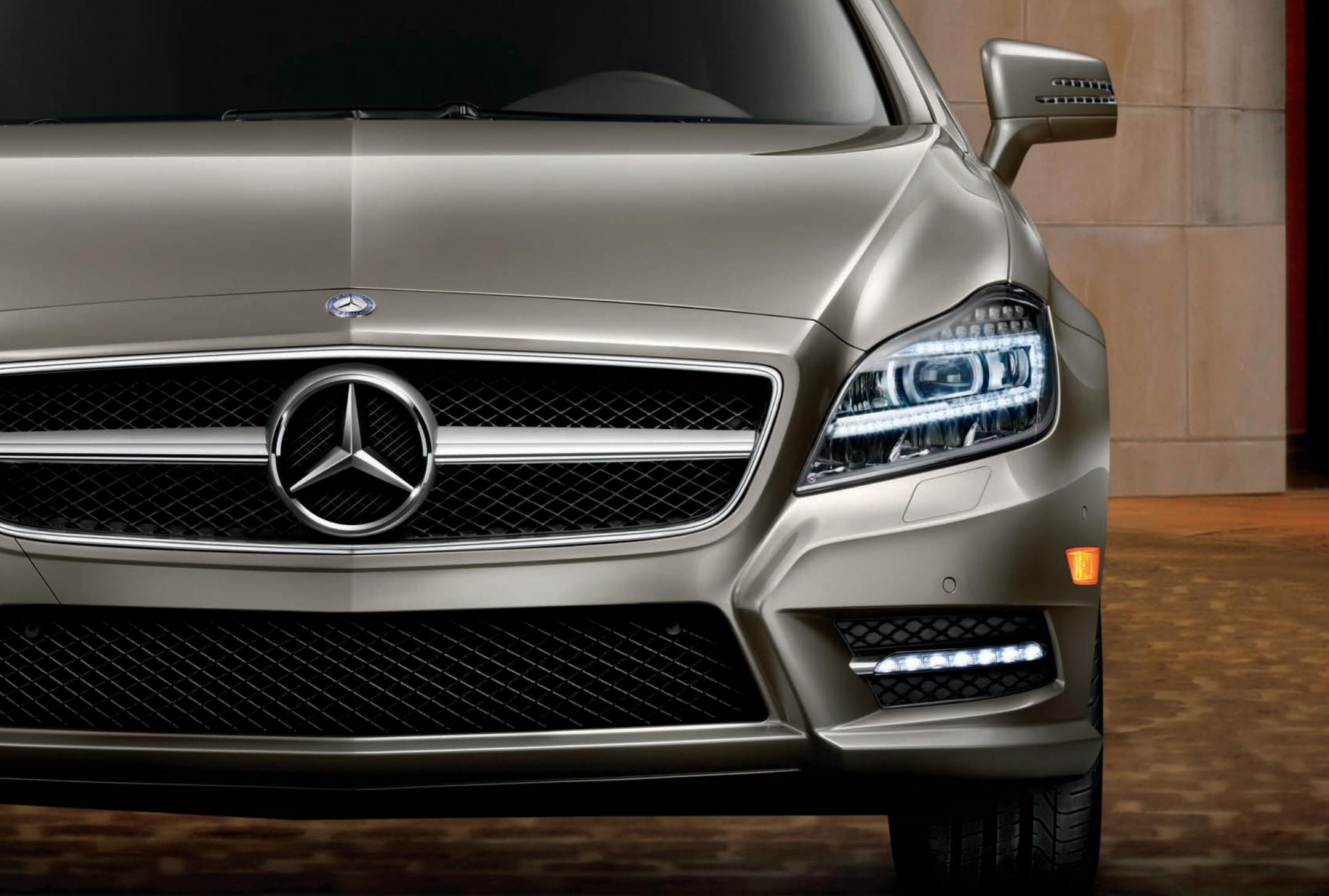
CLS550 shown with Indium Grey metallic paint and optional PARKTRONIC and Premium 1 Package.