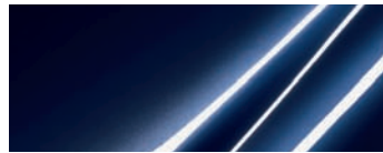
Lunar Blue 23