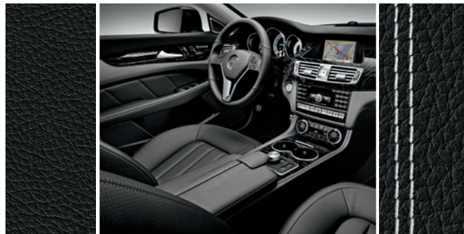
Black (Wheel Packages add contrasting Grey stitching)