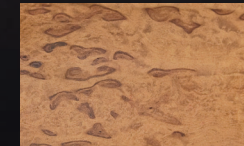
Light Birch (GL 550 only)