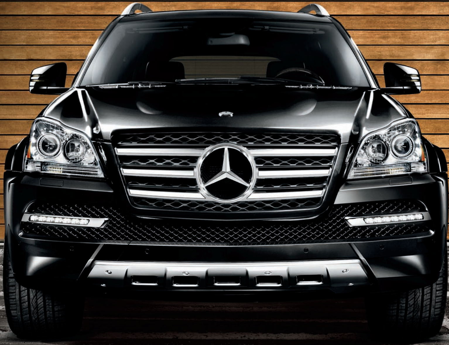
GL 550 shown with Obsidian Black metallic paint and optional PARKTRONIC.