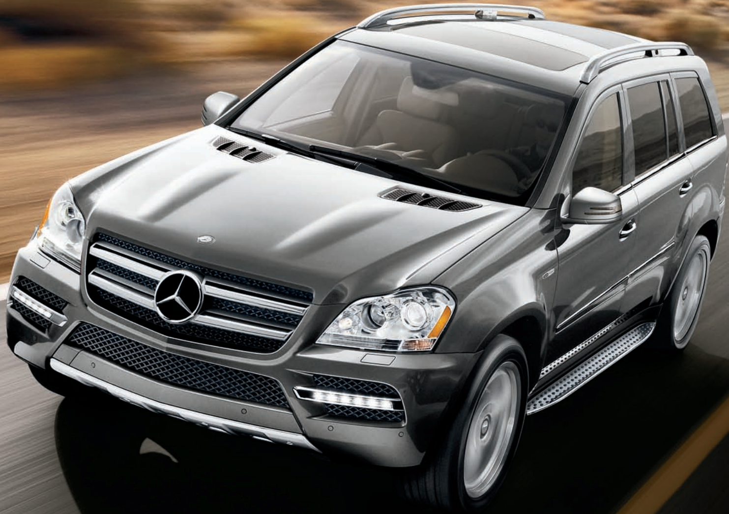
GL 350 BlueTEC shown with optional Palladium Silver metallic paint, brushed aluminum running boards, PARKTRONIC, and Lighting and Premium 1 Packages. Please see endnotes at back of brochure.