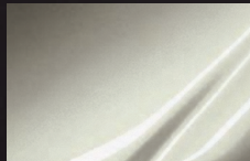
Diamond White 18