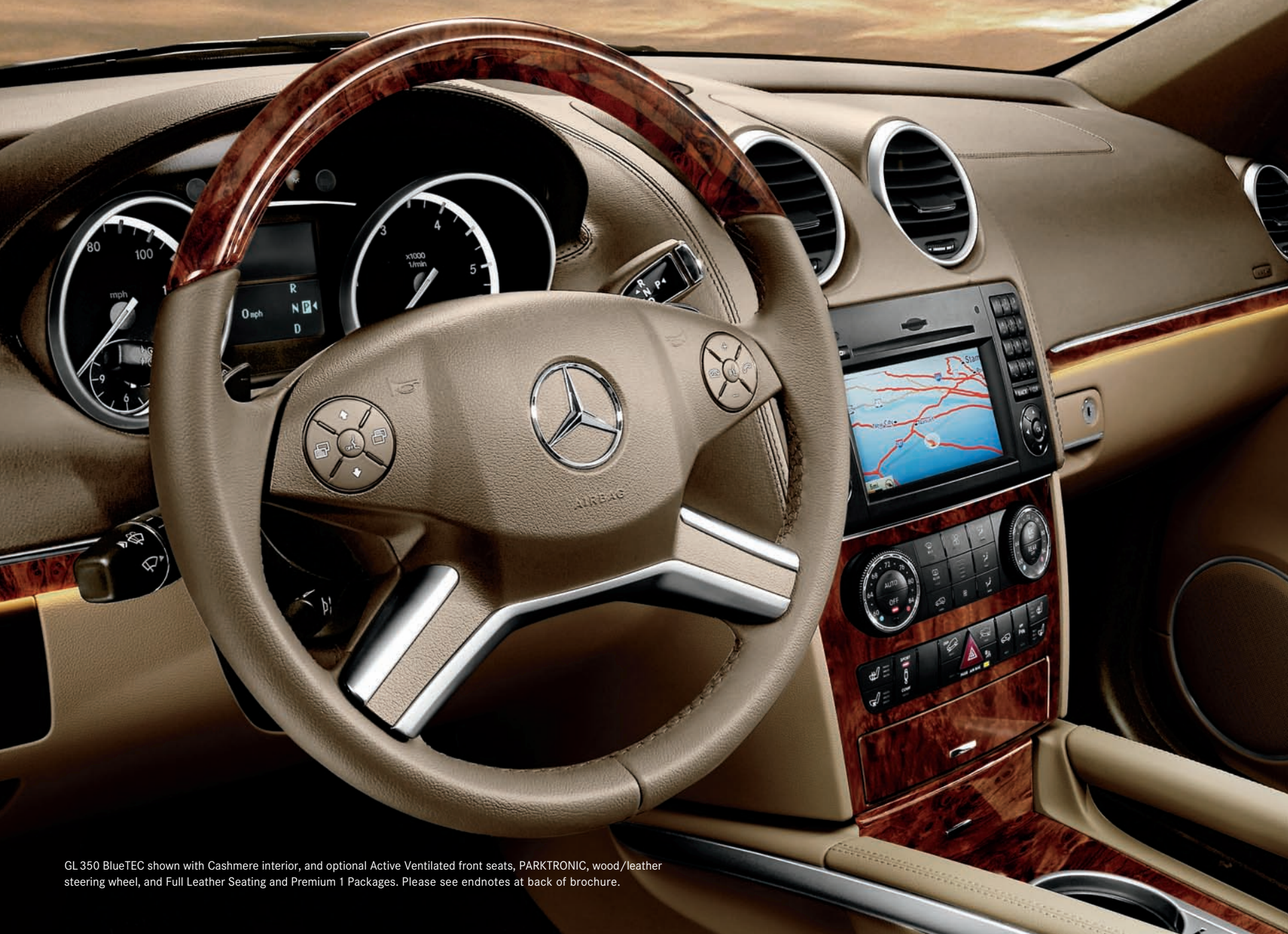
GL 350 BlueTEC shown with Cashmere interior, and optional Active Ventilated front seats, PARKTRONIC, wood/leather steering wheel, and Full Leather Seating and Premium 1 Packages. Please see endnotes at back of brochure.