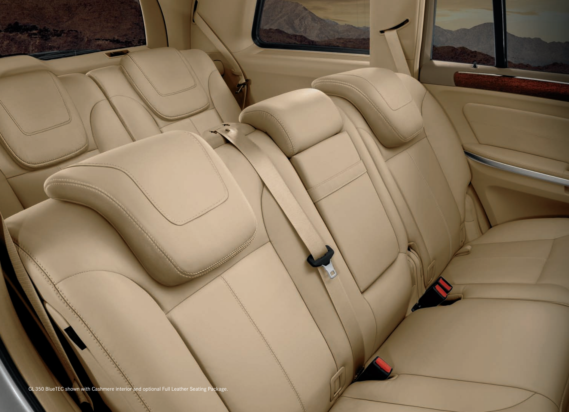
GL 350 BlueTEC shown with Cashmere interior and optional Full Leather Seating Package.