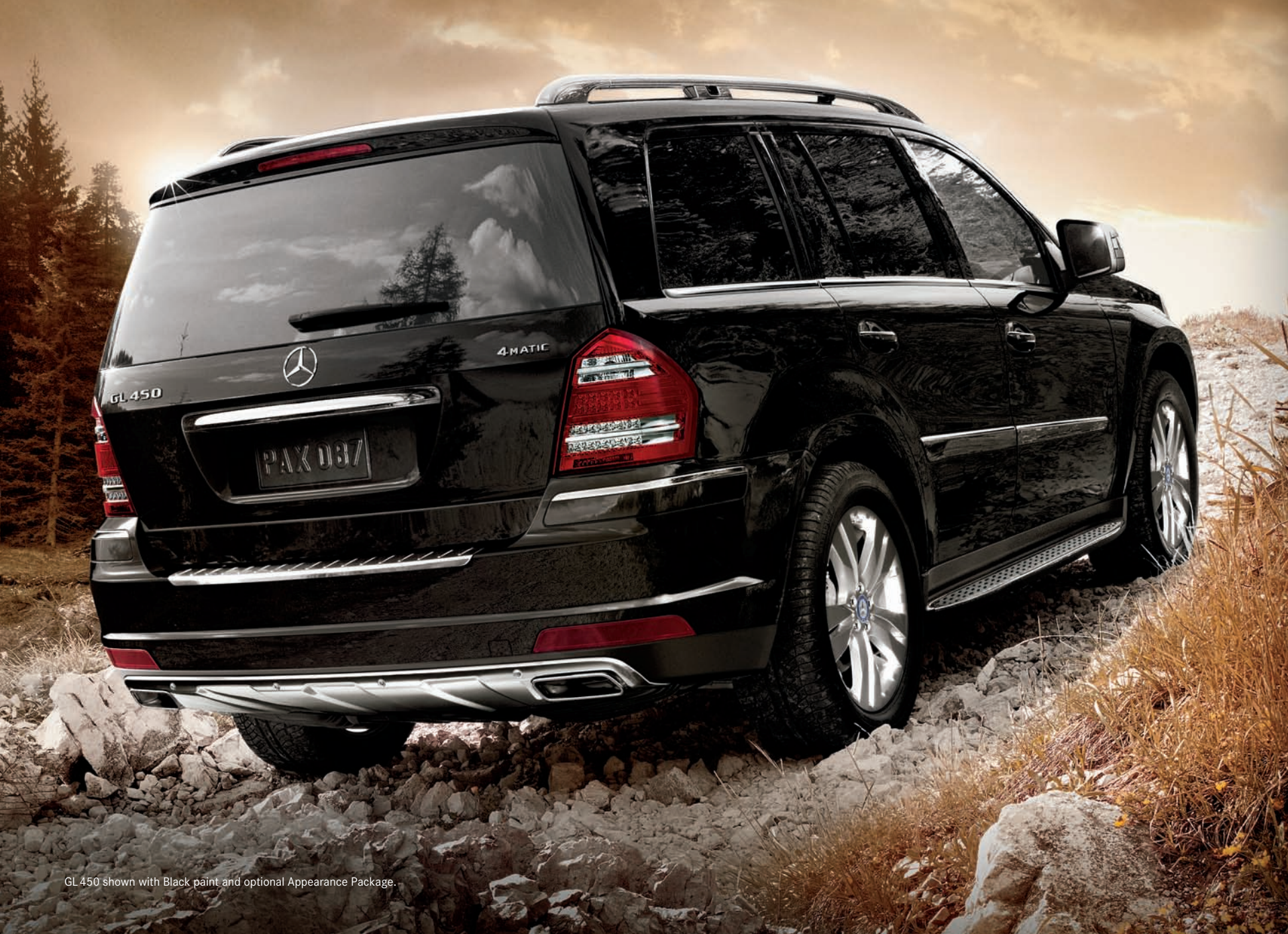
GL 450 shown with Black paint and optional Appearance Package.