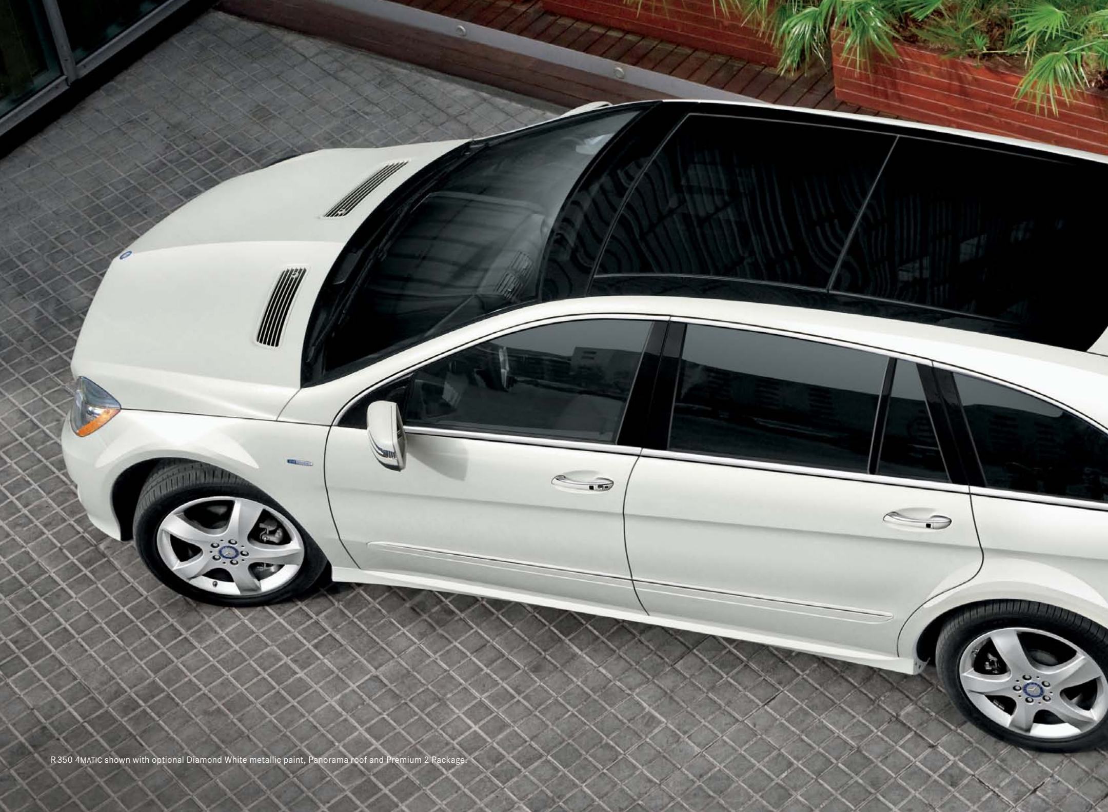
R350 4MATIC shown with optional Diamond White metallic paint, Panorama roof and Premium 2 Package.