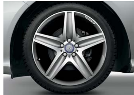
Optional 20" AMG 5-spoke (Sport Appearance Package)

R 350 4MATIC shown with optional Capri Blue metallic paint, Lighting and Premium 2 Package.