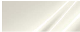
Diamond White 19