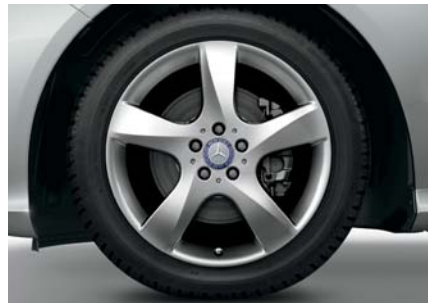
Standard 19" 5-spoke