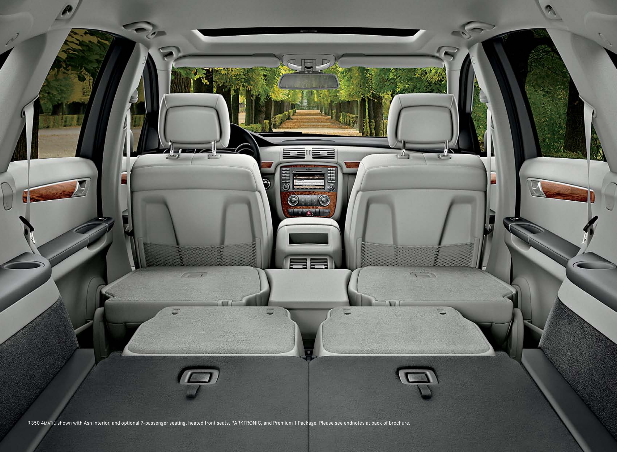
R350 4MATIC shown with Ash interior, and optional 7-passenger seating, heated front seats, PARKTRONIC, and Premium 1 Package. Please see endnotes at back of brochure.