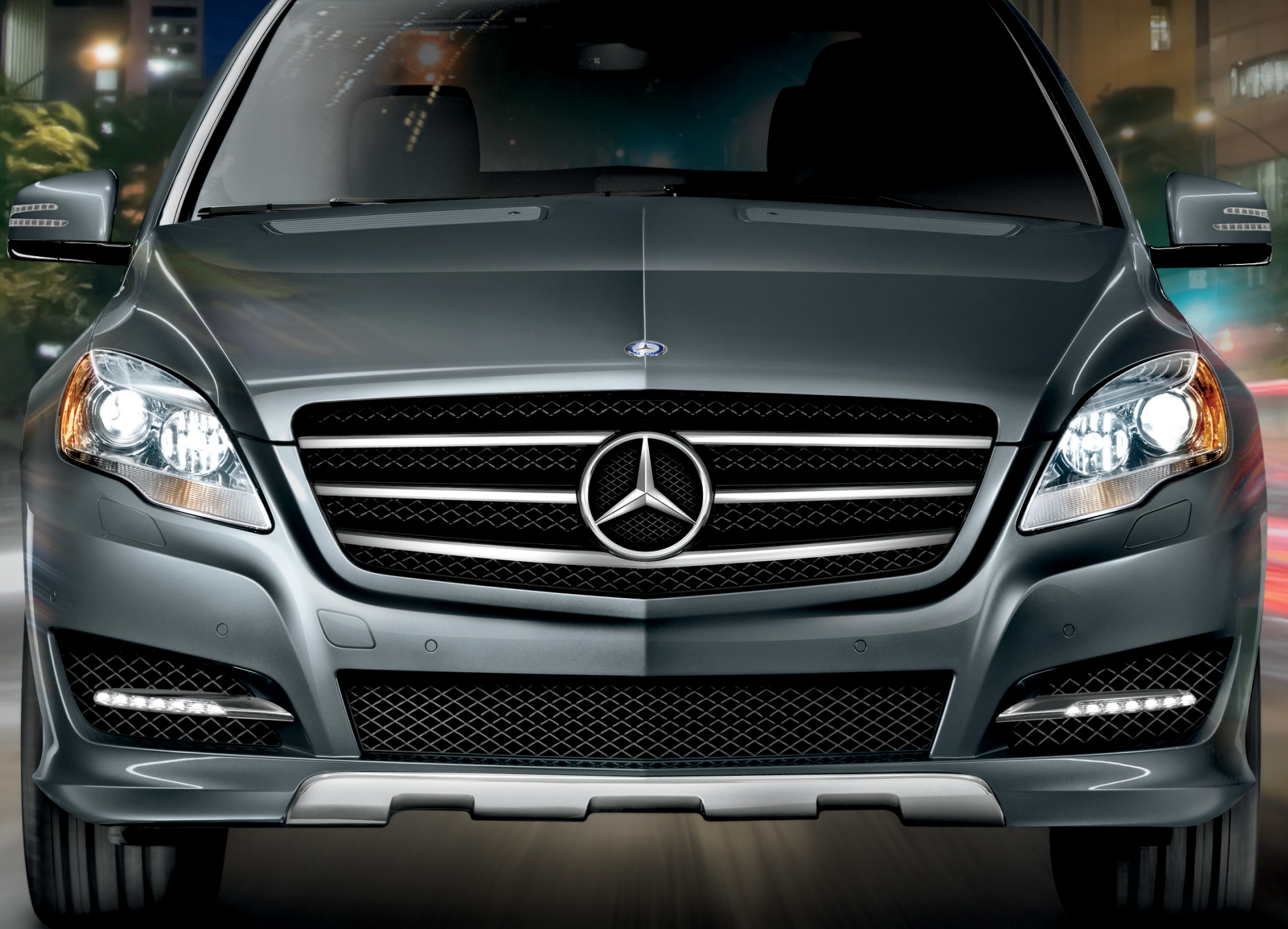
R350 4MATIC shown with optional Steel Grey metallic paint, PARKTRONIC, and Lighting and Premium 1 Packages. Please see endnotes at back of brochure.