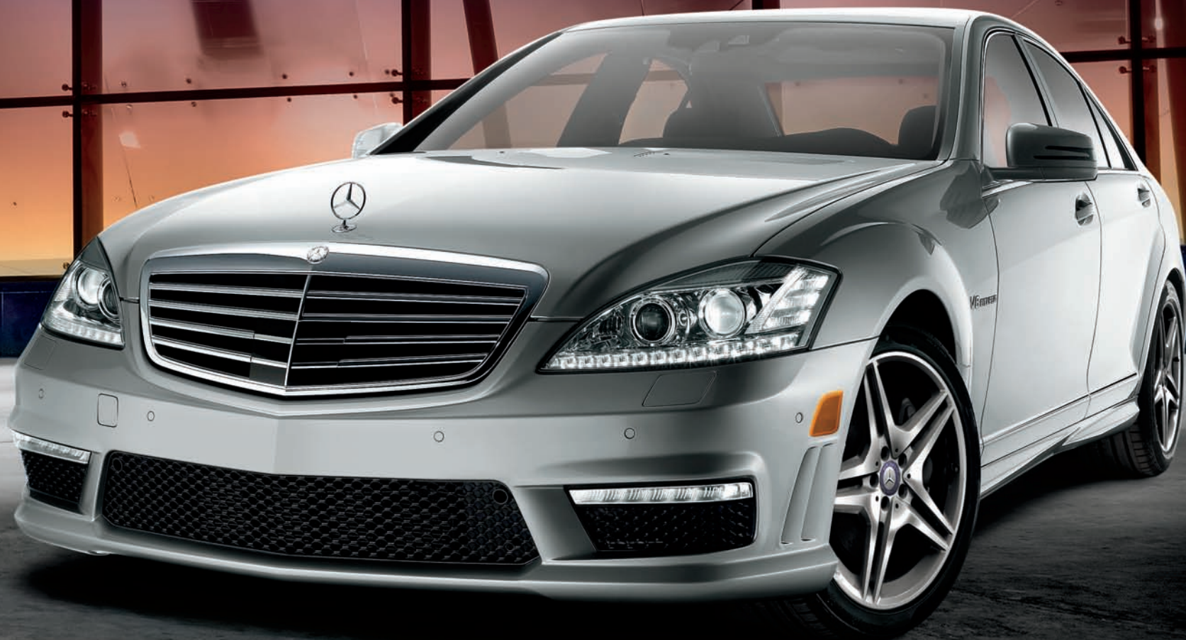
S 63 AMG shown with Iridium Silver metallic paint and optional Driver Assistance Package. Please see endnotes at back of brochure.