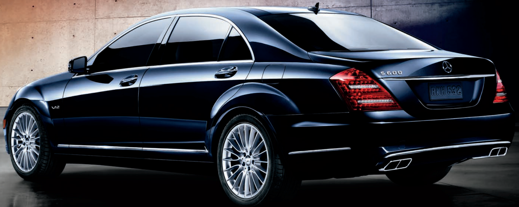
S 600 shown with Capri Blue metallic paint. Please see endnotes at back of brochure.