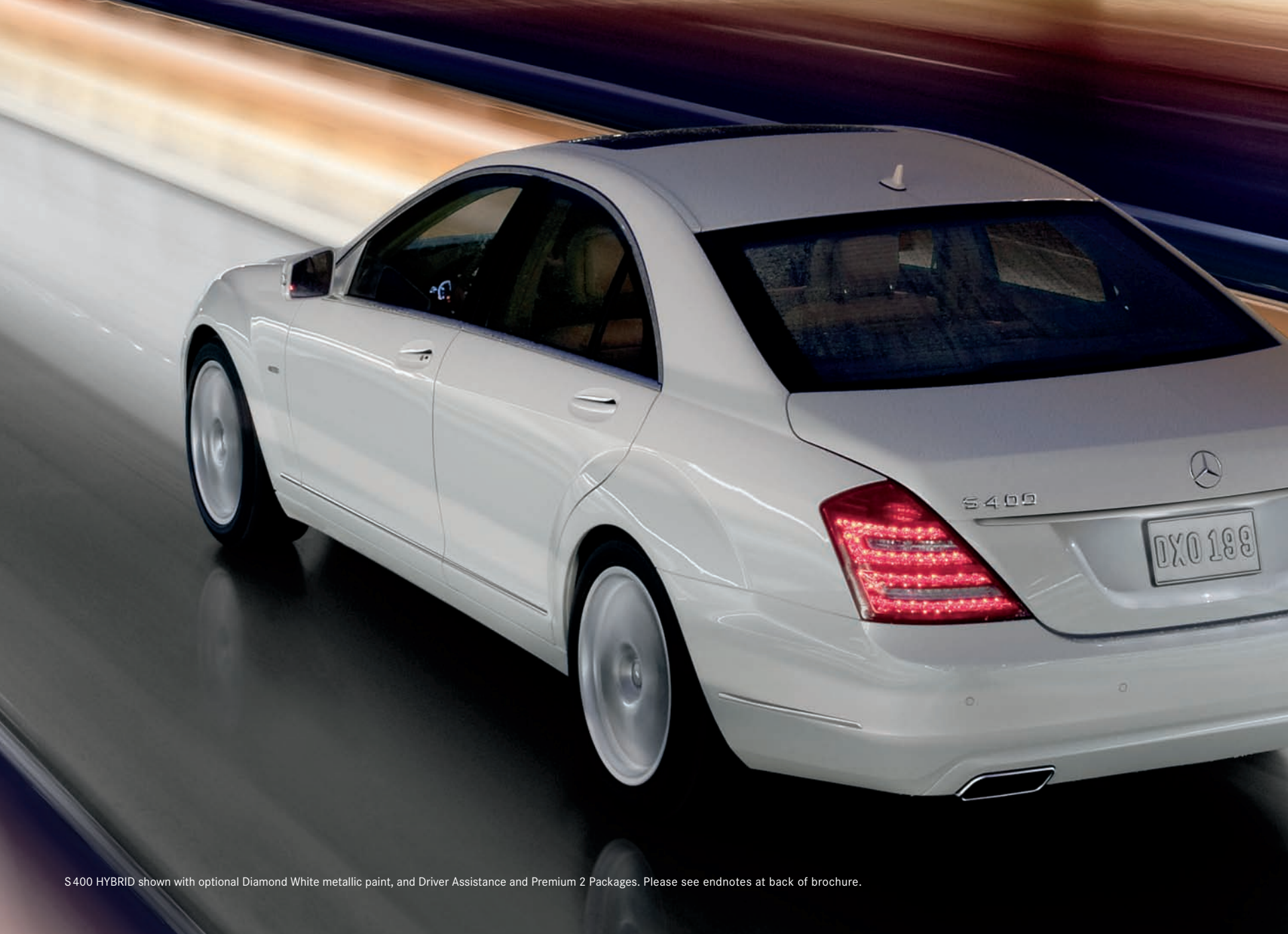
S 400 HYBRID shown with optional Diamond White metallic paint, and Driver Assistance and Premium 2 Packages. Please see endnotes at back of brochure.