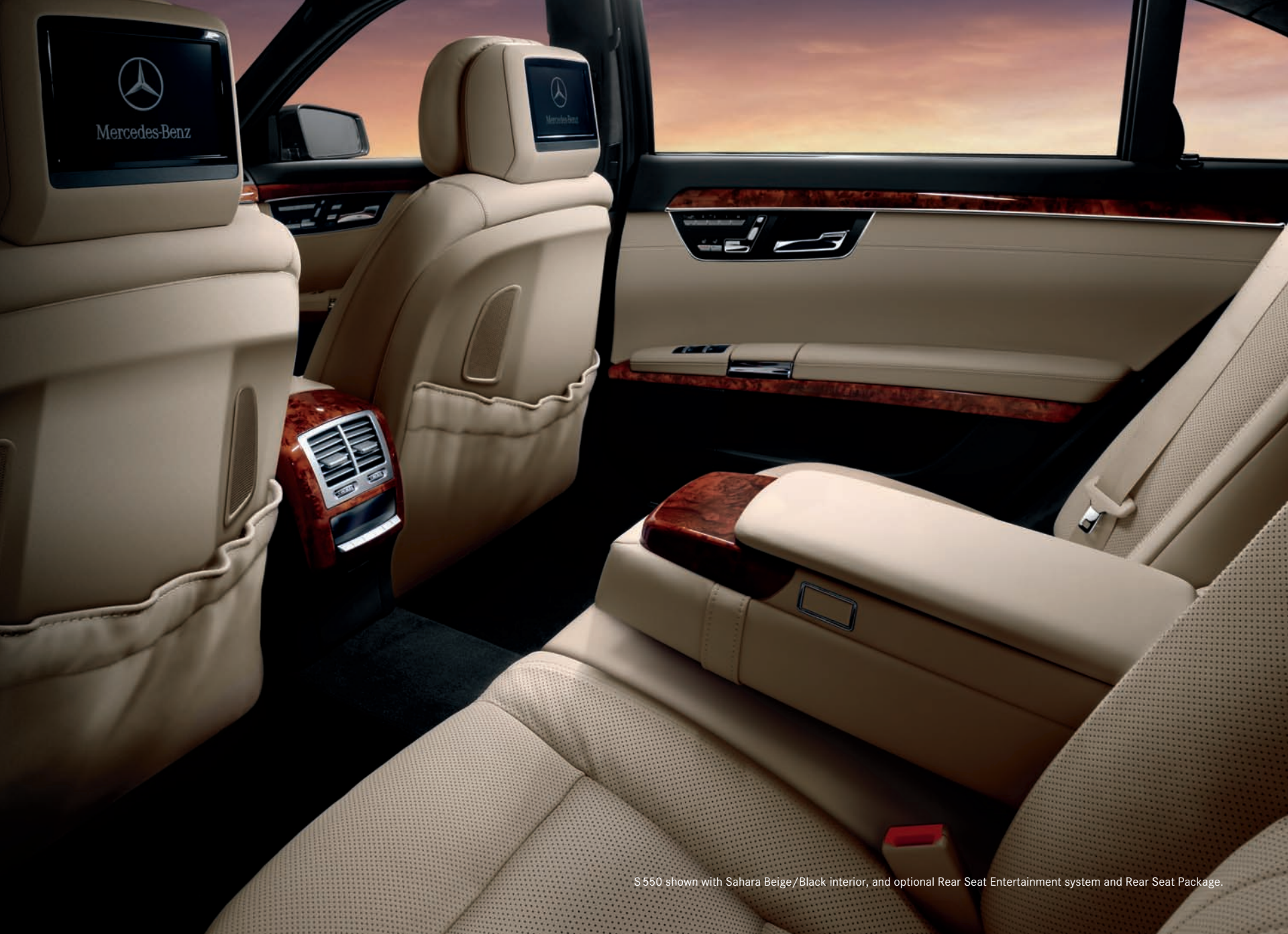
S 550 shown with Sahara Beige/Black interior, and optional Rear Seat Entertainment system and Rear Seat Package.