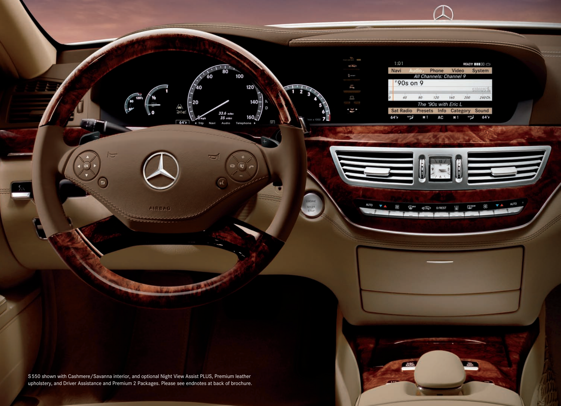
S 550 shown with Cashmere/Savanna interior, and optional Night View Assist PLUS, Premium leather upholstery, and Driver Assistance and Premium 2 Packages. Please see endnotes at back of brochure.