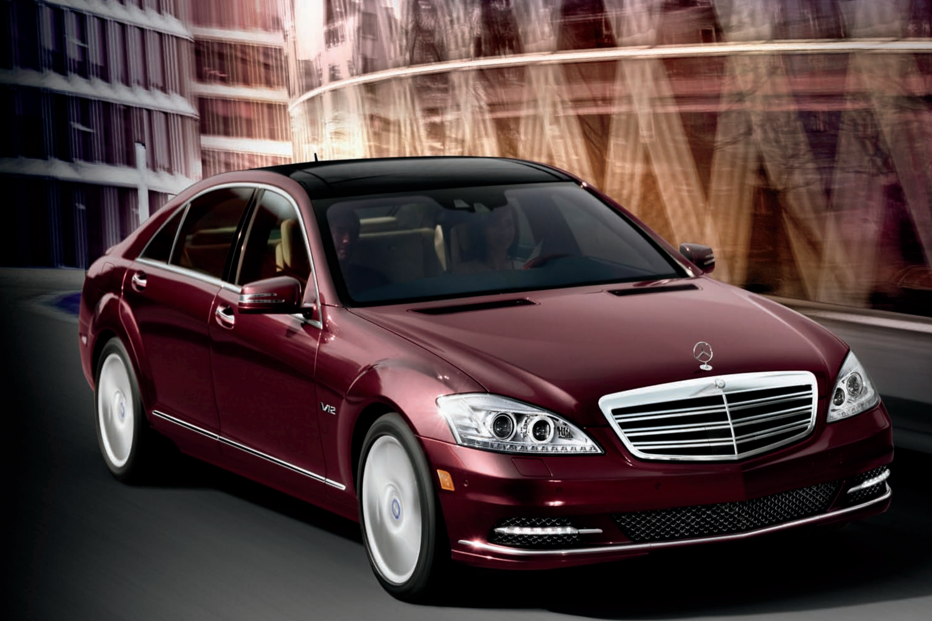
S 600 shown with Barolo Red metallic paint. Please see endnotes at back of brochure.