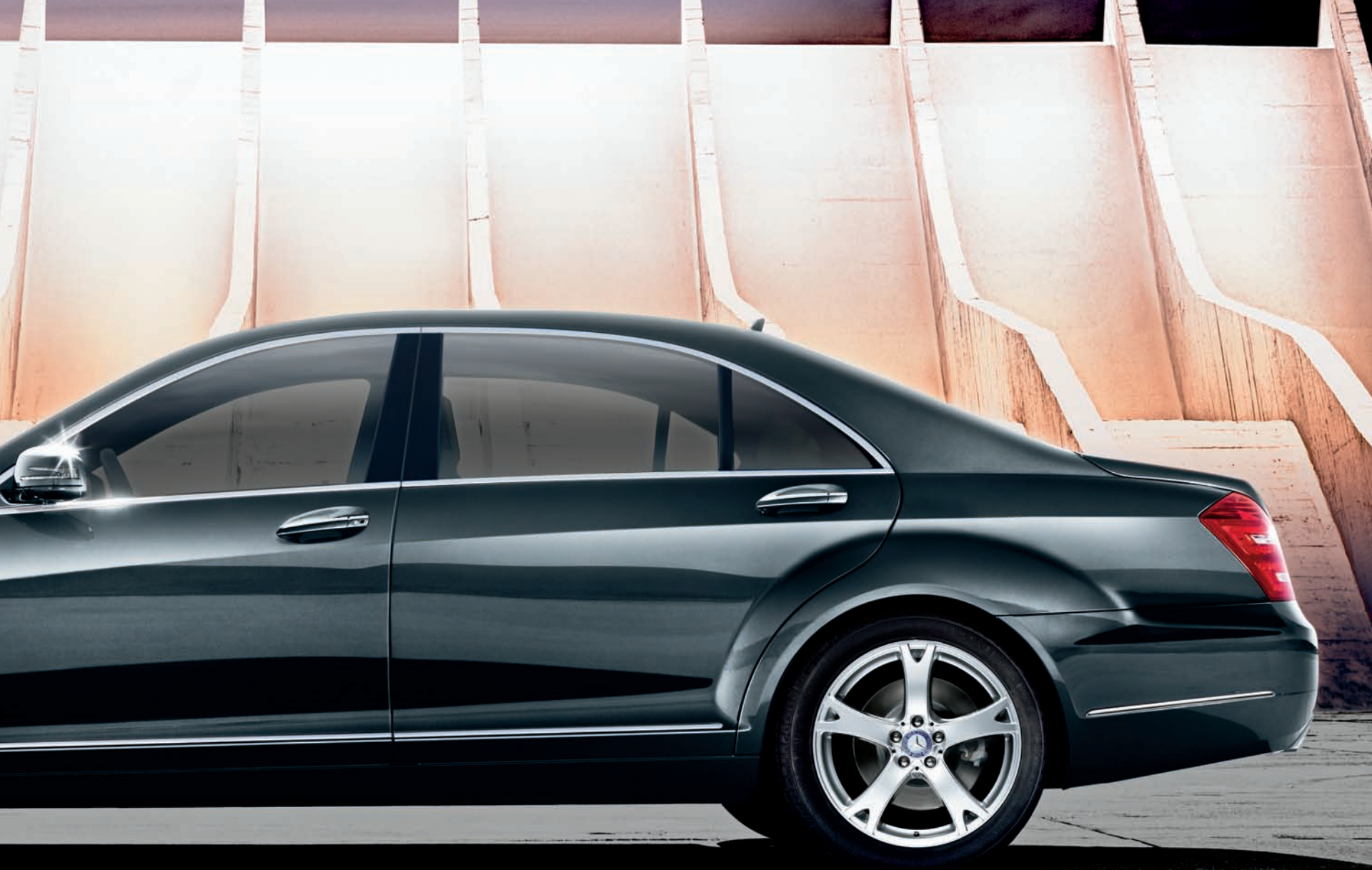
S 550 shown on covers with Iridium Silver metallic paint, and optional 4MATIC all-wheel drive, Panorama sunroof and Sport Package. S 550 shown above with Flint Grey metallic paint and optional 19" 5-spoke wheels.