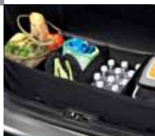
Interior soft cargo organizer (large size)