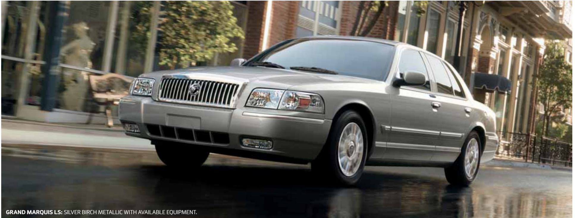
GRAND MARQUIS LS: SILVER BIRCH METALLIC WITH AVAILABLE EQUIPMENT.