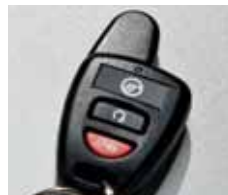
Remote start systems

To learn more about Mercury Custom Accessories and to buy them online, visit mercuryaccessories.com .