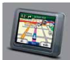
Garmin® portable navigation systems 1