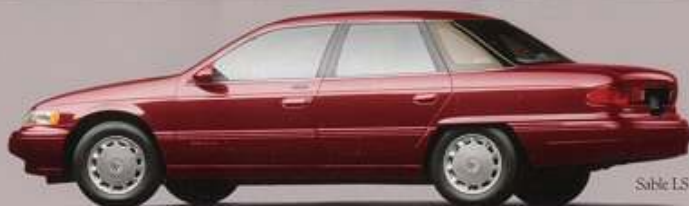
Sable LS shown in Electric Red Clearcoat Metallic.

the first car in its class to offer standard dual air bags and ABS brakes. Combined with the smooth power of its V-6 and the many amenities you expect in a Mercury, it is no wonder the Sable remains at the top of its class.