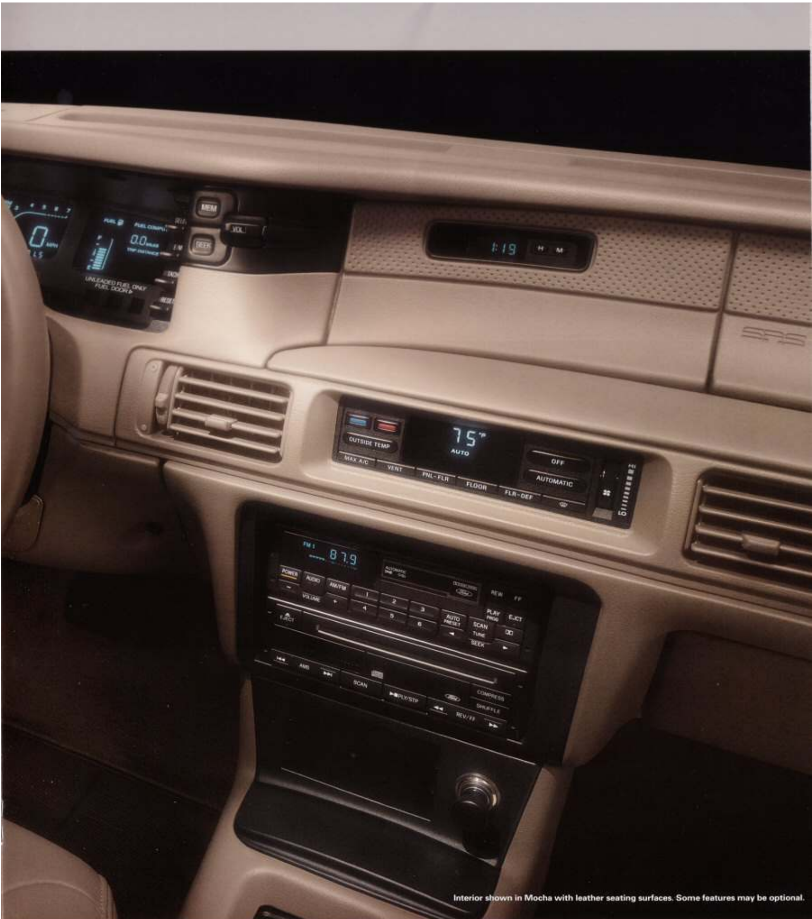
Interior shown in Mocha with leather seating surfaces. Some features may be optional.