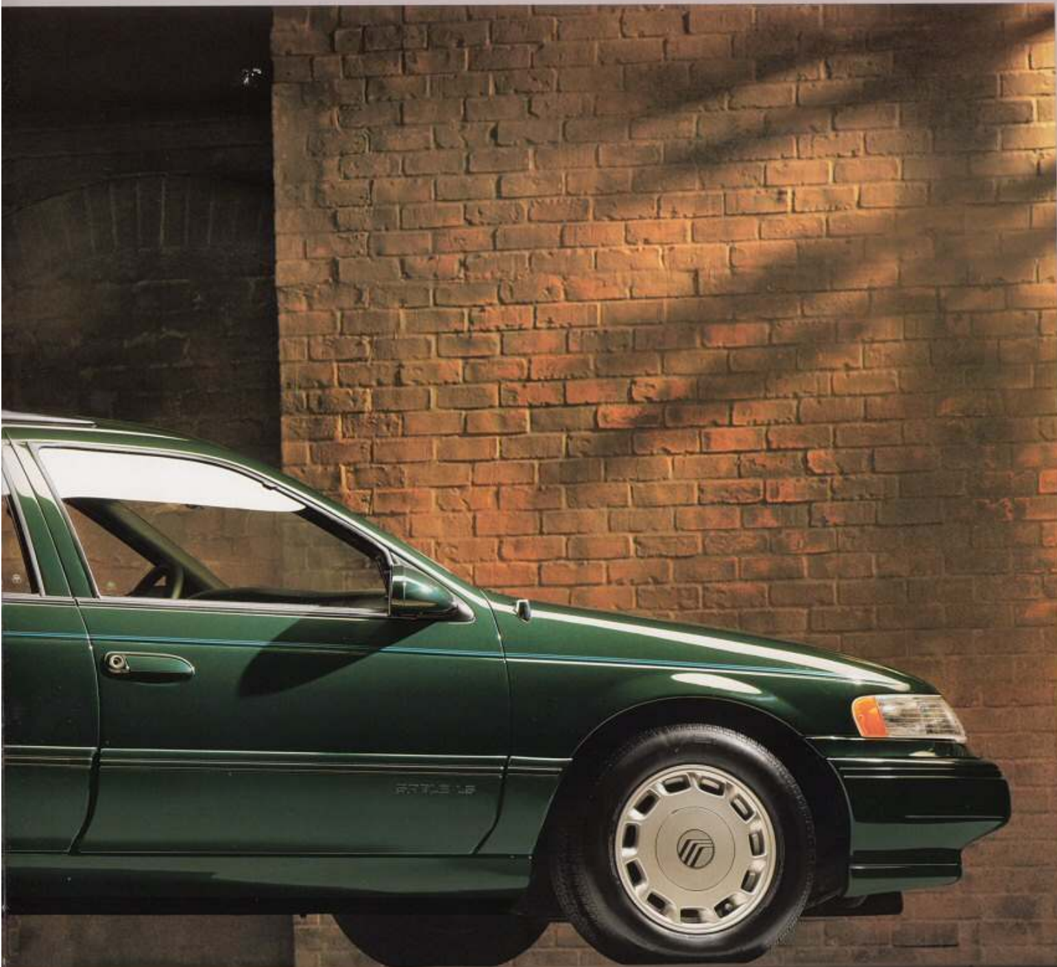
Sable LS Wagon shown in Deep Jewel Green Clearcoat Metallic. Some features may be optional.

The stunning Sable Wagon continues to elicit praise for its contemporary styling. No other car combines style and versatility as well as this wagon. Whether hauling groceries or taking the family to the cottage, the Sable Wagon performs above and beyond anything else on the road.