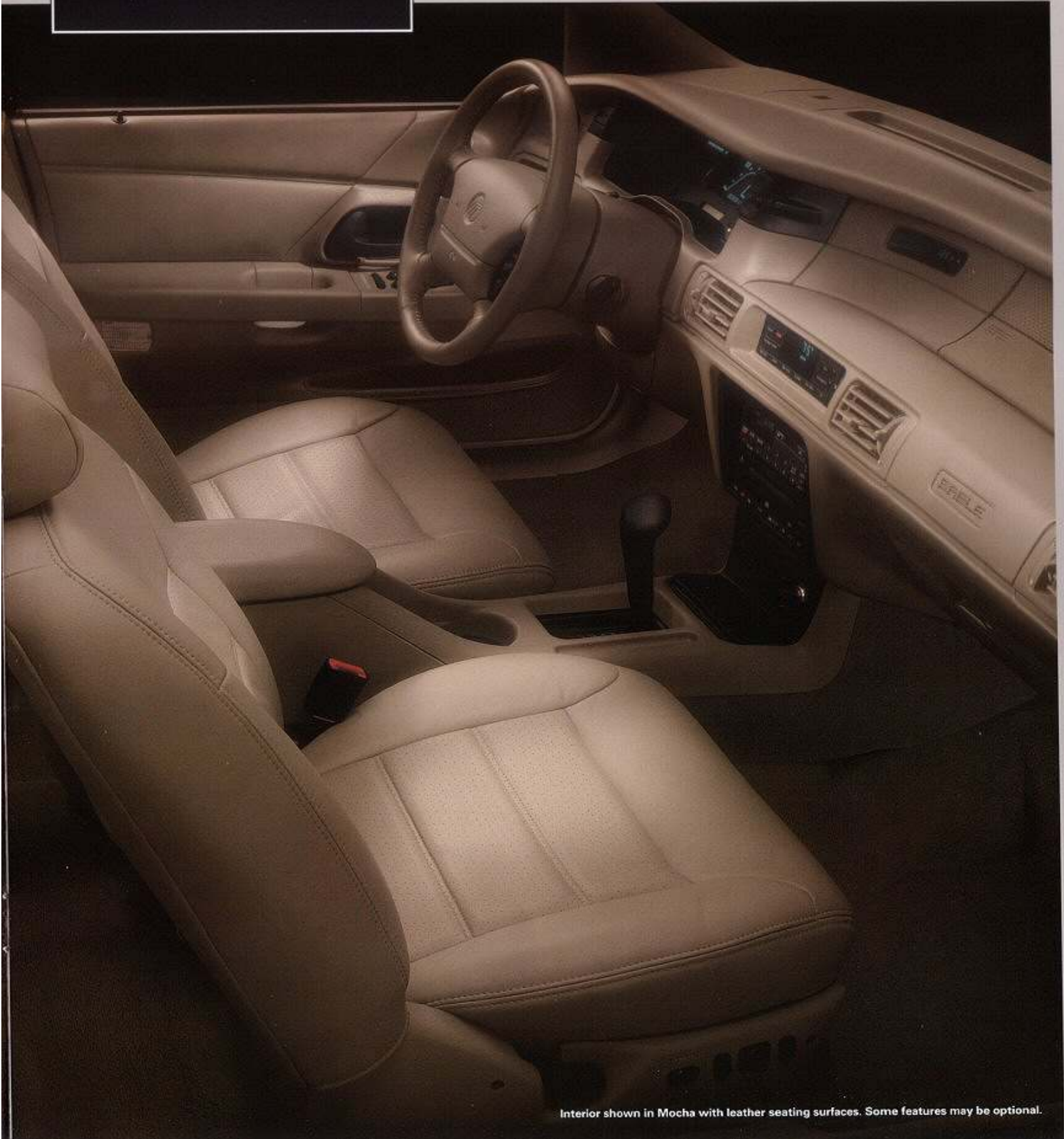
Interior shown in Mocha with leather seating surfaces. Some features may be optional.

You'll find Sable has a strikingly spacious interior. No doubt, you will soon get used to the accommodating seats and armrests, the generous headroom and easily manageable controls. So lean back and enjoy an interior designed to leave you feeling as comfortable as possible.