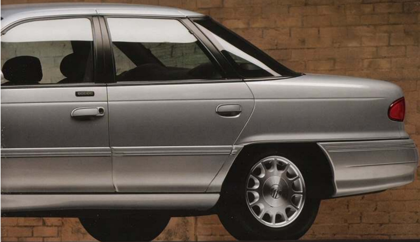
Sable LTS shown in Silver Frost Clearcoat Metallic. Some features may be optional.

the first car in its class to offer standard dual air bags and ABS brakes. Combined with the smooth power of its V-6 and the many amenities you expect in a Mercury, it is no wonder the Sable remains at the top of its class.