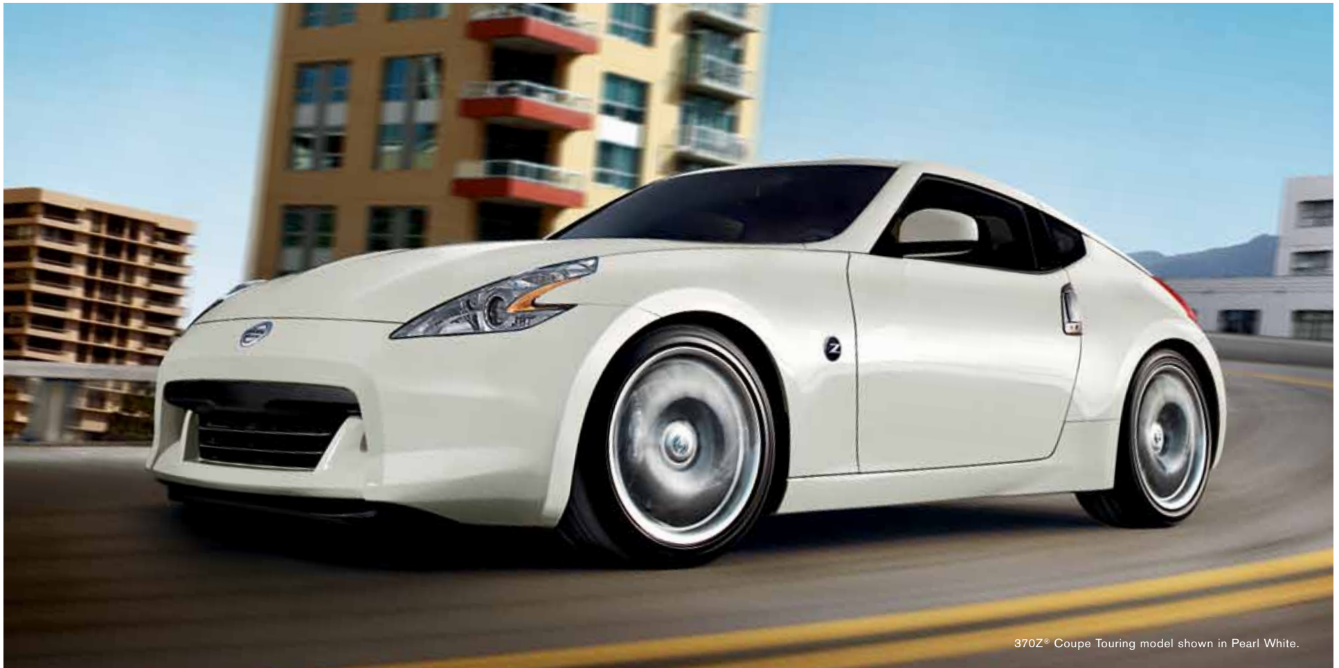
370Z® Coupe Touring model shown in Pearl White.