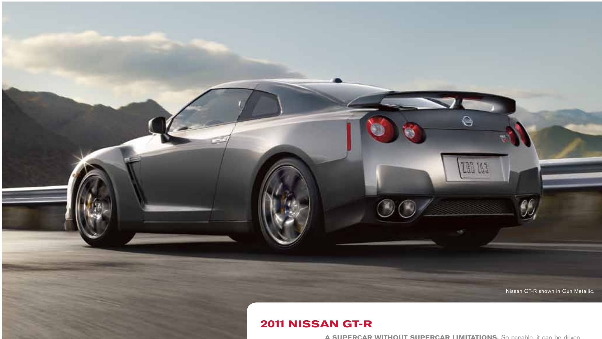
Nissan GT-R shown in Gun Metallic.