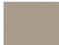
SL Beige Leather