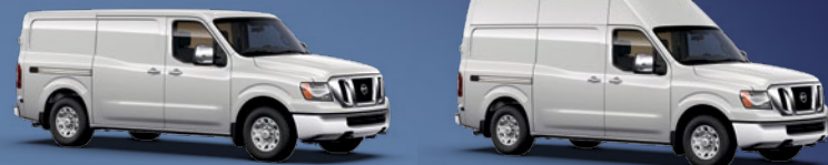
STANDARD ROOF NV1500/NV2500 HD/NV3500 HD