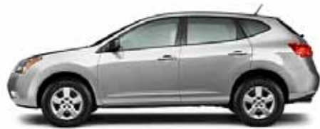
S: YOUR ALLY ON CITY STREETS. AND OFF.