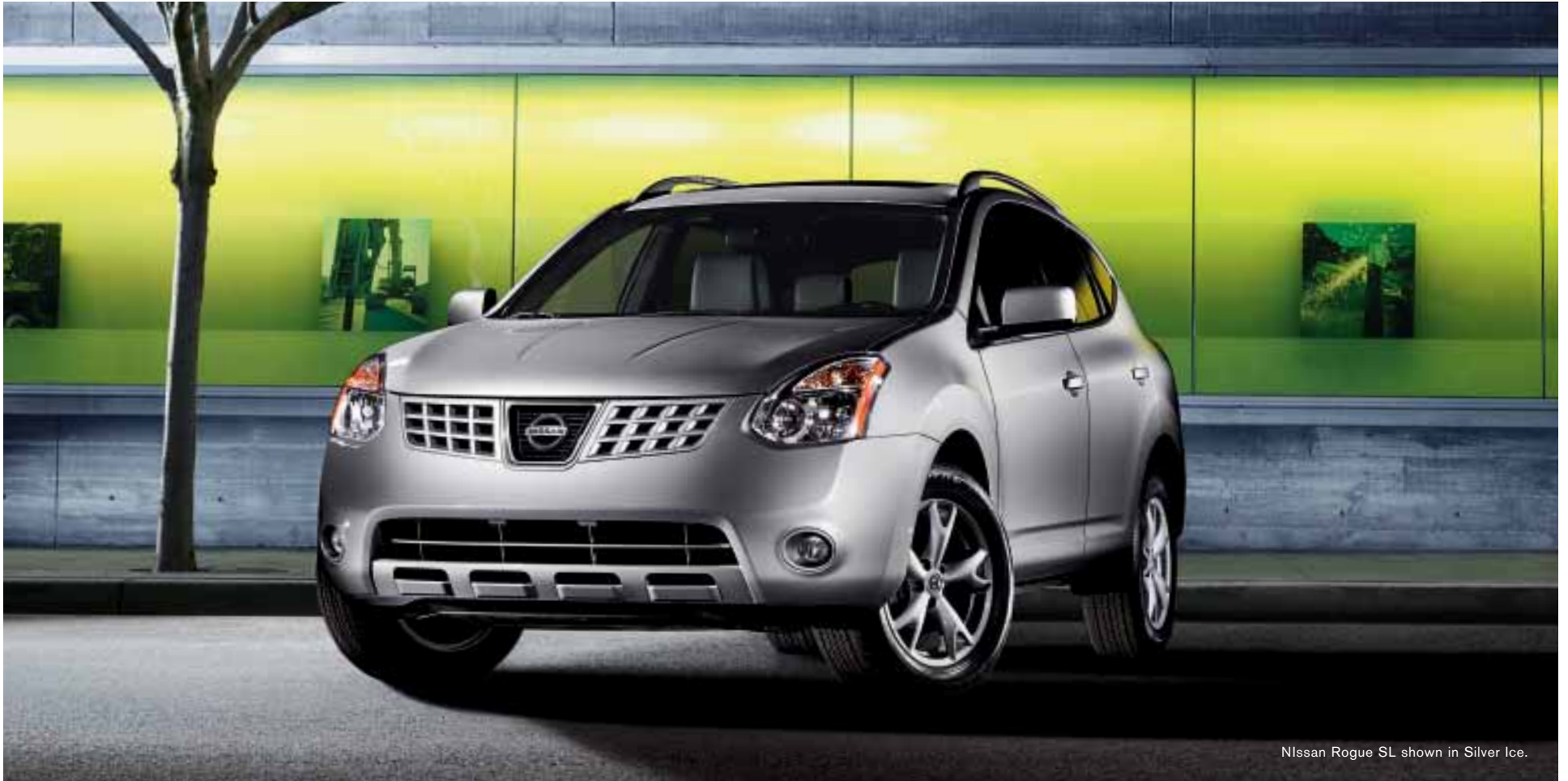
Nissan Rogue SL shown in Silver Ice.