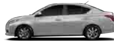
1.6 SL: CLASS AND TECHNOLOGY - UPSIZED