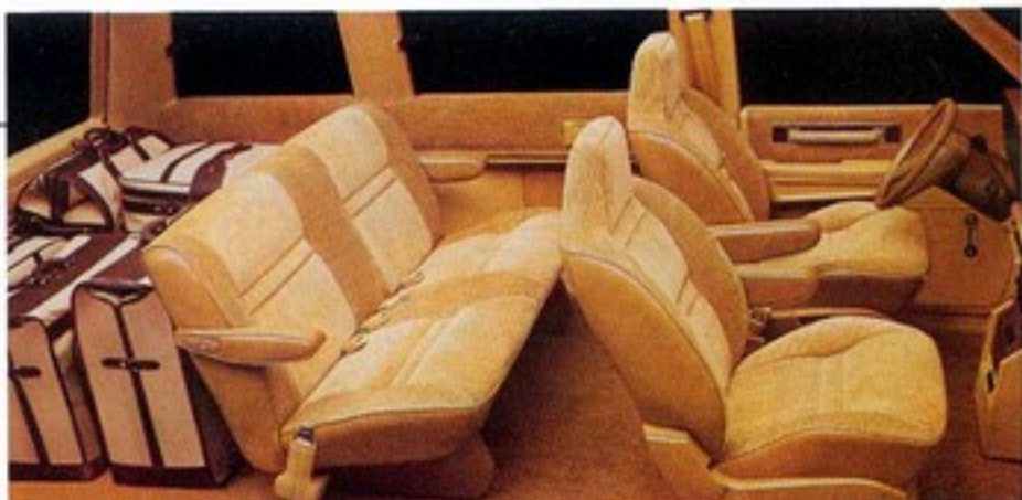
Standard Voyager LE five-passenger seating, shown in Light/Medium Tan.

There are three Voyager models. The top-of-the-line Voyager LE, mid-line Voyager SE, and the base Voyager. Every Voyager's long list of standard features includes front-wheel drive, 2.2-liter engine and five-speed manual transaxle, power steering and brakes, tinted glass, electronically tuned AM radio with integral digital clock, and liftgate wiper/washer.