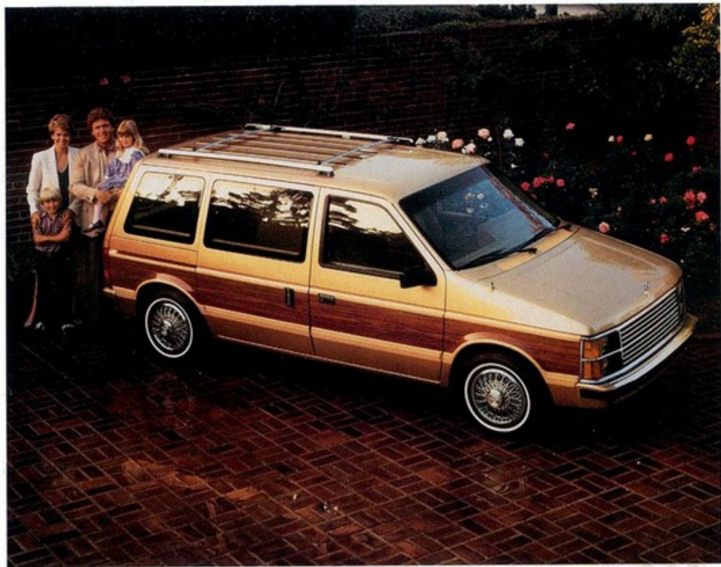
Voyager LE, shown in Gold Dust Crystal Coat.

The 1985 Plymouth Voyager combines outstanding human engineering with all the features that make for happy family motoring.