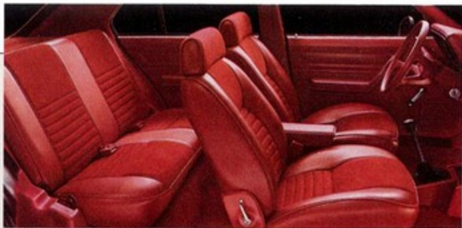
Standard Horizon interior, shown in Red.

Horizon's standard instrument panel includes speedometer, voltmeter, trip odometer, low oil pressure warning light, engine coolant temperature light and fuel gauge. An all-new shift indicator light (with manual transaxle only) even tells you when to shift gears.