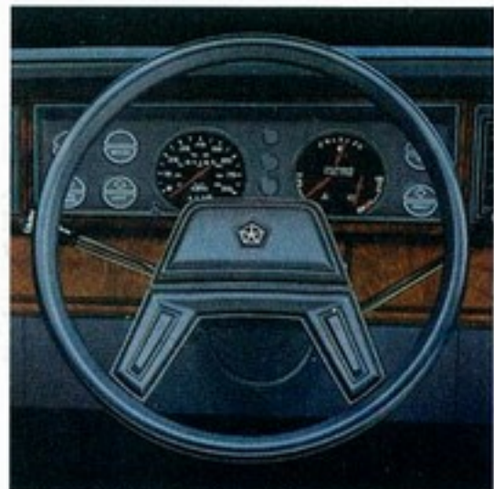
Reliant LE instrument panel.