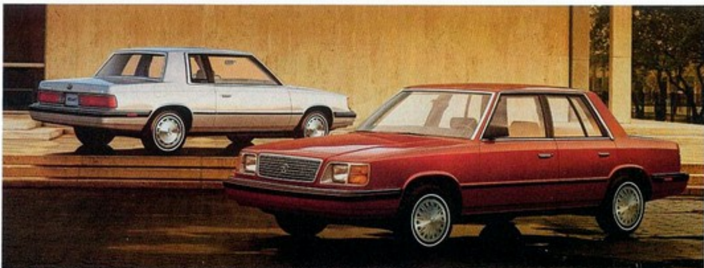
Left: Reliant SE two-door, shown in Radiant Silver Crystal Coat. Right: Reliant SE four-door, shown in Garnet Red Pearl Coat.†