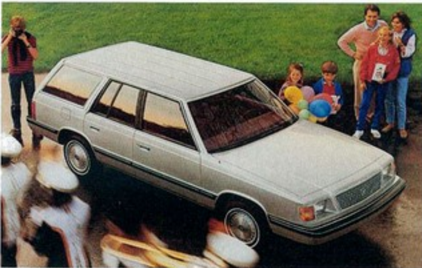
Reliant SE wagon, shown in Radiant Silver Crystal Coat.