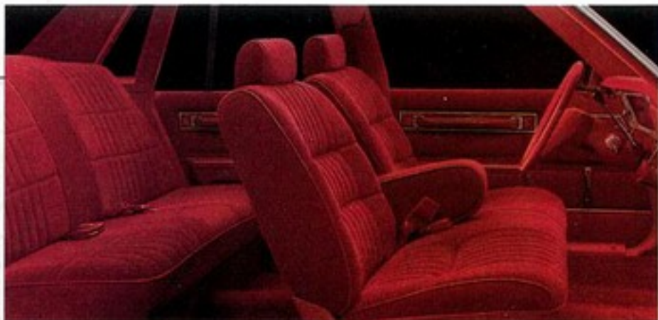
Caravelle SE standard cloth bench seat, shown in Red.

Under its stylish hood, Caravelle SE gives you a standard transverse-