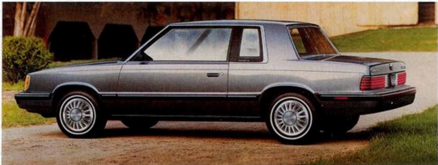
Reliant LE two-door, shown in Gunmetal Blue Pearl Coat.*