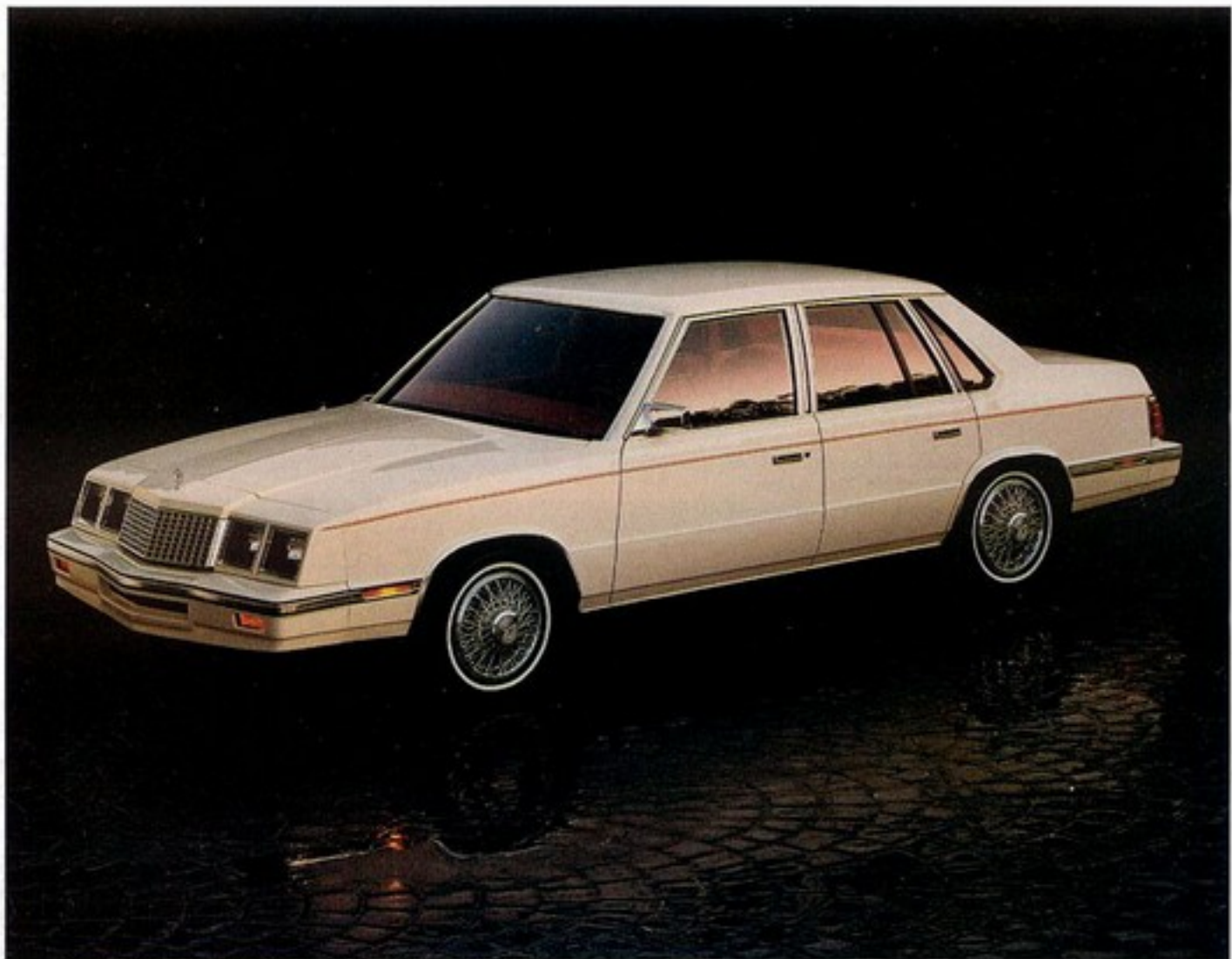
Caravelle SE, shown in White Crystal Coat.

Whether you go for the ample power of Caravelle SE's standard engine or the extra punch of turbocharging, you'll find the Plymouth Caravelle SE combines affordability, roadability and comfort beautifully.