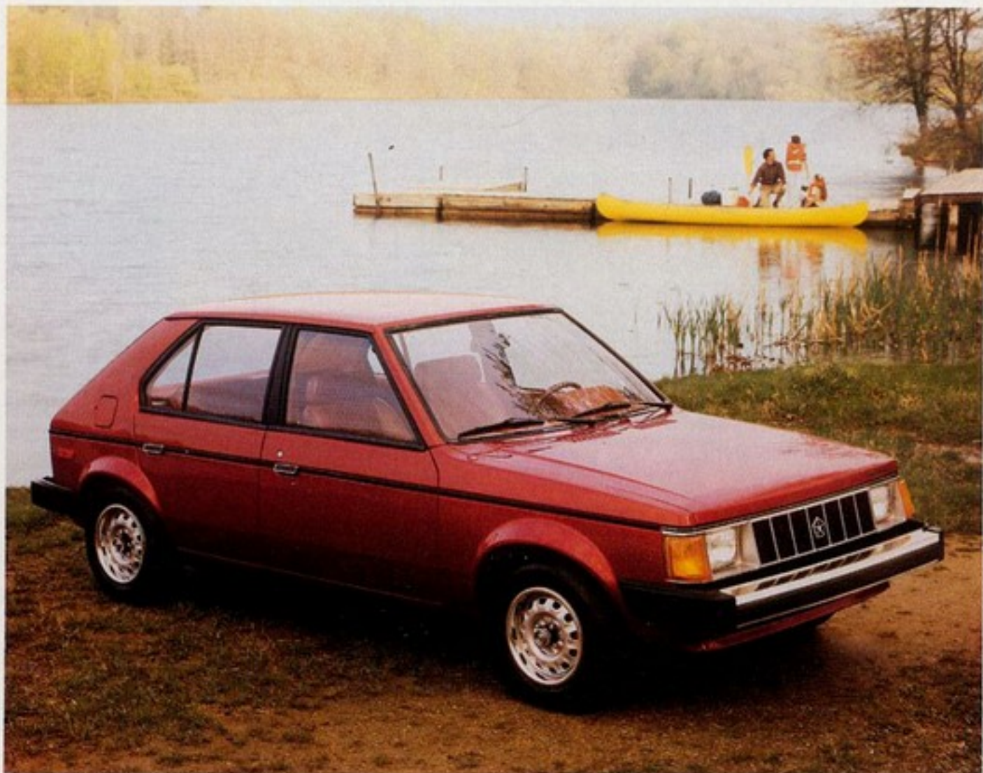
Horizon, shown in Garnet Red Pearl Coat.*

Choose the 1985 Horizon or Horizon SE for top value and features. Horizon value is virtually unbeatable. Match it. (If you can!)