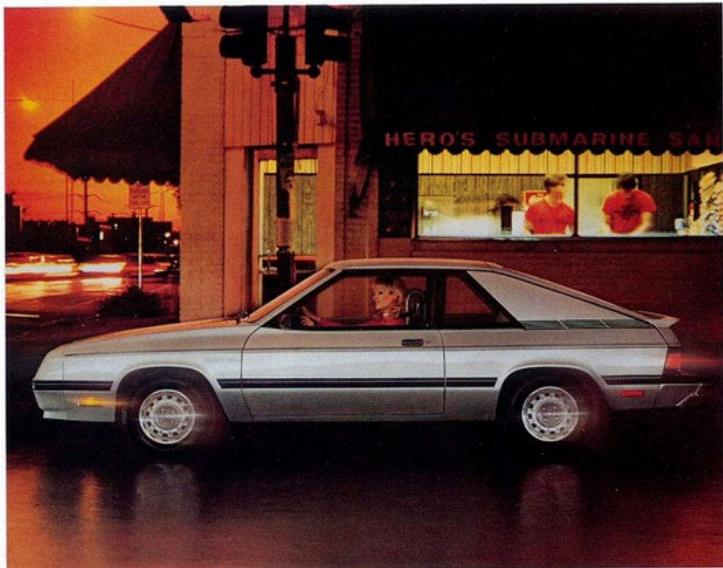
Turismo Duster, shown in Radiant Silver Crystal Coat.

Turismo comes with a standard 1.6-liter four-cylinder engine and four-speed manual transaxle with over-drive, as well as power brakes, and deluxe intermittent wipers. Interior comforts include standard cloth-and-vinyl low-back front bucket seats with dual recliners, Rallye instrument cluster, power liftgate release, and tinted glass. Choose the Turismo that's right for you—and enjoy!