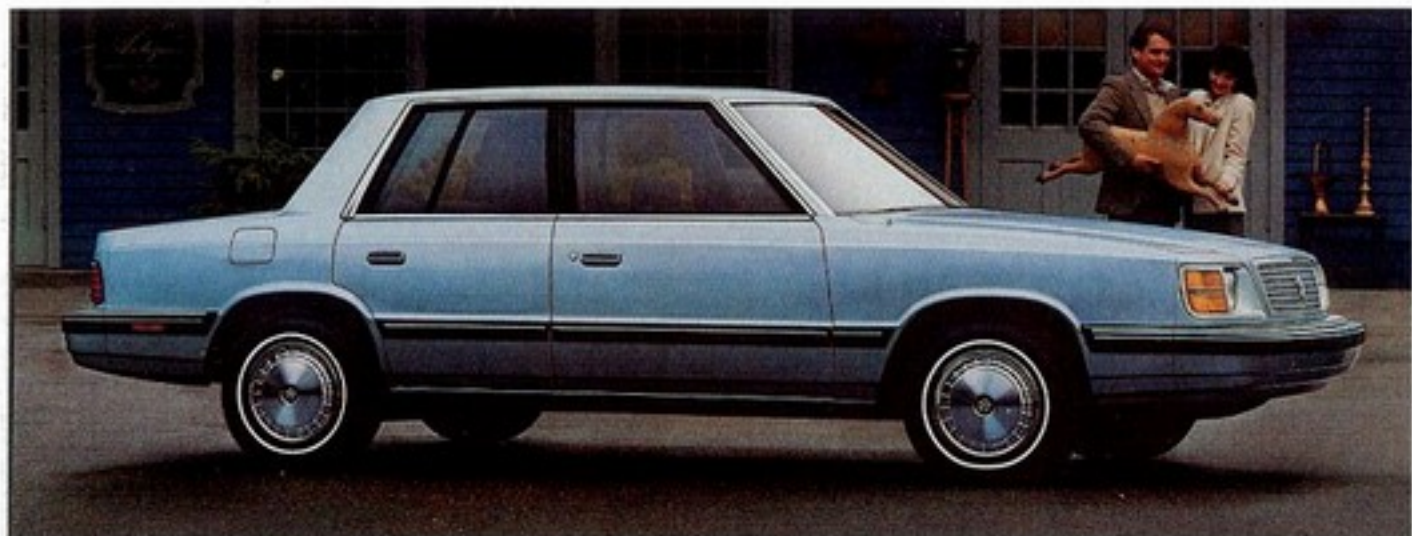
Reliant LE four-door, shown in Ice Blue Crystal Coat.

Standard features make the base Plymouth Reliant a value leader. They include front-wheel drive, a 2.2-liter