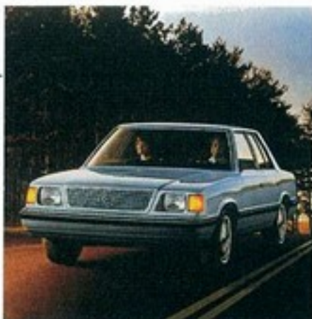
Reliant LE four-door, shown in Ice Blue Crystal Coat.

Reliant's padded instrument panel comes with a new shift indicator light (with manual transaxle only), parking