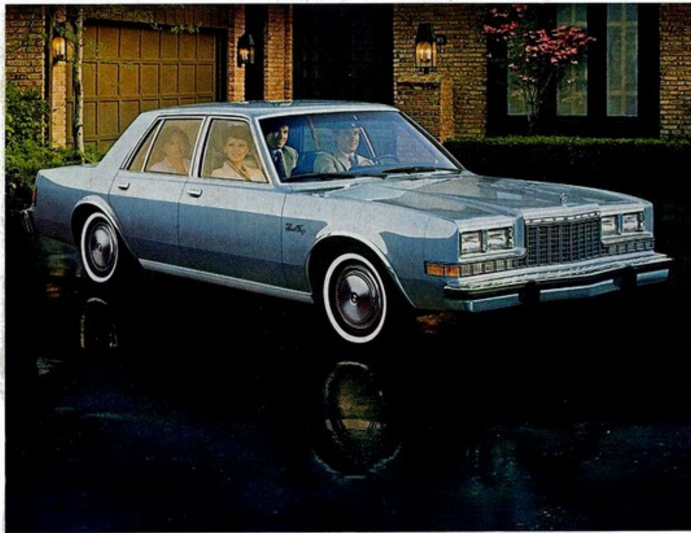
Gran Fury Salon, shown in Ice Blue Crystal Coat.

Allowances for car rental and towing are also included. Ask your dealer for details. Buckle up for safety.