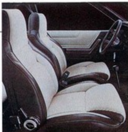
Turismo Duster Interior.

Turismo 2.2 is an aggressive road car for the serious driver. The standard high-performance 2.2-liter engine, five-speed manual transaxle with close-ratio gearing and over-drive, sport suspension, performance exhaust, and 14-inch Rallye road