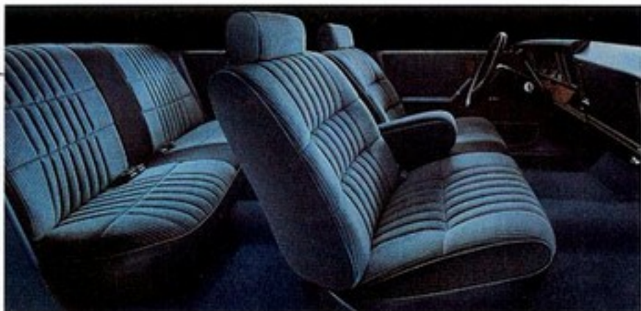
Reliant LE four-door interior, shown in Medium / Dark Blue.

Reliant LE lives up to its luxury image with standard interior comforts such as special sound insulation, deluxe intermittent windshield wipers, cloth-and-vinyl front bench seat with center armrest, cloth door trim panels with woodtone applique, and a passenger side visor vanity mirror with map/mirror light.