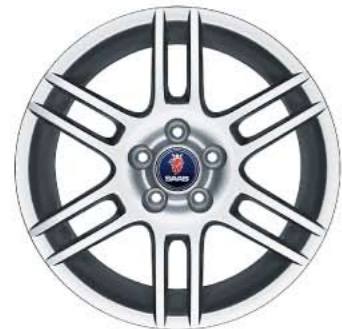
6-spoke Split 17x7"