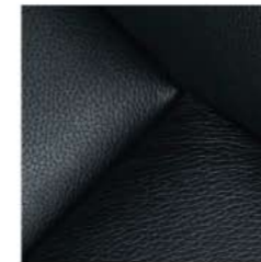
Premium natural leather sport, Black (Optional)