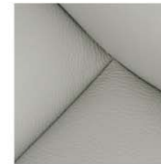
Premium natural leather sport, Parchment (Optional)