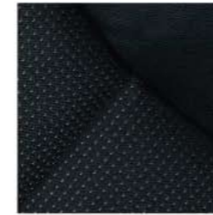
Leather/textile Thila sport, Black