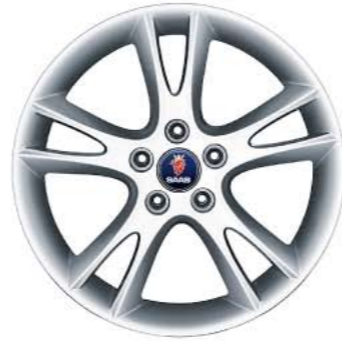
5-spoke Twin 17x7.5" (ALU 62)