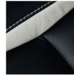
Leather Aero sport, Black/Parchment