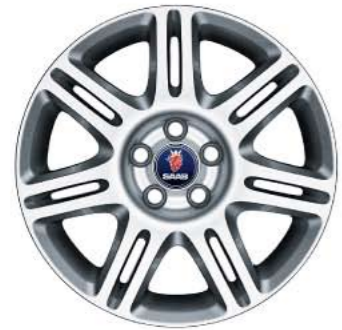
7-spoke Twin 17x7"