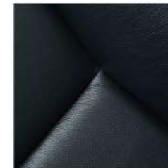
Leather sport, Black (Optional)