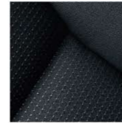
Sports seats woven textile/Thila, Black