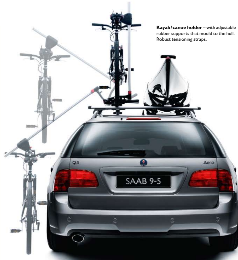
Kayak/canoe holder – with adjustable rubber supports that mould to the hull. Robust tensioning straps.

Equipment may vary from one market to another. For more detailed information, please see the separate brochure: Saab 9-5 Equipment and Prices. Available at your Saab dealer.