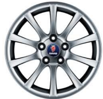
10-spoke 16x6.5" (ALU 70)