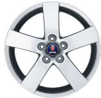
5-spoke EVO 17x7" (ALU 52)