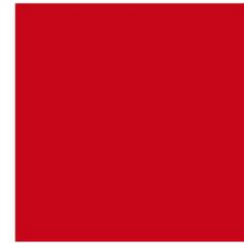
2 Laser Red