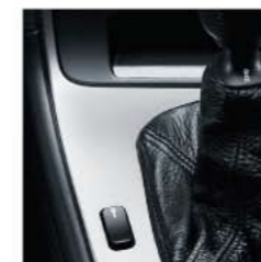
Tinted metallic-effect centre console trim (Optional)