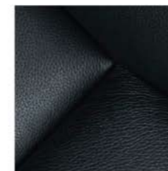
Premium natural leather sport, Black (Optional)