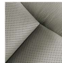
Leather sport ventilated, Parchment (Optional)