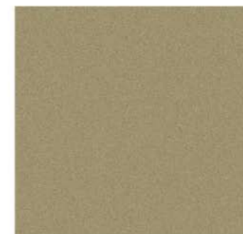
7 Pepper Green metallic