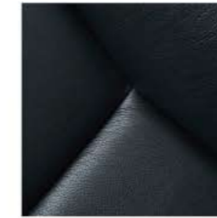
Leather sport, Black (Optional)