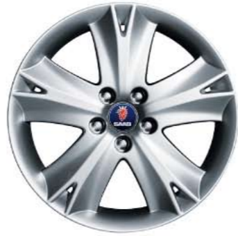
5-spoke High Split 17x7.5" (ALU 74)