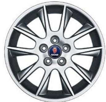
10-spoke 17x7" (ALU 39)