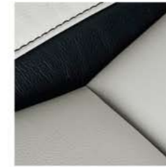
Leather Aero sport, Parchment/Black