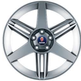
3-spoke Double Blade 18x8"