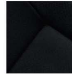
Woven textile, Black (Optional)