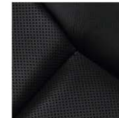
Leather sport ventilated, Black (Optional)