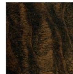
Dark walnut veneer facia / trim (Optional)

Vector interior with Black leather/textile Thila sport upholstery. Leather upholstery refers to leather seating surfaces.