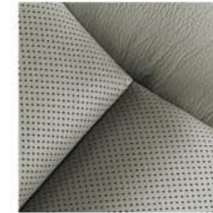
Leather sport ventilated, Parchment (Optional)