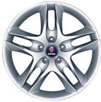
5-spoke Double Wing 17x7.5"