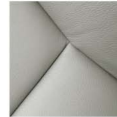
Leather sport, Parchment (Optional)