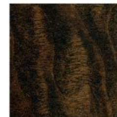
Dark walnut veneer facia/trim (Optional)

Linear interior with Black textile/Thila sport upholstery. Leather upholstery refers to leather seating surfaces.