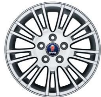
9-spoke Double 16x6.5" (ALU 54)