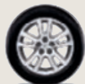
17" Available Machined Alloy 2 (XE)