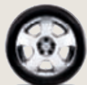
17" Available Chrome Trim (XE)