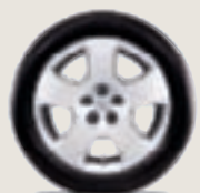
17" Standard Trim (XE)