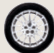
18" Standard Ultrabright Alloy (XR)

Touring tires designed for quietness and excellent performance characteristics are used on both XE and XR models: XE models are equipped with P225/50R17 by Hankook, and XR models with P225/50R18 by Goodyear.