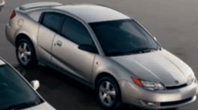
ION quad coupe