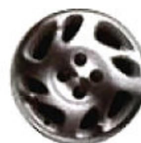
SC1—Optional Alloy Wheel