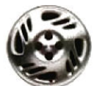
SC2—Optional Alloy Wheel

*Available for a limited time. Includes Black/Chrome exterior badging. Only available with Black cloth or Black Leather Appointments. Requires option package. (SC2 only)