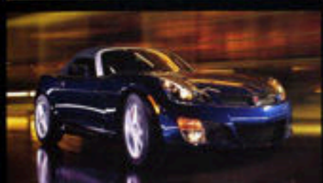
SKY Red Line