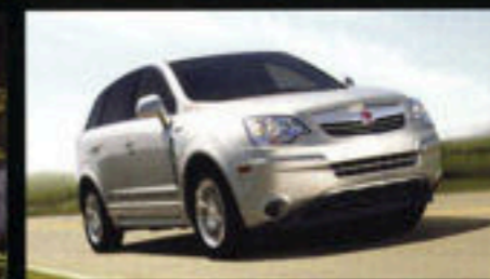
VUE 2-Mode Hybrid