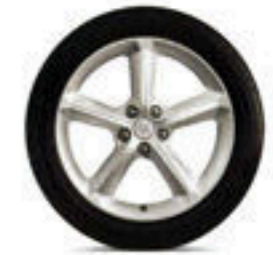
18" PAINTED ALLOY