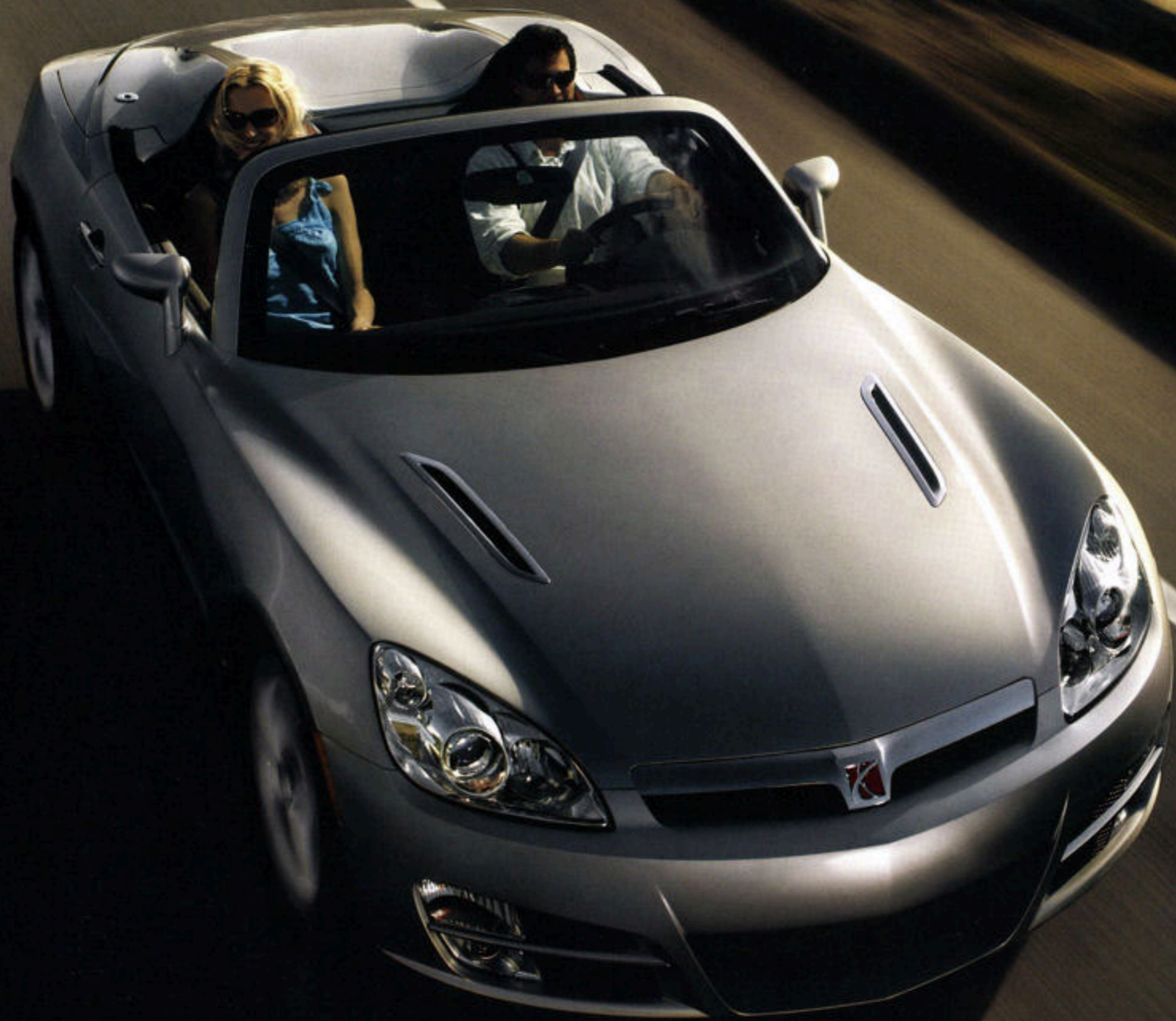
SKY in Silver Pearl