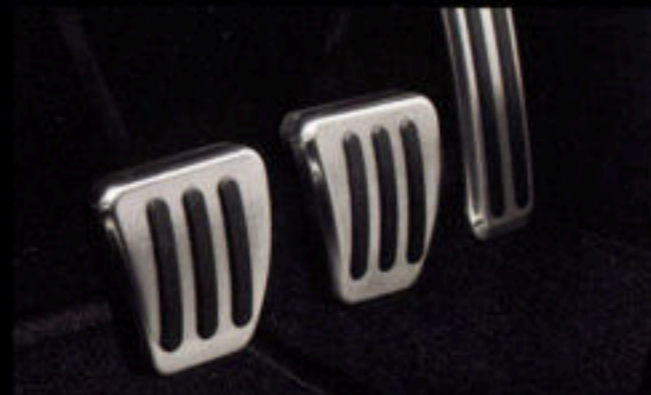
Sport Pedal Package