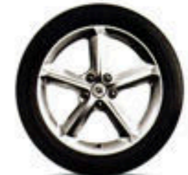
18" CHROME ALLOY (Optional)