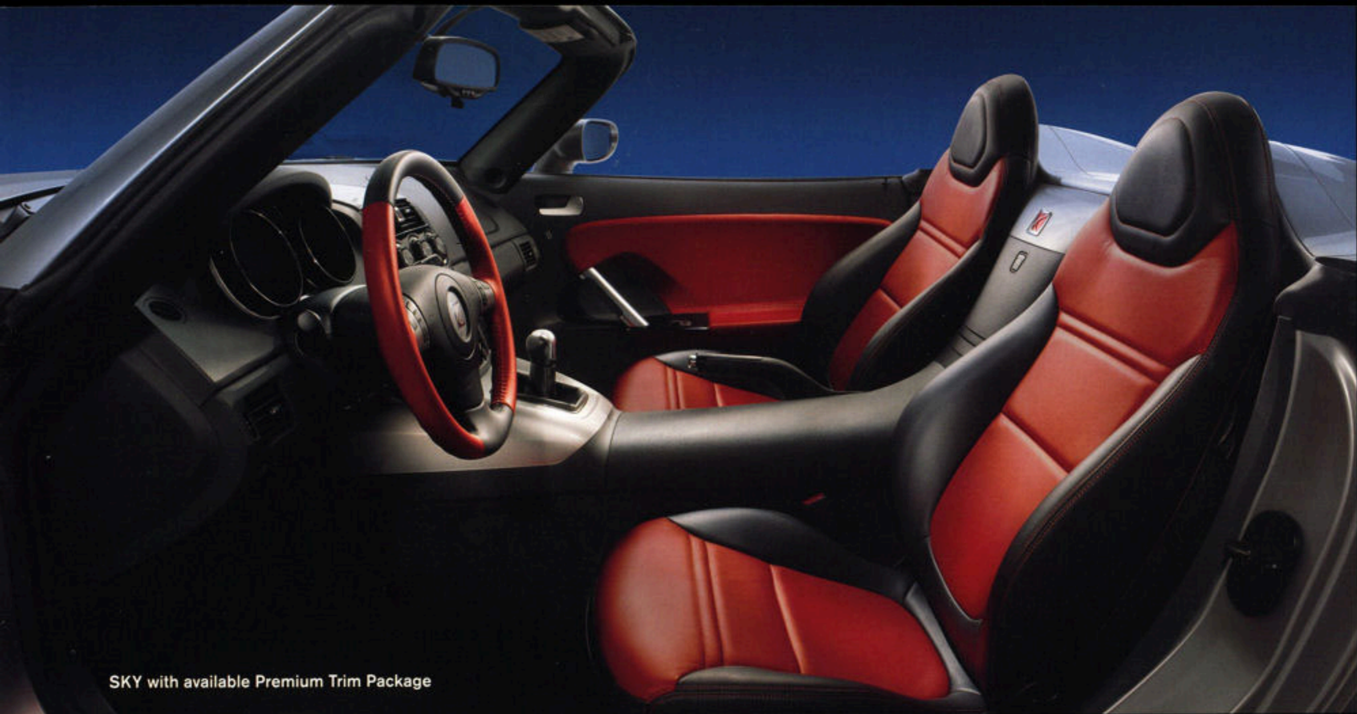
SKY with available Premium Trim Package