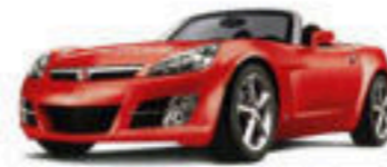
Chili Pepper Red