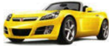
Sunburst Yellow (extra-cost option)