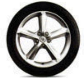
18" POLISHED ALLOY (Red Line)