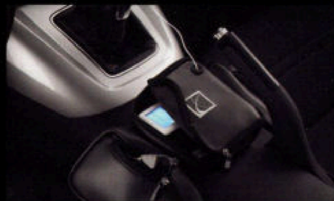
Console Saddle Bag