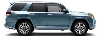
SHORELINE BLUE PEARL 10 Black 9 or Sand Beige 9 interior