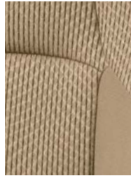
SR5 available sport fabric in Sand Beige