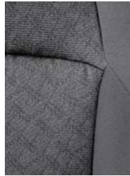
Trail water-resistant fabric in Graphite