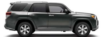
MAGNETIC GRAY METALLIC Black 9 or Graphite interior