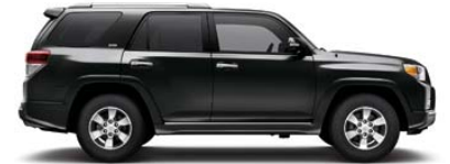
BLACK Black 9 Graphite or Sand Beige 9 interior

For complete details about Toyota's warranties, please visit www.toyota.com , refer to the applicable Warranty and Maintenance Guide or see your Toyota dealer.