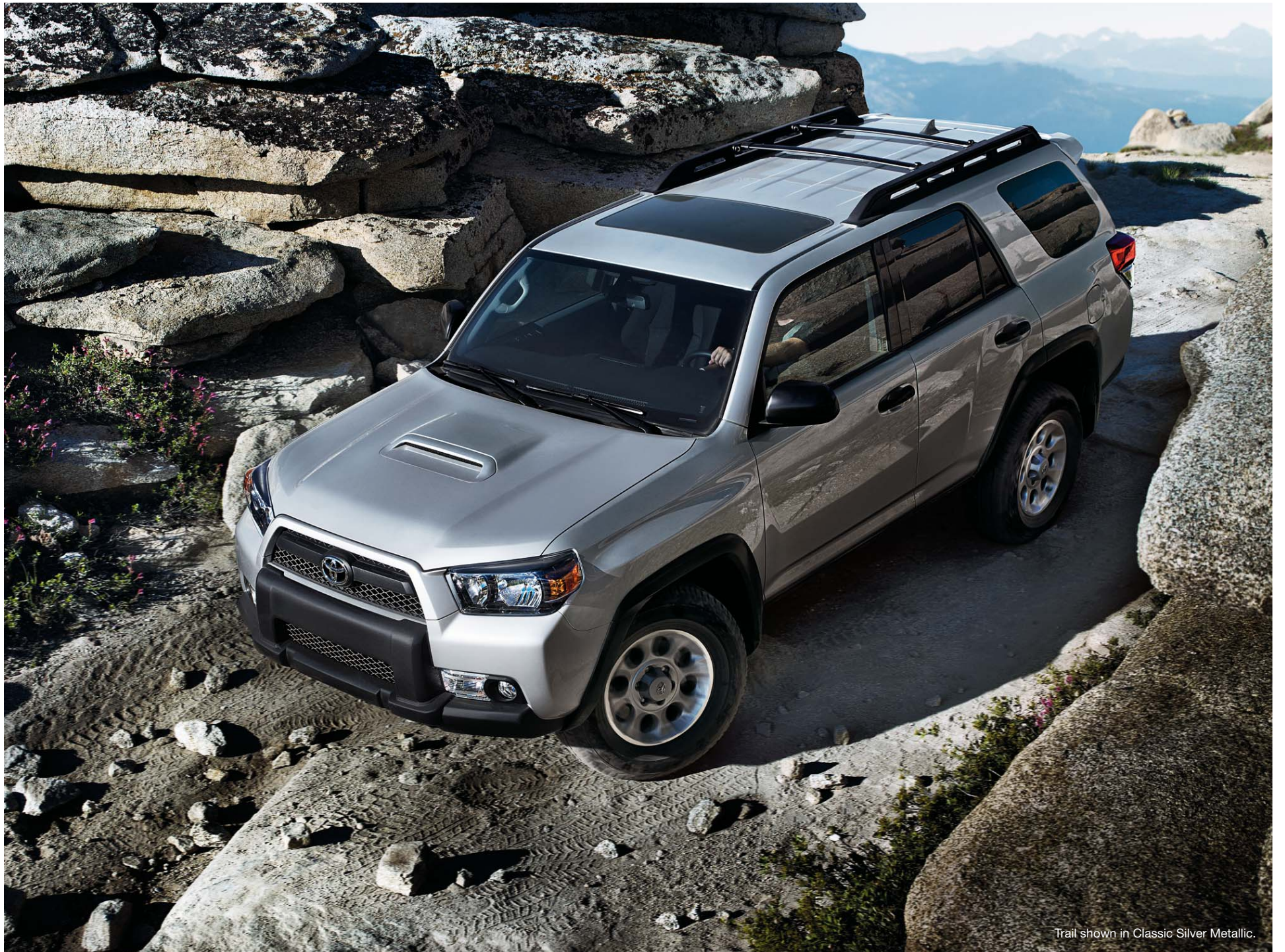
Trail shown in Classic Silver Metallic.