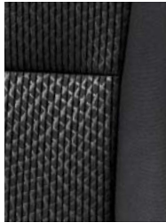
SR5 fabric in Graphite