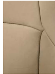
SR5 available/Limited standard leather in Sand Beige