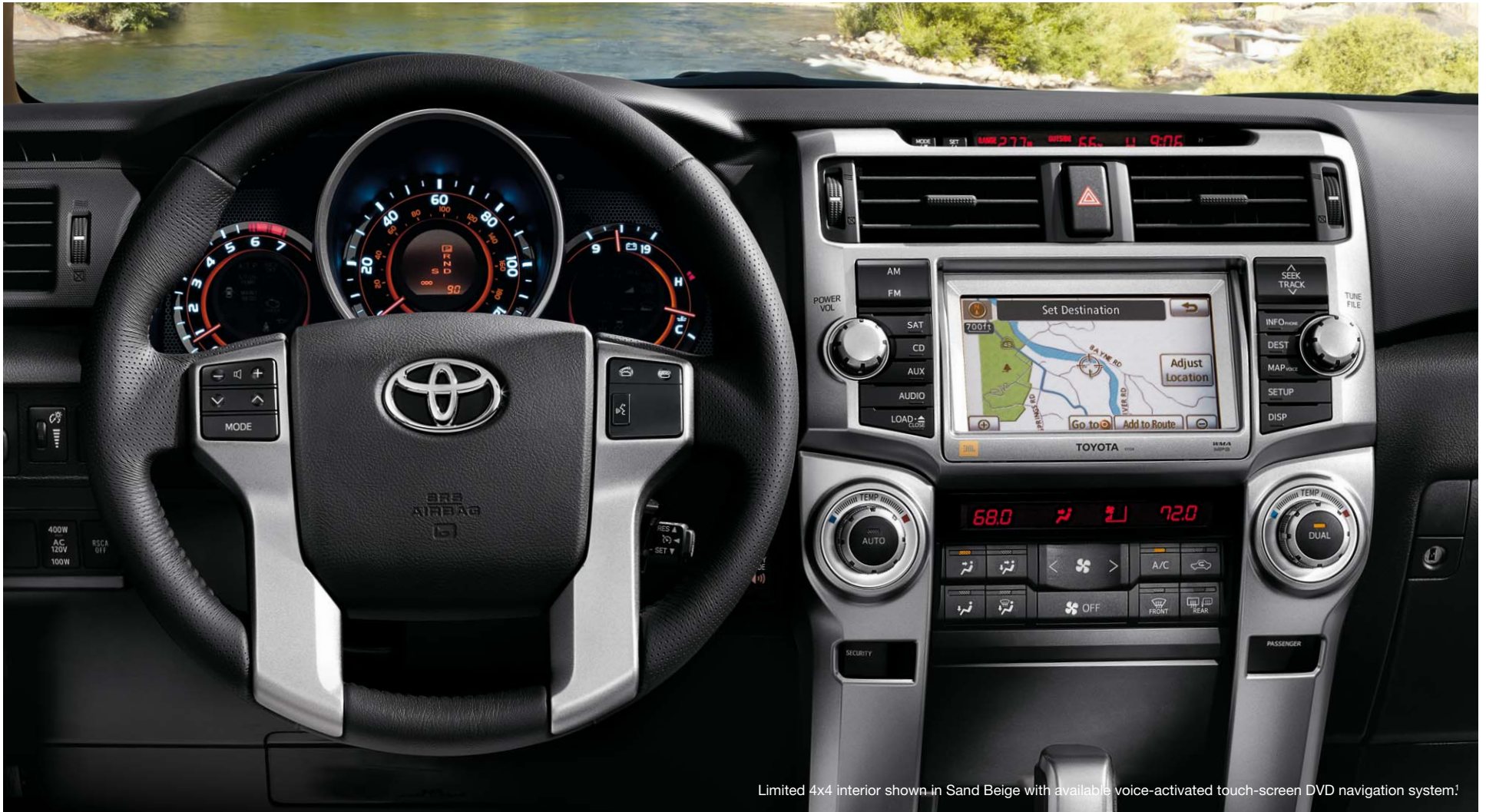
Limited 4x4 interior shown in Sand Beige with available voice-activated touch-screen DVD navigation system. 1

In a word, commanding. As the driver, you sit up high in the spacious cabin, your right foot firmly in charge of 4Runner's rugged capability, with the thick-rimmed steering wheel in your grip and large, easily legible dials in your gaze. You're surrounded by available technologies like voice-activated touch-screen DVD navigation, 1 hands-free phone and music streaming via Bluetooth ®2 wireless technology and an integrated backup camera. 3 Strength has seldom felt so rewarding.