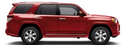
SALSA RED PEARL 11 Black 9 Graphite or Sand Beige 9 interior