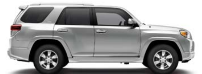
CLASSIC SILVER METALLIC Black 9 or Graphite interior