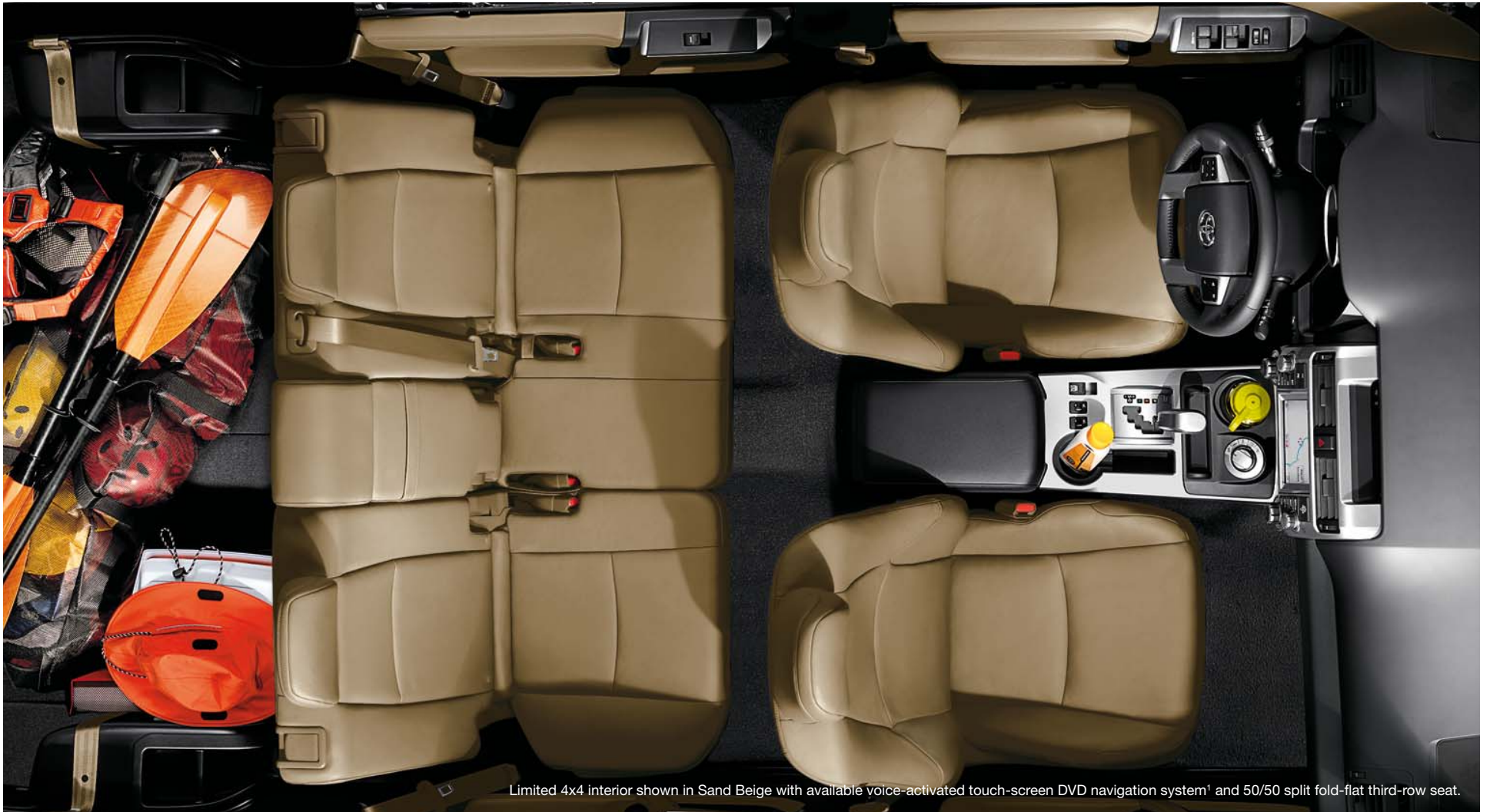
Limited 4x4 interior shown in Sand Beige with available voice-activated touch-screen DVD navigation system 1 and 50/50 split fold-flat third-row seat.