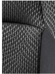
SR5 available sport fabric in Graphite