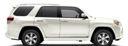
BLIZZARD PEARL 9,12 Black 9 Graphite or Sand Beige 9 interior