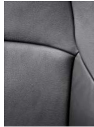
SR5 available/Limited standard leather in Black