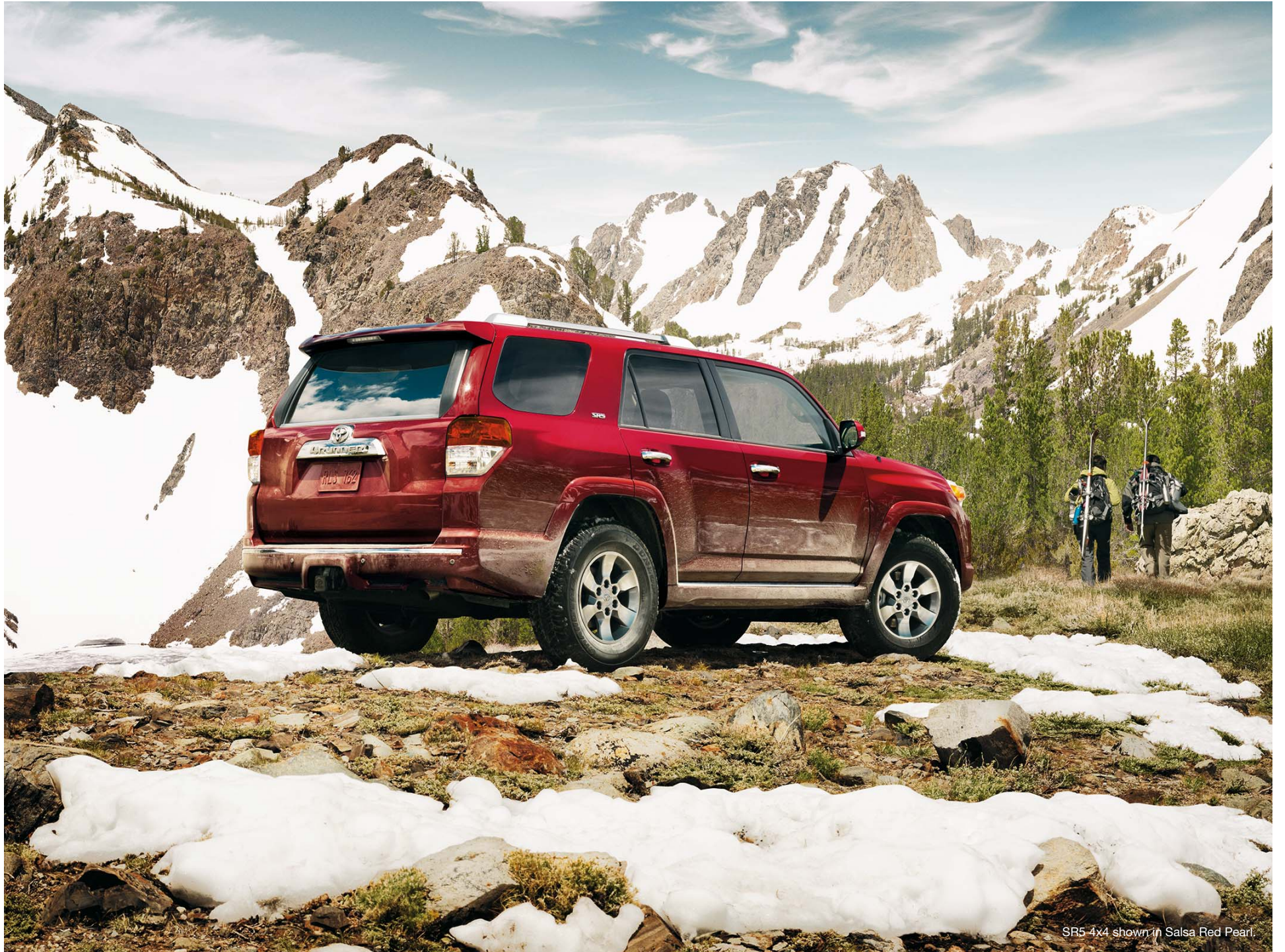
SR5 4x4 shown in Salsa Red Pearl.