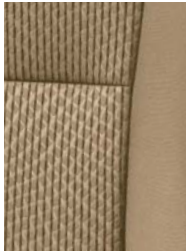
SR5 fabric in Sand Beige