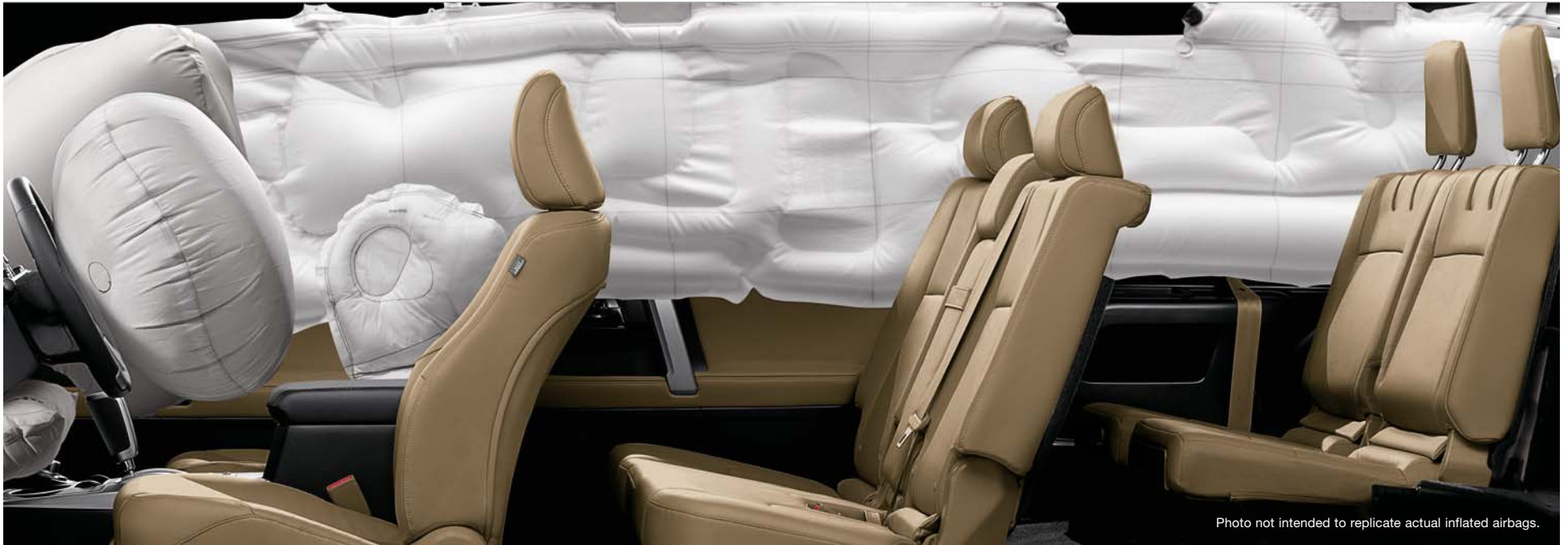
Photo not intended to replicate actual inflated airbags.

The 2011 4Runner comes standard with eight airbags 1 ! Toyota's rigorous crash testing has resulted in an occupant protection system that includes driver and front passenger airbags, driver and front passenger TAP (Thorax, Abdomen, Pelvis) seat-mounted side airbags, driver and front passenger and second-row (third-row airbags on models so equipped) Roll-Sensing side Curtain Airbags (RSCA), and driver and front passenger knee airbags.