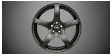
TRD 18-in. 5-spoke wheels (Silver or Black)