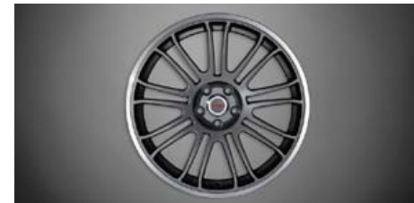
TRD 18-in. multi-spoke alloy wheels