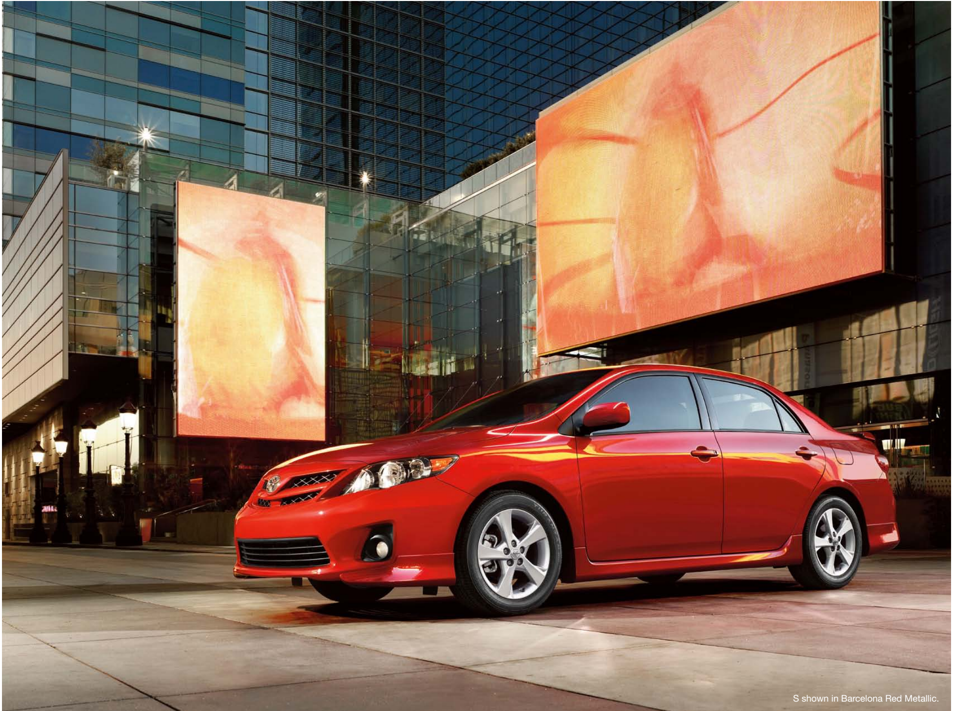
S shown in Barcelona Red Metallic.