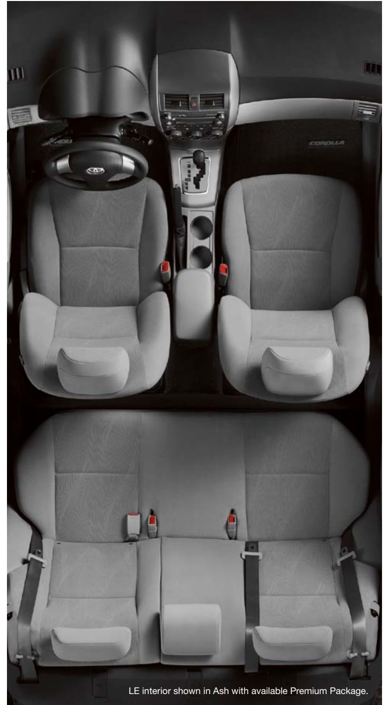
LE interior shown in Ash with available Premium Package.

Corolla may be a compact car, but you wouldn't know it to peek in the trunk. In the back, you'll be pleasantly surprised to find a full 12.3 cubic feet 2 of cargo space for road trip necessities.