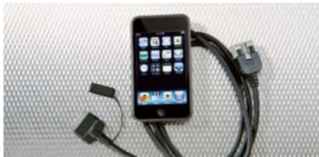
Interface kit 21 for iPod ®11