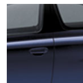
Brilliant Blue Pearl with Warm Gray interior