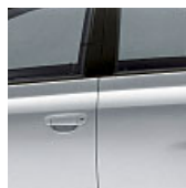
Alpine Silver Metallic with Shadow Gray interior