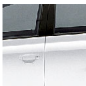
Super White with Warm Gray interior