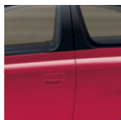
Absolutely Red with Shadow Gray interior