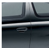
Black Sand Pearl with Shadow Gray interior