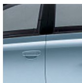
Seafoam Blue Metallic with Shadow Gray interior