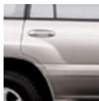
CHampagne Pearl with Ivory or Shadow Gray Interior