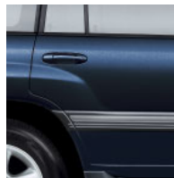
Atlantis Blue Mica with Ivory or Shadow Gray Interior