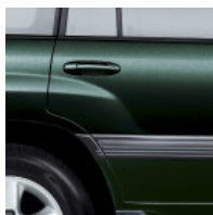
Imperial Jade Mica with Ivory or Shadow Gray Interior