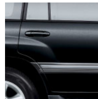
Black with Ivory or Shadow Gray Interior