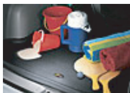
Xtreme Cargo Mat $79.00