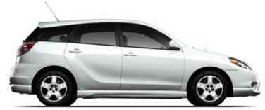
XR AWD 4-Speed Automatic Transmission (1914) MSRP* Starting At: $18,985.00