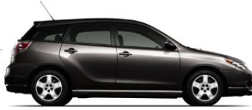
FWD 4-Speed Automatic Transmission (1902) MSRP* Starting At: $15,910.00