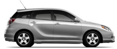
AWD 4-Speed Automatic Transmission (1904) MSRP* Starting At: $17,645.00