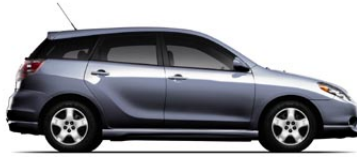
XR FWD 4-Speed Automatic Transmission (1912) MSRP* Starting At: $17,420.00