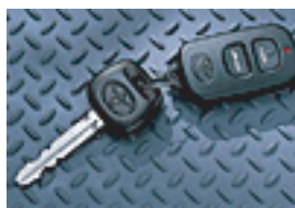
VIP Security System RS3200 Plus - $359.00