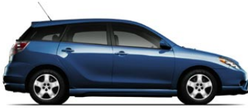
XR FWD 5-Speed Manual Transmission (1911) MSRP* Starting At: $16,590.00