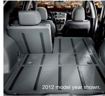
2012 model year shown.

The compact Matrix is loaded with supersize versatility. The front passenger seat folds down and the 60/40 split fold-down rear seat folds flat to open up an incredible amount of cargo room. Whether you're packing a sound board or a snowboard, the ever-flexible Matrix has a configuration to match your gear.