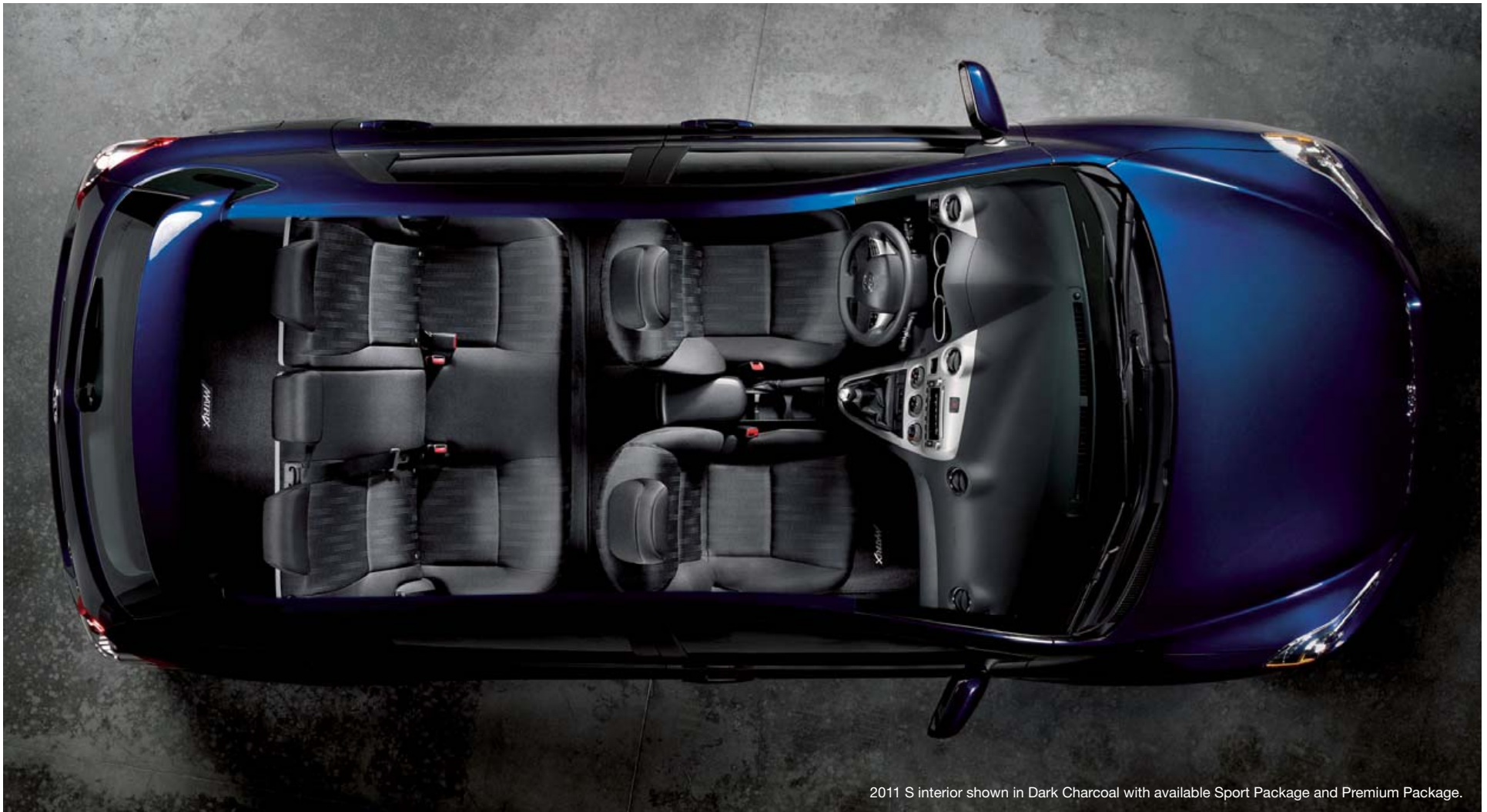
2011 S interior shown in Dark Charcoal with available Sport Package and Premium Package.