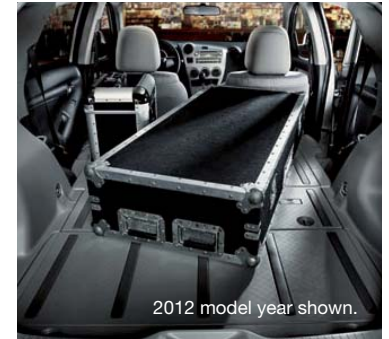
2012 model year shown.