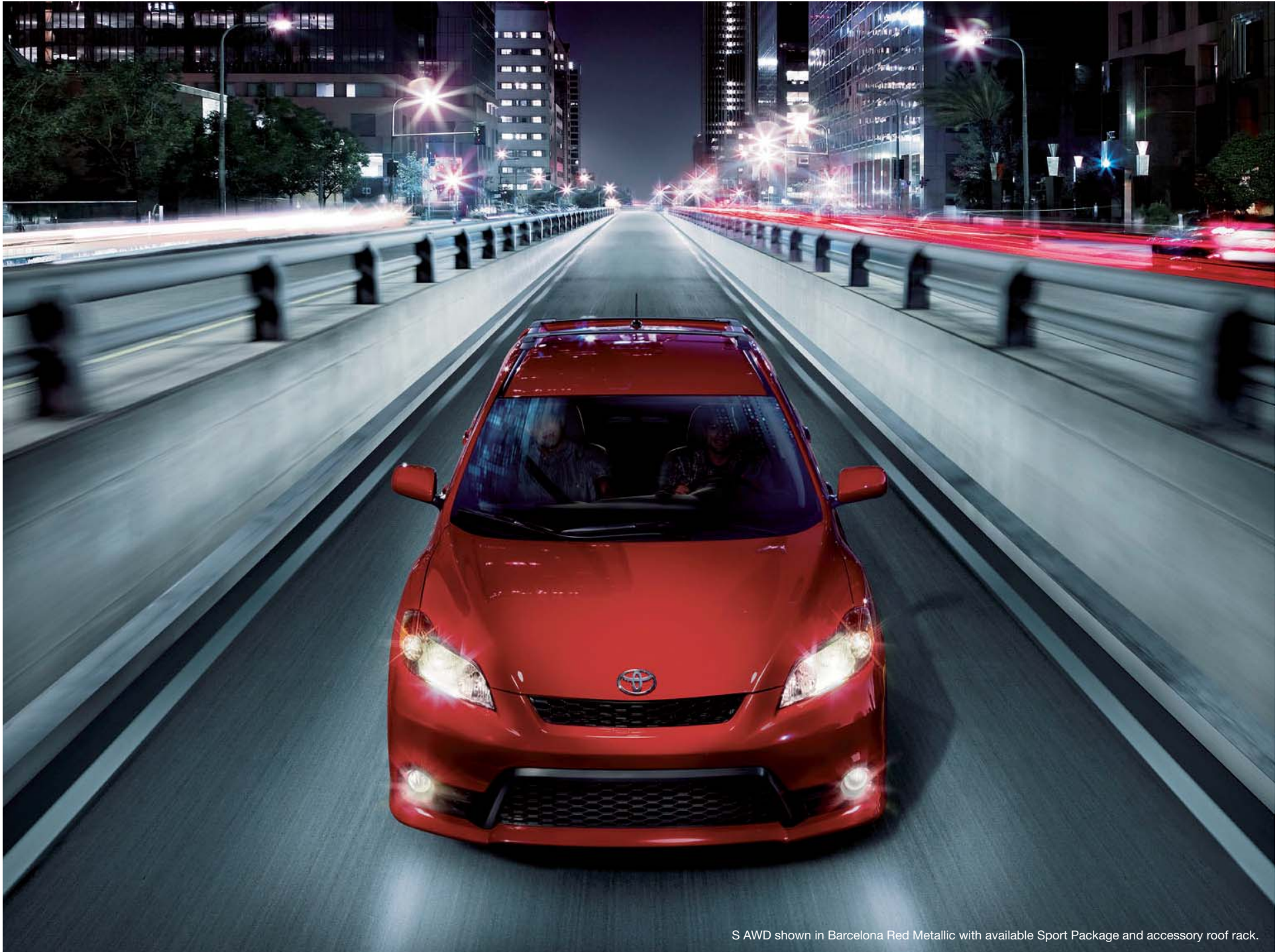
S AWD shown in Barcelona Red Metallic with available Sport Package and accessory roof rack.