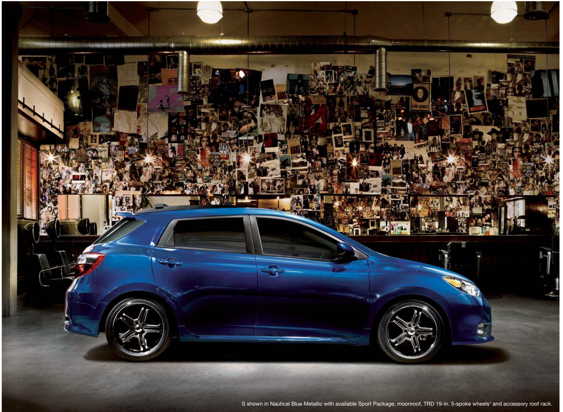
S shown in Nautical Blue Metallic with available Sport Package, moonroof, TRD 19-in. 5-spoke wheels 1 and accessory roof rack.