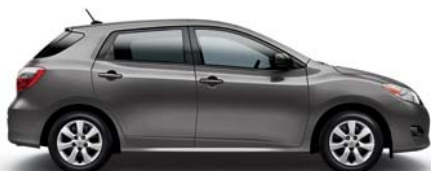
MAGNETIC GRAY METALLIC