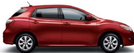
BARCELONA RED METALLIC