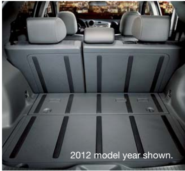
2012 model year shown.