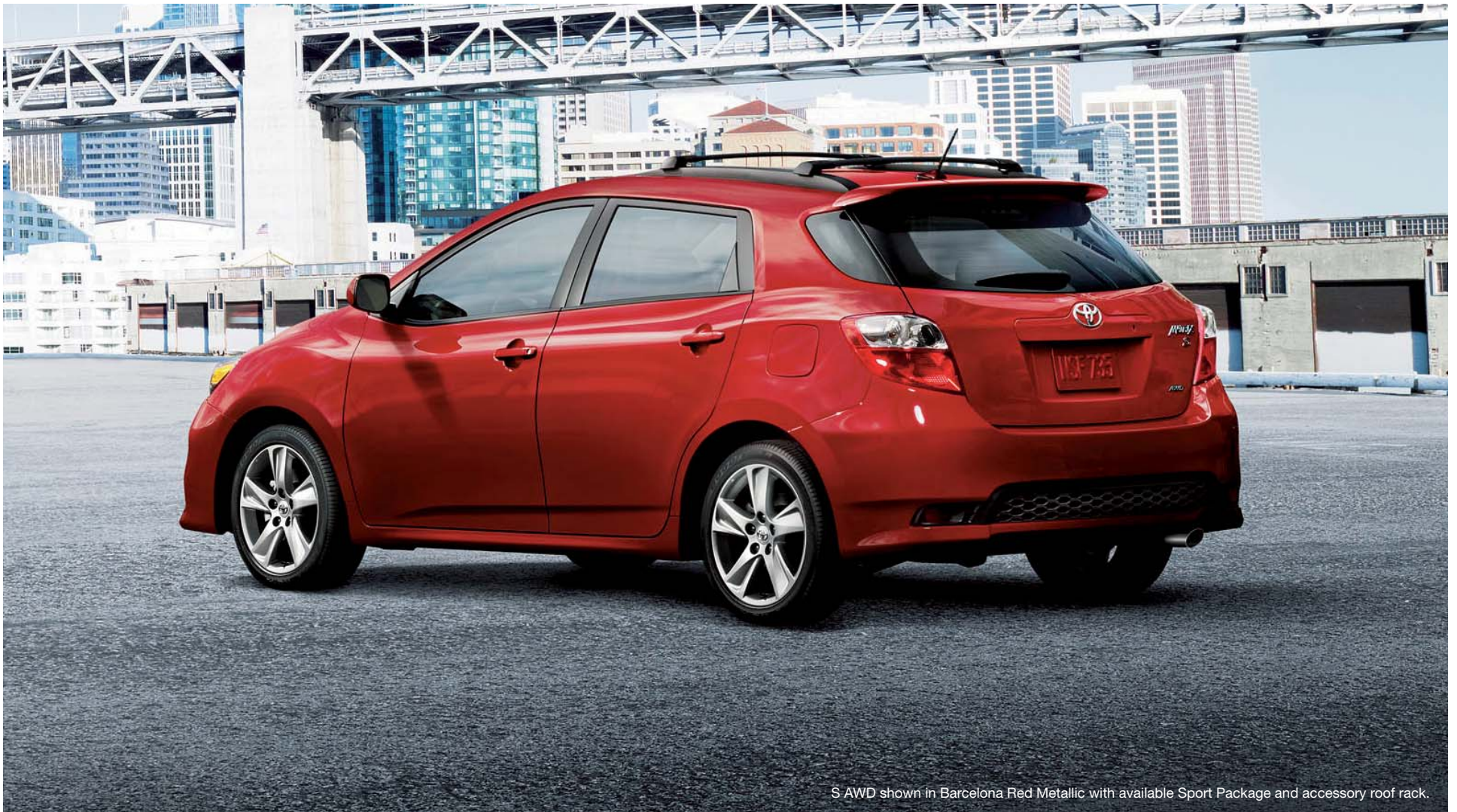
S AWD shown in Barcelona Red Metallic with available Sport Package and accessory roof rack.