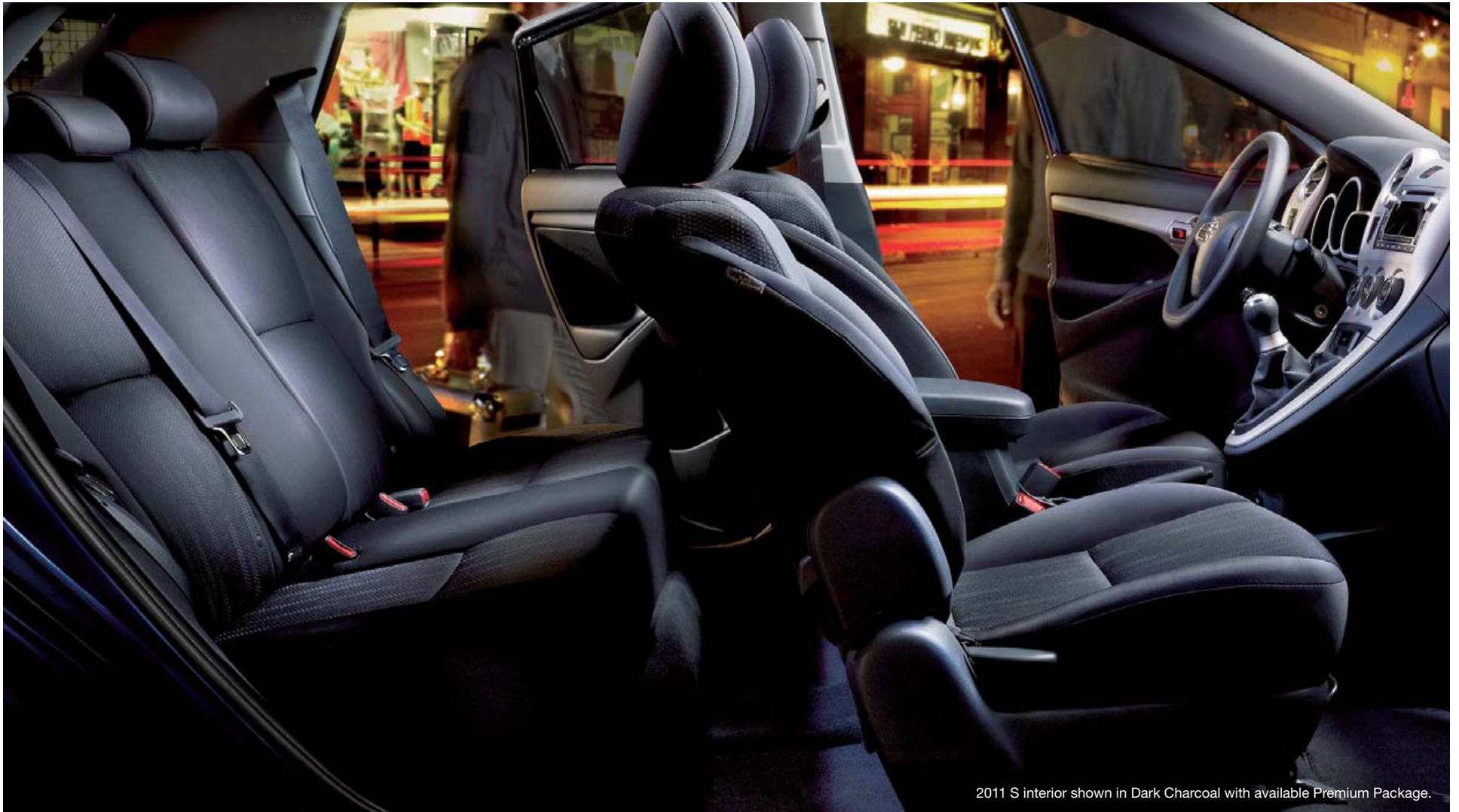
2011 S interior shown in Dark Charcoal with available Premium Package.

The incredibly versatile Matrix works well for everybody — with the possible exception of couch potatoes. This is a vehicle designed for those who don't just find the action, they create the action. And with spacious seating for five and its aggressive styling, Matrix makes it easy to find four friends to join you.