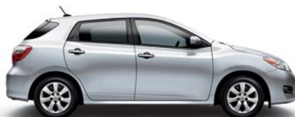
CLASSIC SILVER METALLIC