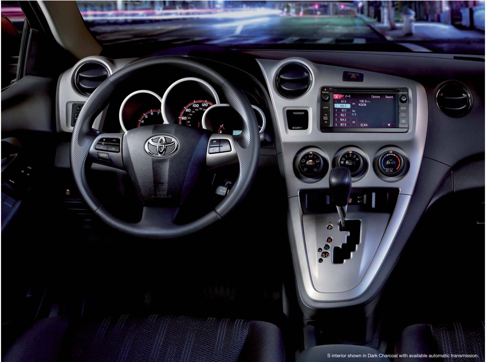
S interior shown in Dark Charcoal with available automatic transmission.