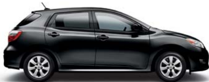
BLACK SAND PEARL