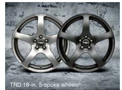
TRD 18-in. 5-spoke wheels 5