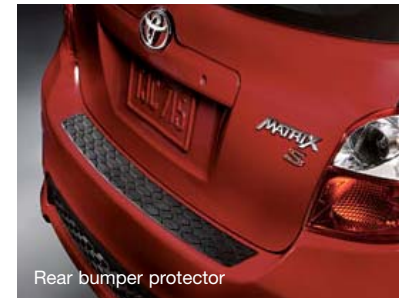
Rear bumper protector