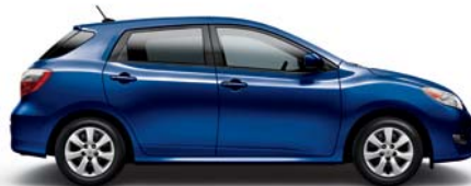
NAUTICAL BLUE METALLIC