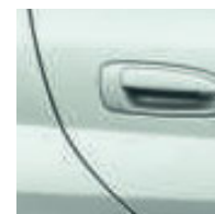
Aqua Ice Opalescent with Gray Interior