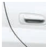
Super White with Gray Interior