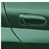
Electric Green Mica with Gray Interior