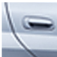
Blue Moon Pearl with Gray Interior