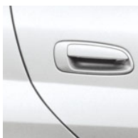
Silver Strata Metallic with Gray Interior